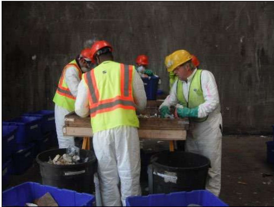
Figure 2-2 Field Sorting Crew