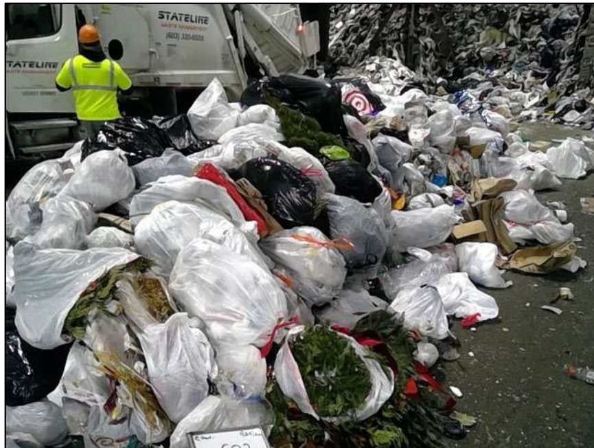
Figure 2-1 Tipped Load Awaiting Sample Collection

The field supervisor then placed the material for sorting in 35-gallon barrels and pre-weighed each barrel to ensure the sample used for sorting was at least 250 pounds. A white board with the sample number was placed in the barrel and staged for sorting by the field sorting crew. Figure 2-1 shows samples staged for sorting.