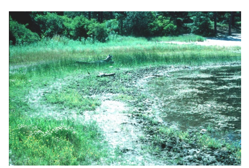
Coastal Plain Pondshore with vegetation zones.

Description: Coastal Plain Pondshores (CPPS) are herbaceous communities characterized by a distinct coastal plain flora on exposed pondshores in southeastern Massachusetts. Coastal plain ponds are shallow, highly acidic, low nutrient groundwater ponds in sandy glacial outwash, with no inlet or outlet. Water rises and falls with changes in the water table, typically leaving an exposed shoreline in late summer. Annual and inter-annual fluctuations in water levels are key to maintaining the community: low water years eliminate obligate aquatic plants and allow adapted plants to grow and high water years limit invasion by woody species. The community develops best in small ponds or bays of larger ponds with little space for wind sweep that causes wave and ice damage along shorelines on large ponds. The substrates are usually sand, sometimes with cobbles; a surface layer of organic muck occurs on some ponds and pondshores.