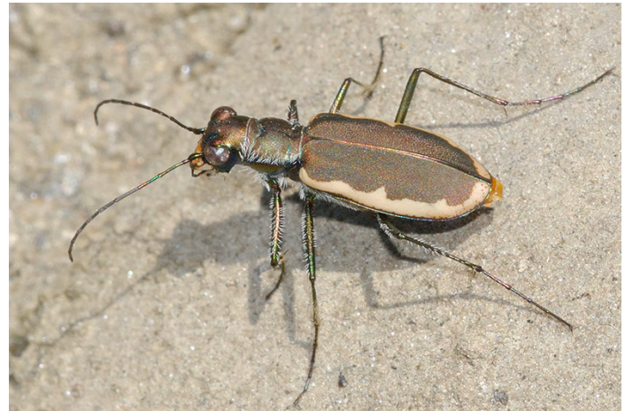
Cicindela marginipennis • MA: Franklin Co. • 31 Jul 2007 •

GEOGRAPHIC RANGE: The Cobblestone Tiger Beetle ranges from New Brunswick south to New Jersey, and west to Indiana and Kentucky, with disjunct populations in South Carolina and Alabama (NatureServe 2015). This