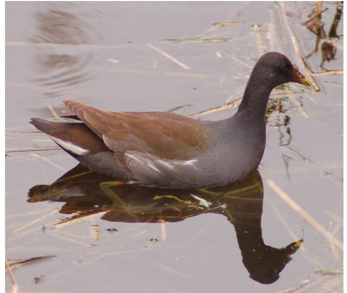
Common Gallinule.

SIMILAR SPECIES IN MASSACHUSETTS: The species most easily confused with the Common Gallinule is the American Coot, which is about the same size and is also slate gray, but has a conspicuous white bill with a dark band near the tip. The frontal shield is white with only a small reddish-brown area on the