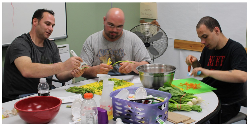
Left to right: Berkshire CCC clients prepare vegetables for Vegetarian Chilli during cooking class at the center.

The Office of Community Corrections (CCC) will be hosting three separate recognition ceremonies in the coming weeks to acknowledge the progress of their clients.