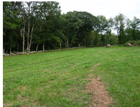
Cultural Grassland, recently mowed hayfield.