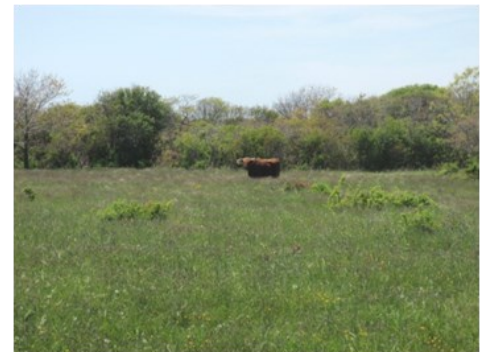
Lightly grazed pasture with mixed species.