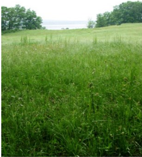
Cultural Grassland - hayfield with mixed grasses and forbs.

Description: Cultural Grasslands as a classification unit are intended to include grasslands that are cultivated or the results of cultivation dominated by non-native, agricultural grasses, maintained for pasture or hayfields; some airport grasslands and cemeteries with planted grasses would be included in the type. Cultural Grasslands occur in all areas of the state on a variety of soils, and surroundings reflect the regional variations. Most Cultural Grasslands are mowed at least annually to maintain the grassland stage.