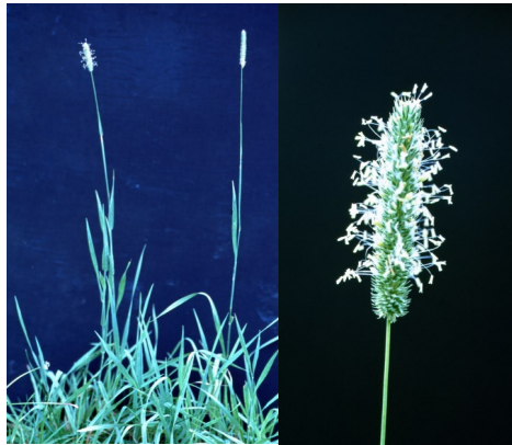
Timothy, plant and flower.

Differentiating from Related Communities: Cultural Grasslands are dominated by non-native grasses grown and maintained for agricultural or cultural purposes. Sandplain Grasslands - Inland Variant and Sandplain Grasslands are dominated by native grasses, often the distinctive little bluestem. Sandplain Heathlands and Sandplain Heathlands - Inland Variant are dominated by native shrubs and look shrubbier than grasslands with a shrub layer comprised of scrub oak, black huckleberry, and/or lowbush blueberry which may be dominant.