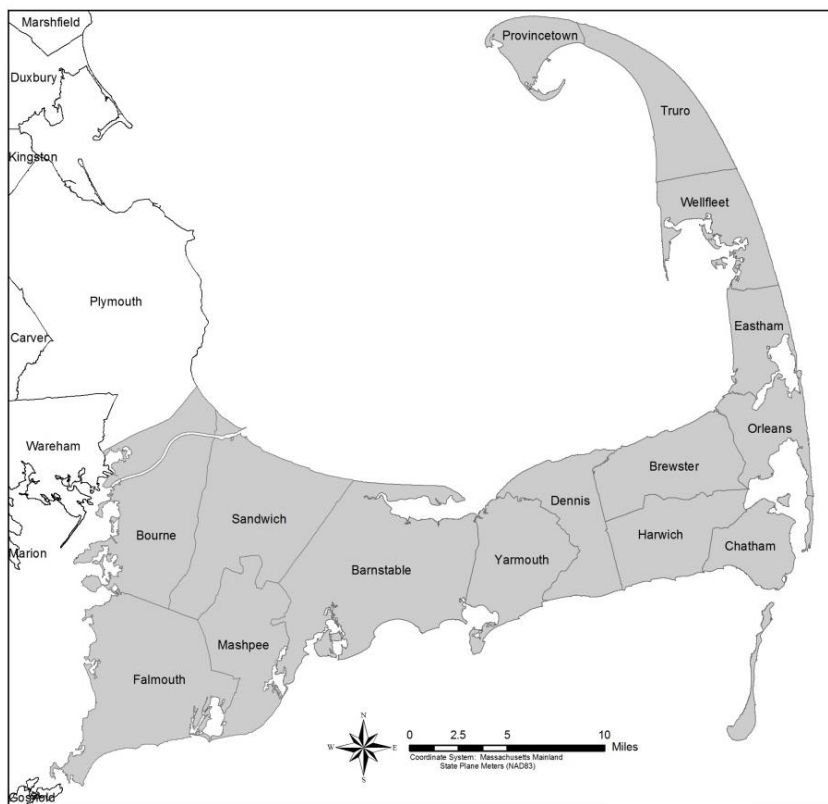
Figure 1. Communities within Barnstable County

This bulletin describes changes to the classification of EFOT that have been widely accepted by the oncology field since the time of the initial evaluation and revisits the incidence of EFOT in Barnstable County during 1995 to 2004 using this updated classification scheme. It also summarizes the incidence of EFOT in Barnstable County during more recent years, the 7-year time period of 2005 to 2011.