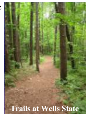
Trails at Wells State

The accessible trail at Wells State Park was reconstructed this past summer after being damaged by Hurricane Irene. This beautifully reconstructed trail has better surfacing and offers a new stone stabilized bridge. The loop trail takes you through some beautifully forested areas in and around a wetland area, where you are sure to find many interesting things to look at.