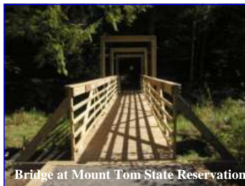
Bridge at Mount Tom State Reservation