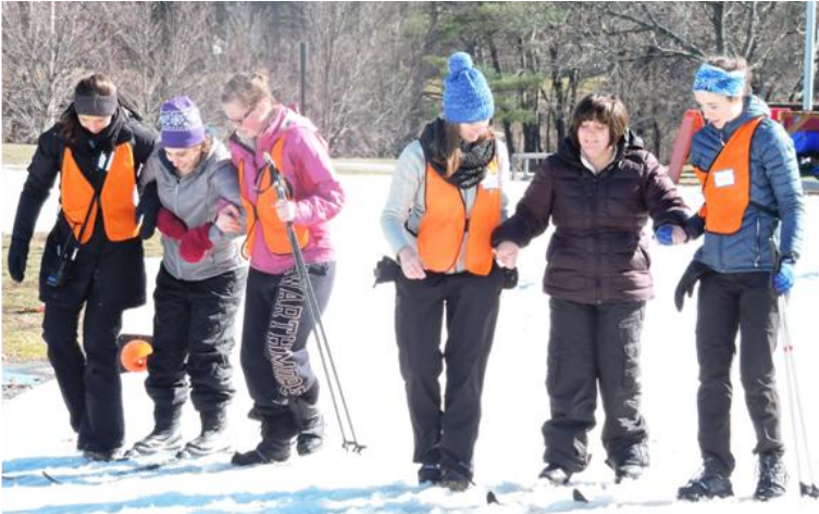
Staff assist participants doing a lap around the Weston Ski Track.

Sundays, January 28, February 4, 11, 25 & Monday (President's Day), February 19