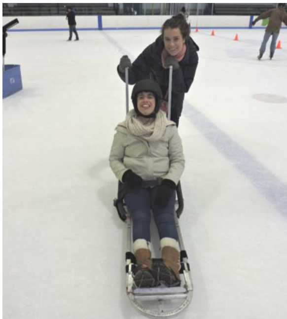
Happy skaters in Holyoke.

Sled skate on your own in the following towns: Auburn, Boston, Brighton, Brockton, Cambridge, Charlestown, Fall River, Franklin, Greenfield, Holyoke, Hyde Park, Jamaica Plain, Medford, Newburyport, North Adams, Plymouth, Revere, Somerville, Springfield, Taunton, West Roxbury, Weymouth, and Worcester. For a complete list of how many sleds are located at each rink, visit www.mass.gov/dcr/universal-access/skating or call the Universal Access Program at 413-545-5758.