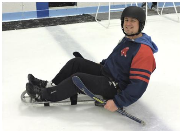
An ice sled in use in East Boston.

Contact the rink in advance to let staff know that you plan to attend during public skating on a specific date.