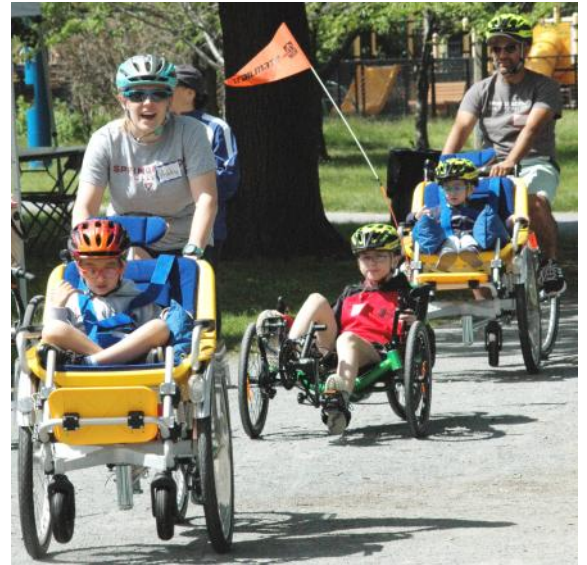
Participants ride various adaptive bicycles.

Volunteers Needed for this year's event! To find out how you can get involved, contact Rachael at 413-992-8048 or rachael.lee@state.ma.us