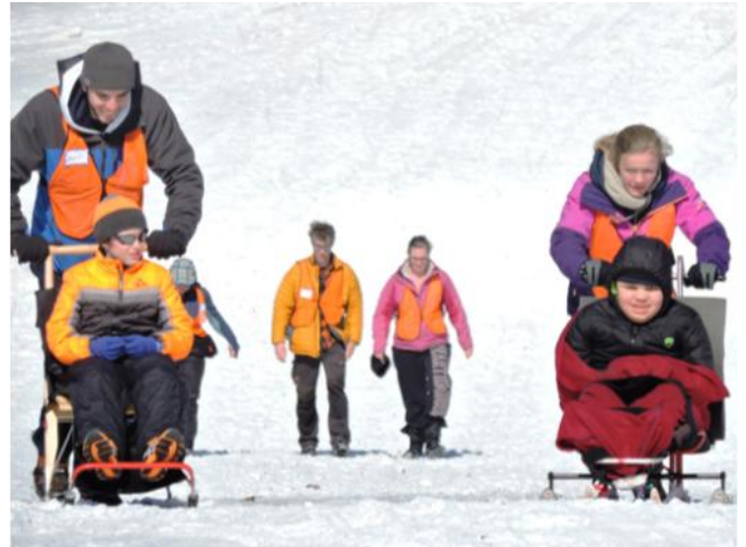
Kicksledding and sit-skiing are popular activities at the outdoor recreation program.