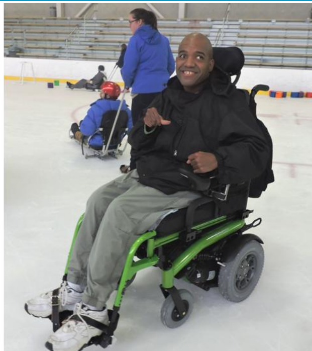
Glide around the ice in your manual or power wheelchair.

To sign up call 413-545-5759 or email laila.soleimani@state.ma.us