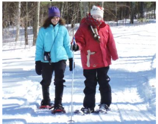
All smiles while snowshoeing on the trails.