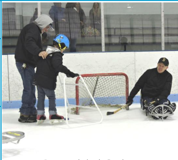
Integrated play in Brockton.

To sign up, contact All Out Adventures at 413-584-2052 or info@alloutadventures.org