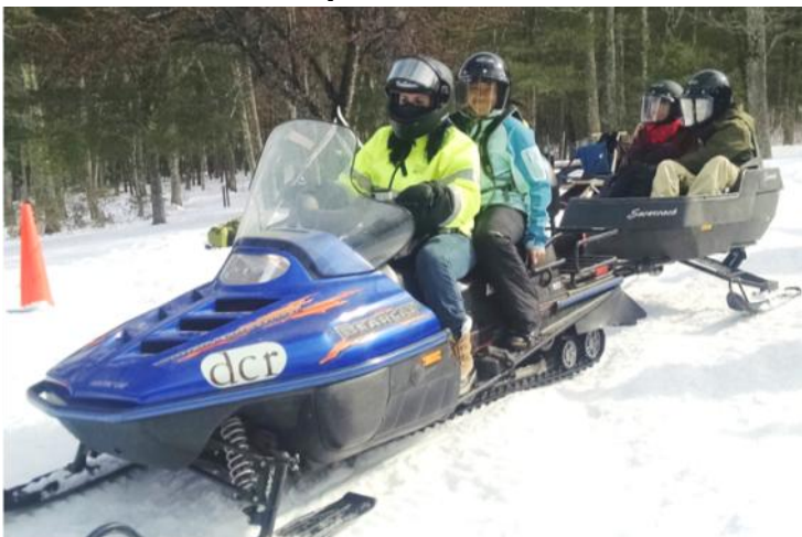
Snowmobile rides available, as conditions permit.

January 13, 20, 27, & February 3, 10, 17, 24 (March 3 & 10 are scheduled weather makeup dates)