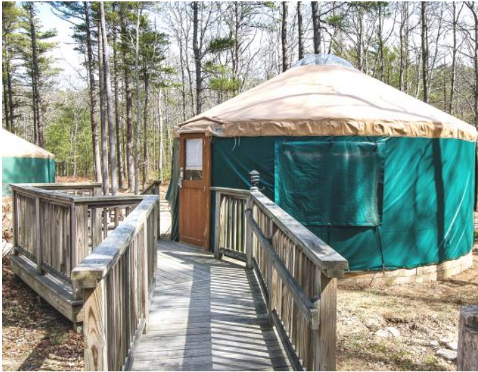
A yurt at Nickerson SP.

Plan your next summer vacation now—stay in an accessible DCR yurt! Yurts are circular, domed structures with wooden frames covered in heavy canvas. They have a spacious interior with a skylight, screened windows, and locking doors. Yurts come furnished with bunk beds, a table and chairs, and electricity. They offer an accessible camping experience for campers of all abilities to comfortably enjoy nature without “roughing it.”