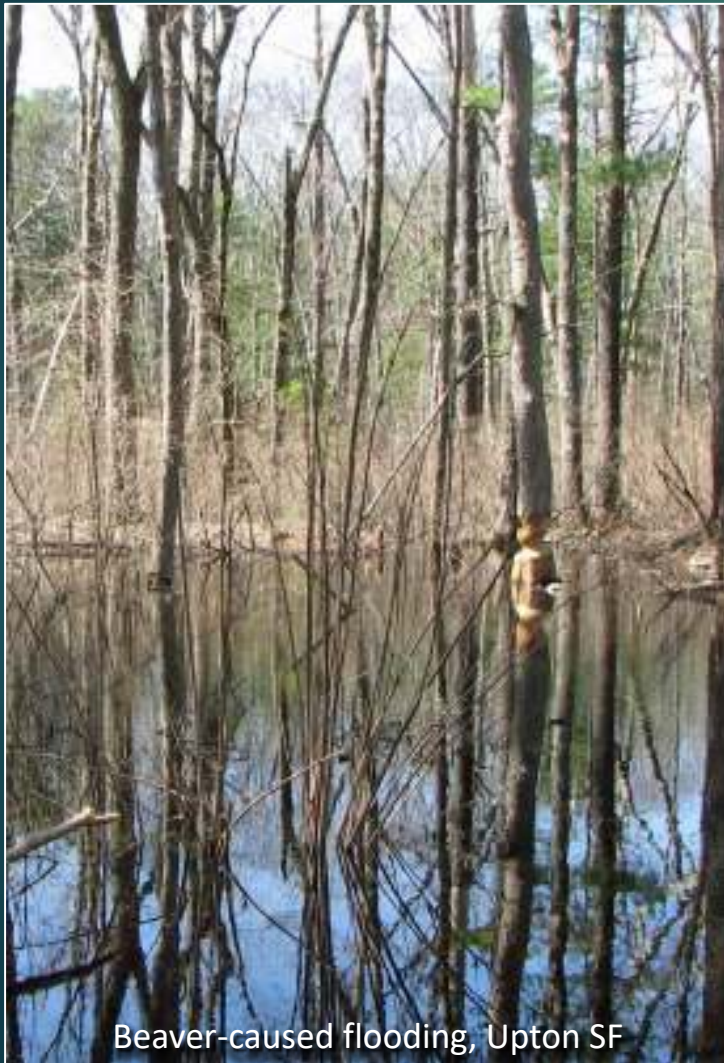
Beaver-caused flooding, Upton SF