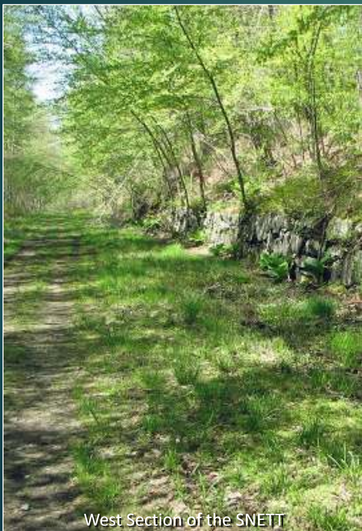
West Section of the SNETT