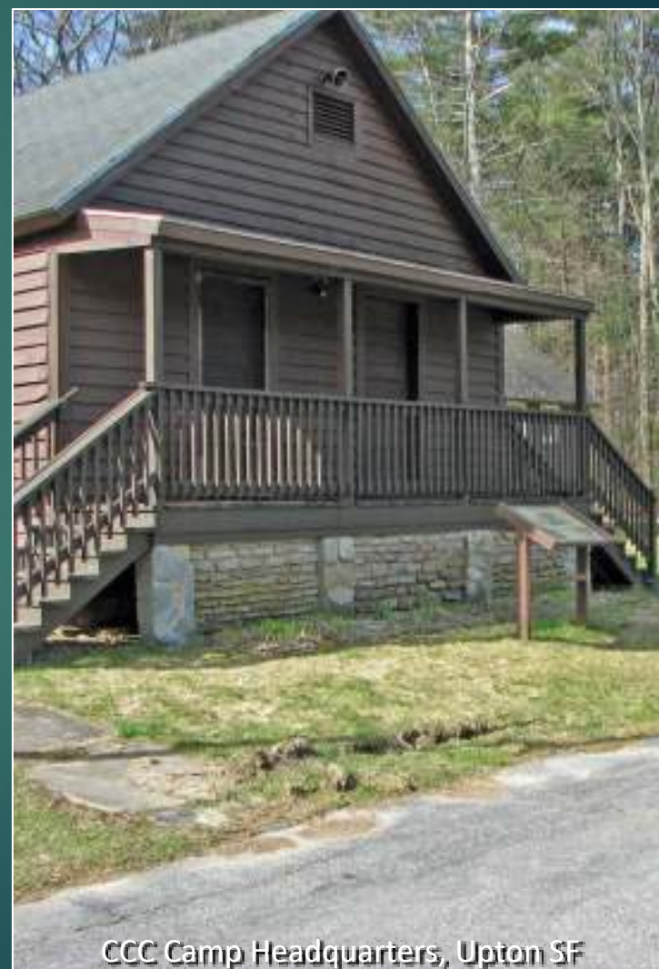
CCC Camp Headquarters, Upton SF