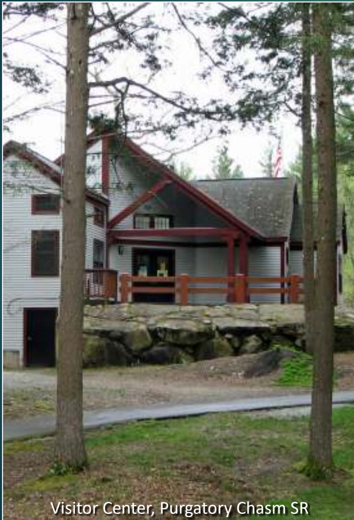
Visitor Center, Purgatory Chasm SR