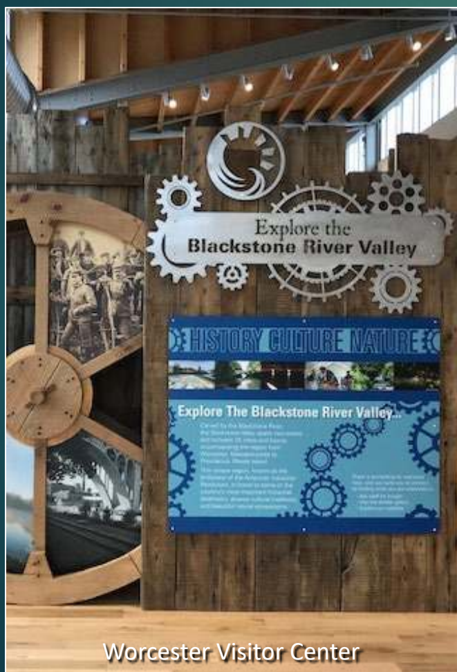
Worcester Visitor Center