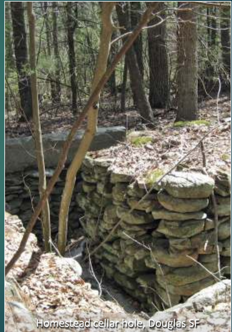
Homestead cellar hole, Douglas SF