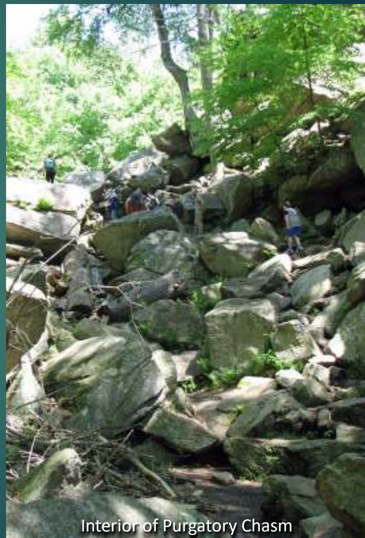
Interior of Purgatory Chasm