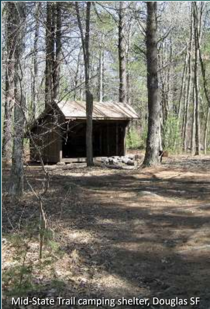
Mid-State Trail camping shelter, Douglas SF