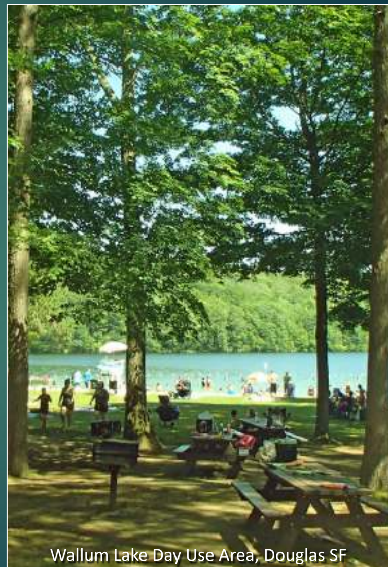
Wallum Lake Day Use Area, Douglas SF