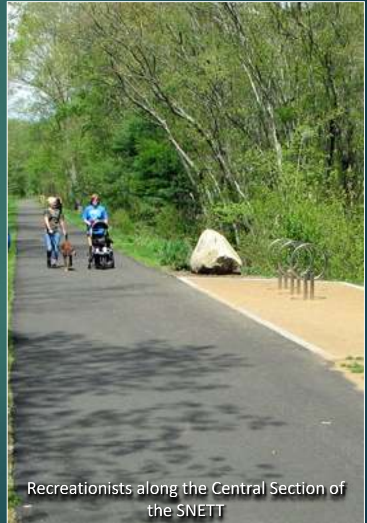
Recreationists along the Central Section of the SNETT