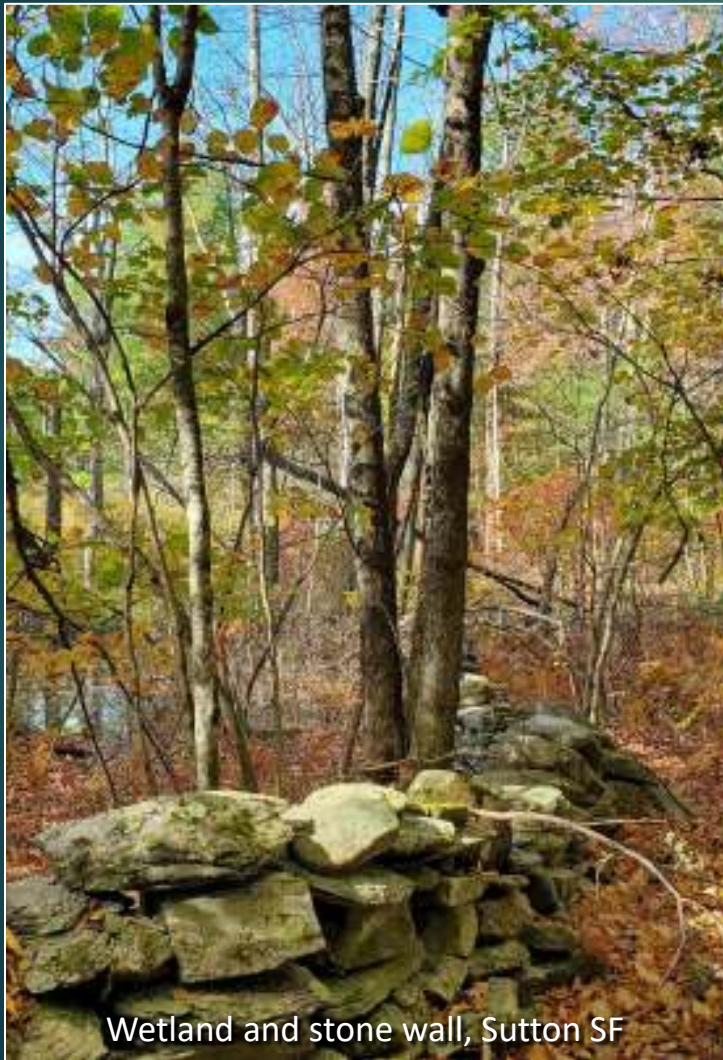
Wetland and stone wall, Sutton SF