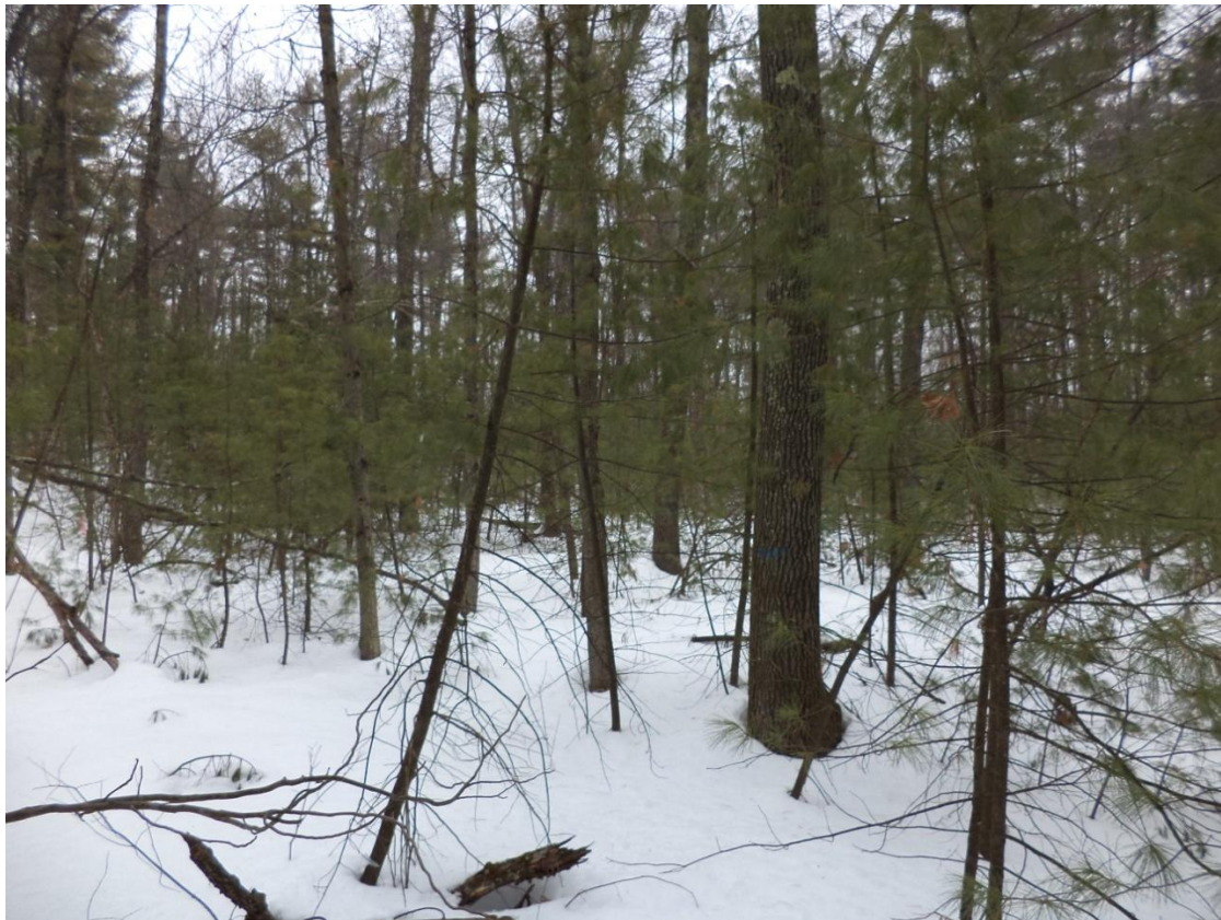
B. White pine-oak stand with good advance regeneration in northern part of sale area.