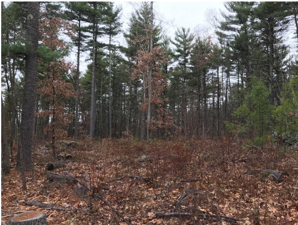
B. In this area where the overstory was removed there is good white pine and hardwood regeneration. The overstory white oak was retained to provide important structural diversity.