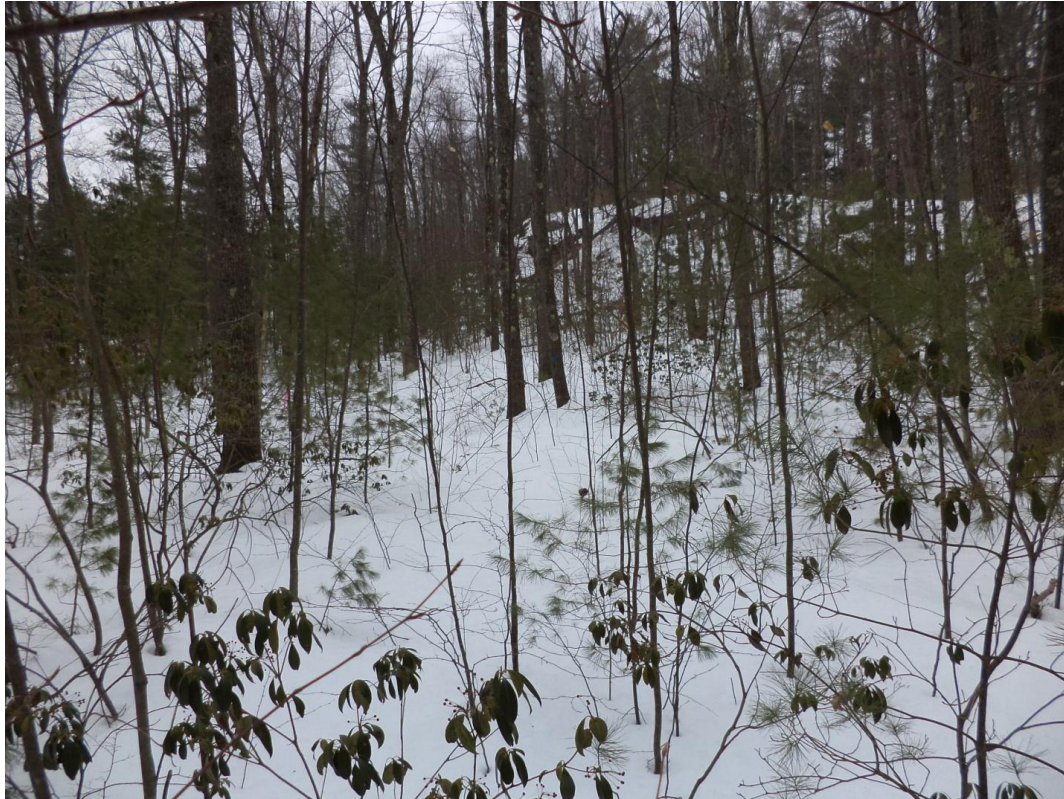
A. 85 year-old red oaks with good white pine and hardwood regeneration at base of ledge outcrop in northern part of sale area.