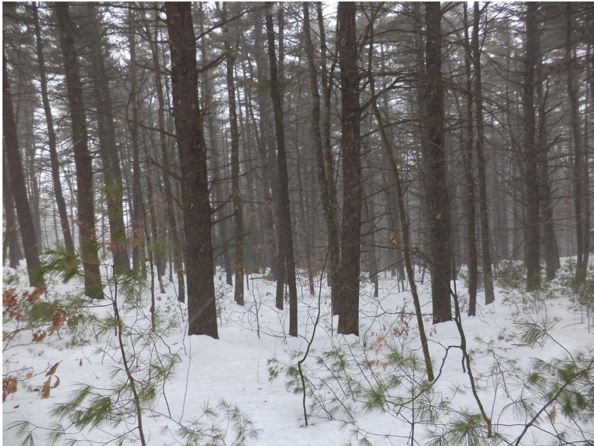
C. 80 year-old white pine stand in southern part of sale area during a snow-squall.