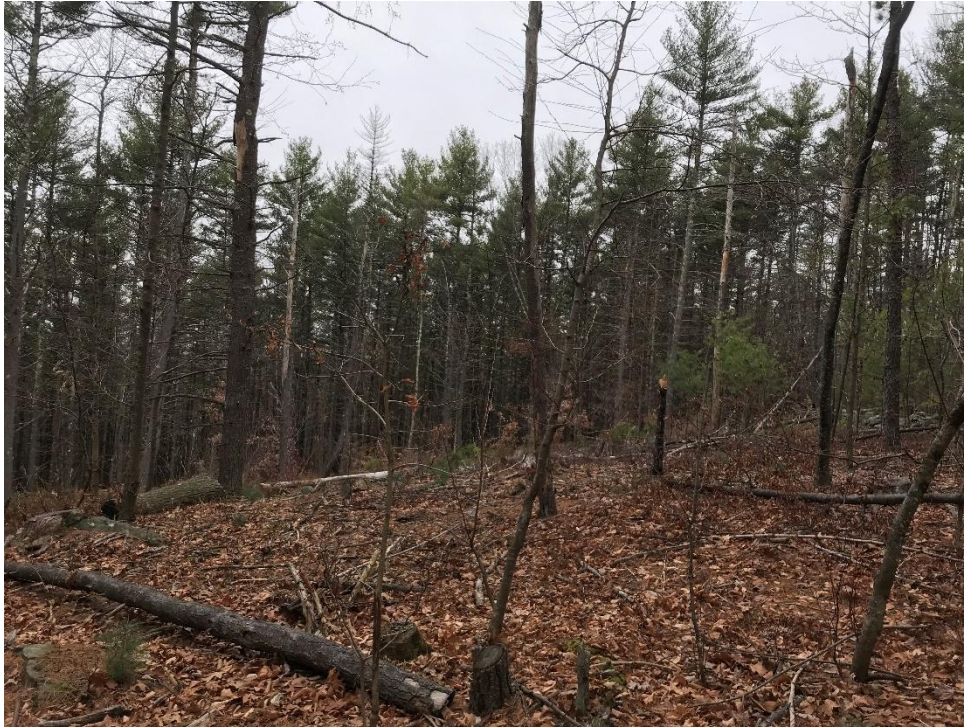
A. An area where the primarily white pine overstory was removed releasing the excellent hardwood regeneration.