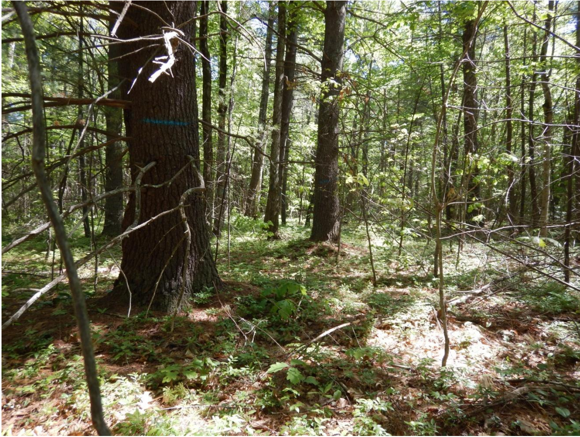
C. An area with plenty of seedlings and saplings and a good diversity of species where the overstory will be removed.