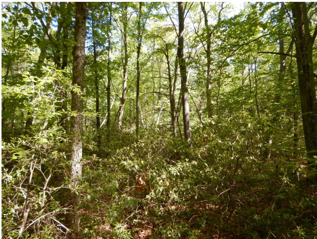
B. This shows the thick mountain laurel understory which prevents the establishment of young trees.