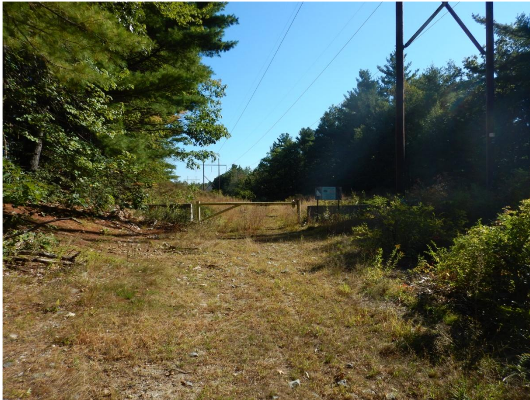
A. The access road under the power lines on Coal Kiln Road.