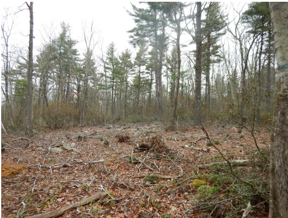
B. This is one of the areas where a thick mountain laurel understory which prevented tree regeneration from becoming established. The additional sunlight from the removal of some of the overstory trees along with the damage to the mountain laurel, should allow seedlings to germinated and thrive.