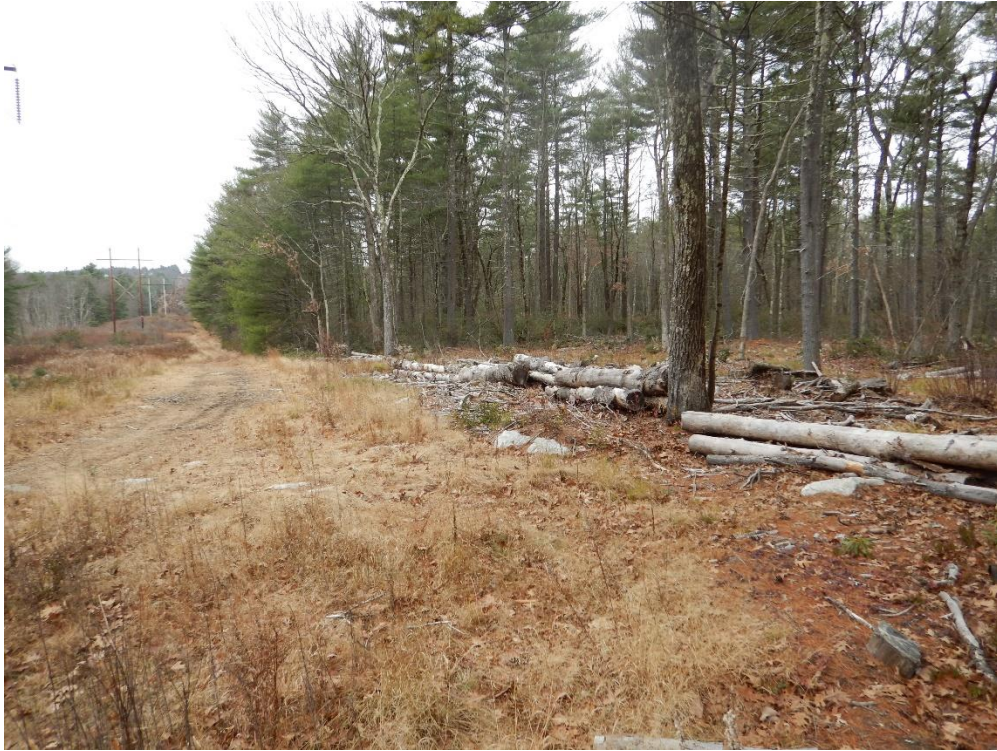
A. The landing area. The logs were placed along the edge of the powerline to prevent unauthorized vehicular access into the forest.