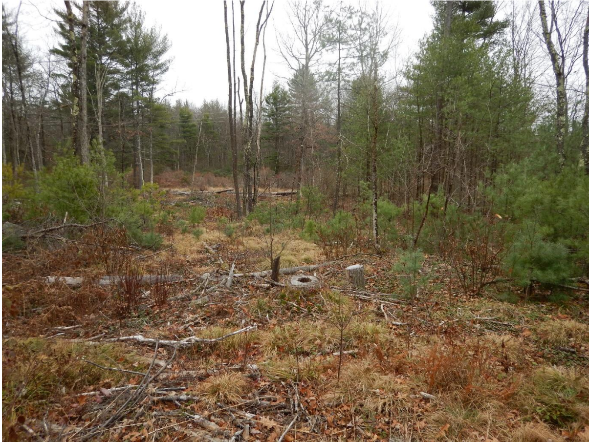
C. This was an area with a good number and diversity of seedlings and saplings. Most of the overstory has been removed so the young trees can now thrive.