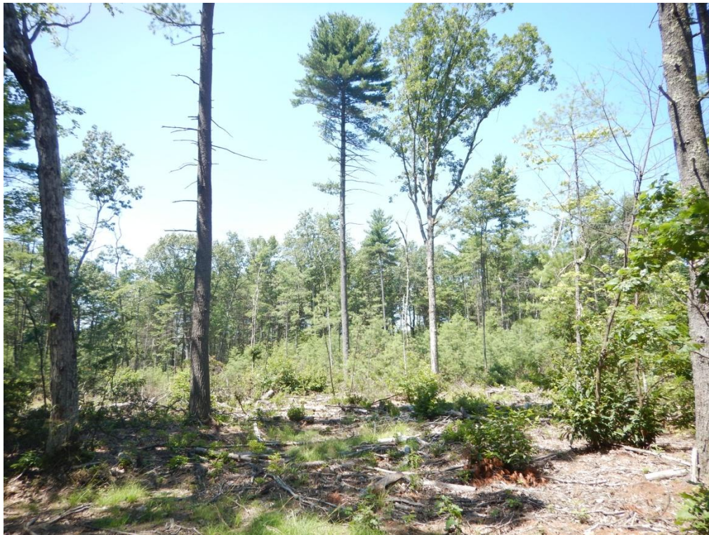
B. This oak and white pine were left in this opening to provide valuable structure in this new patch of young forest.