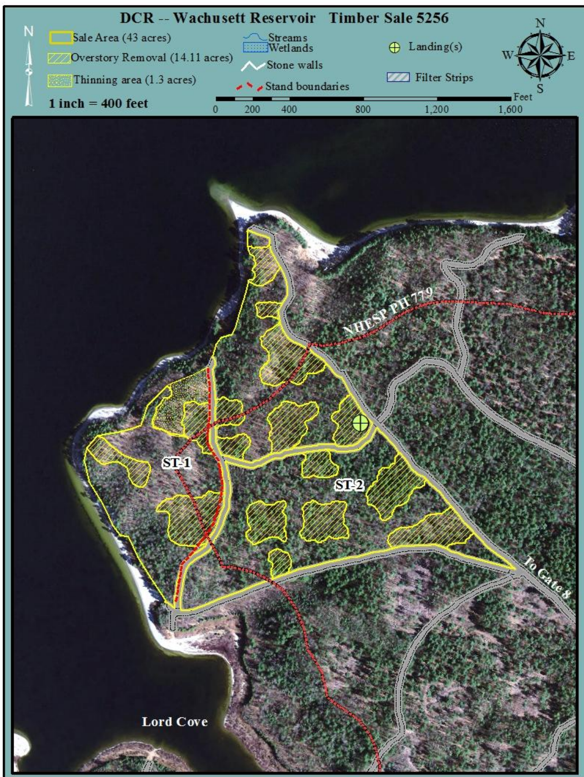
Figure 2. Maps of harvest area showing approximate boundary, proposed openings and other features