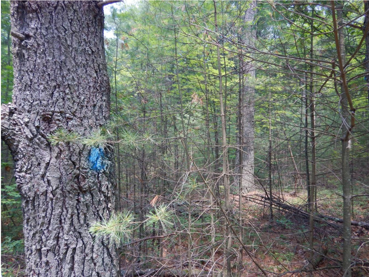
C. Another view of the thick white pine regeneration which will be released with the removal of this portion of the overstory. The larger white pine in the center-right of the photo is being retained in order to provide a more diverse structure to the forest.