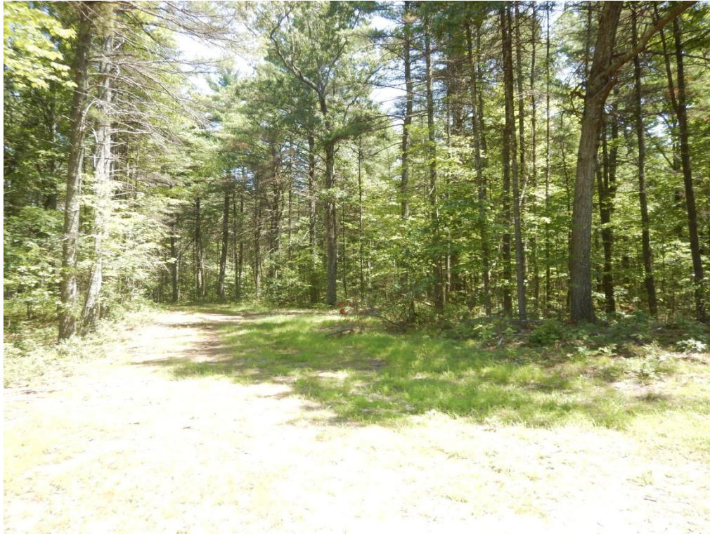
A. This was the primary landing location inside Gate 8.