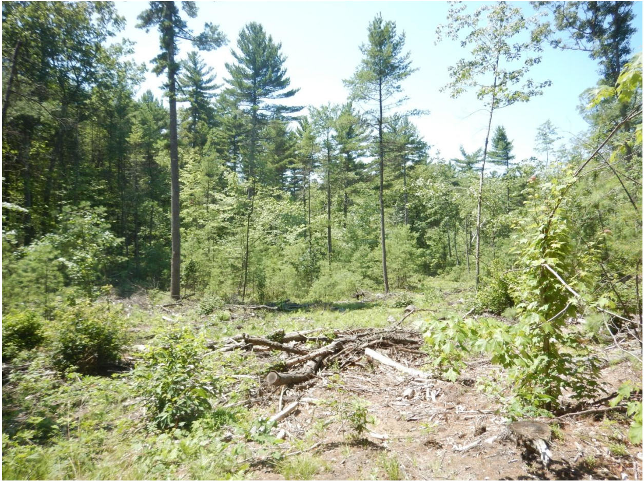
C. Another opening where the primary goal was to release young white pine on this very dry site. White pine is better adapted to growing vigorously and with good form than is oak on such sites. A variety of older pines were retained in this opening as well.