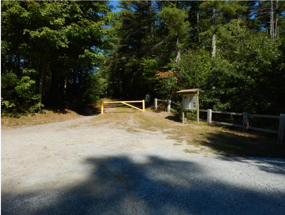
A. The lot will be accessed through Gate 8 on Main St. (Rt. 70) in Boylston.