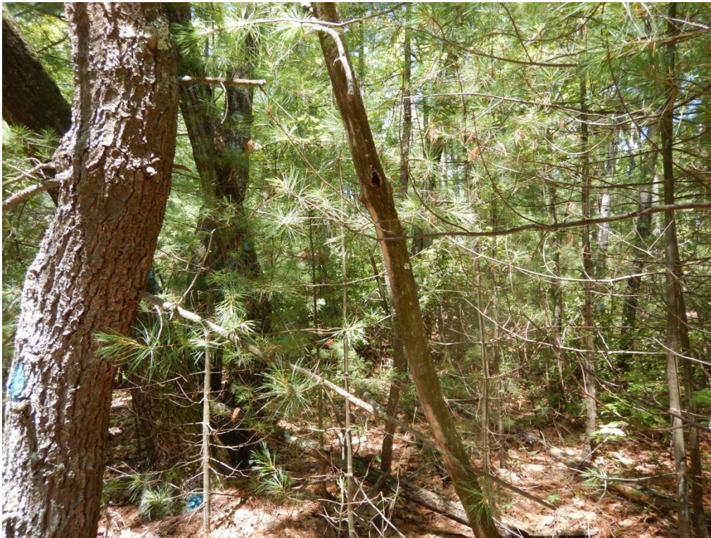
B. The white pine and oak overstory is being removed to release this thick understory which is dominated by young white pine saplings.