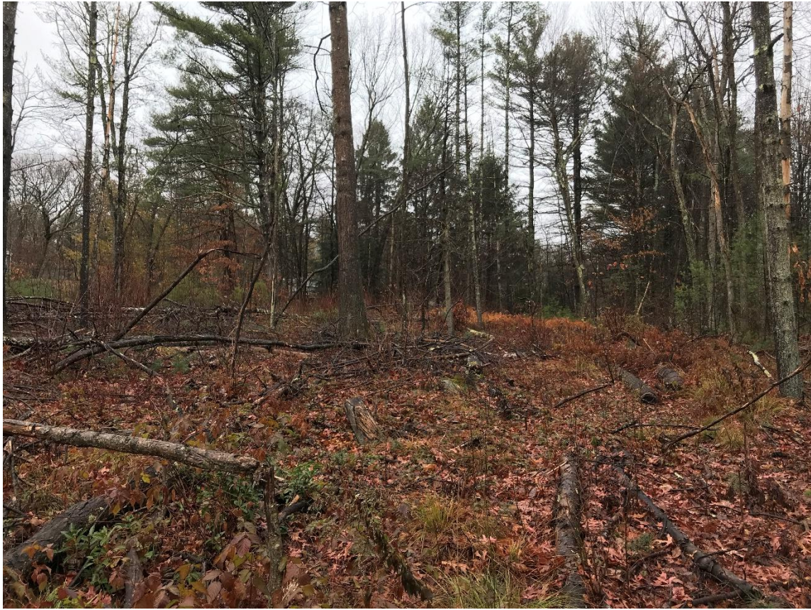
C. There is good hardwood regeneration in this area. The large red oak in the middle was retained to provide structural diversity.