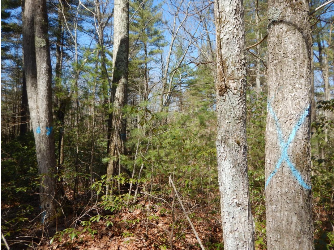
A. The overstory is being removed to release the thick white pine and hardwood regeneration.