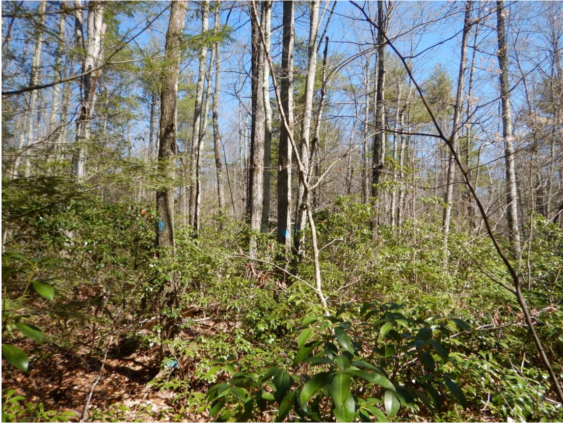
C. An area of thick mountain laurel where a significant portion of the overstory is being removed to allow for the establishment of tree species.