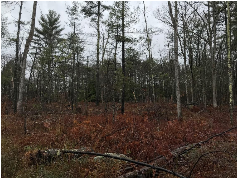
B. These mid-story white pine were retained in this overstory removal area where there is good hardwood regeneration.