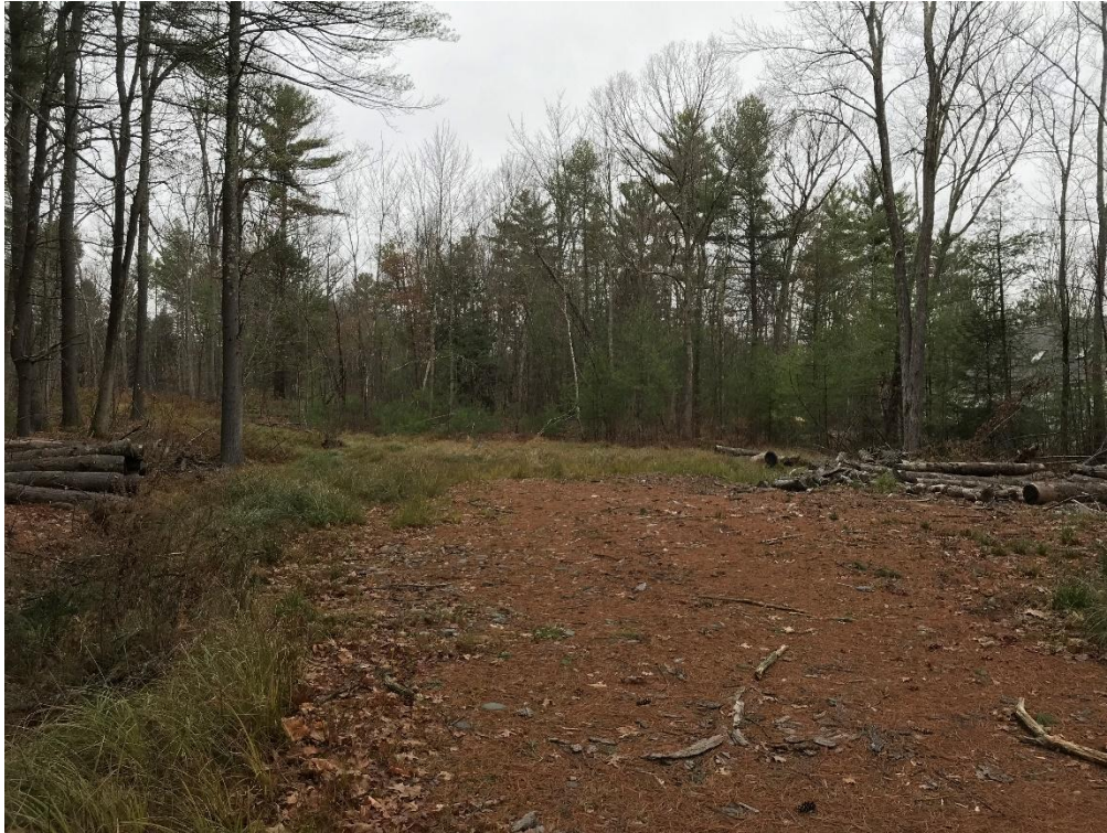
A. The landing on Manning Street in Holden.