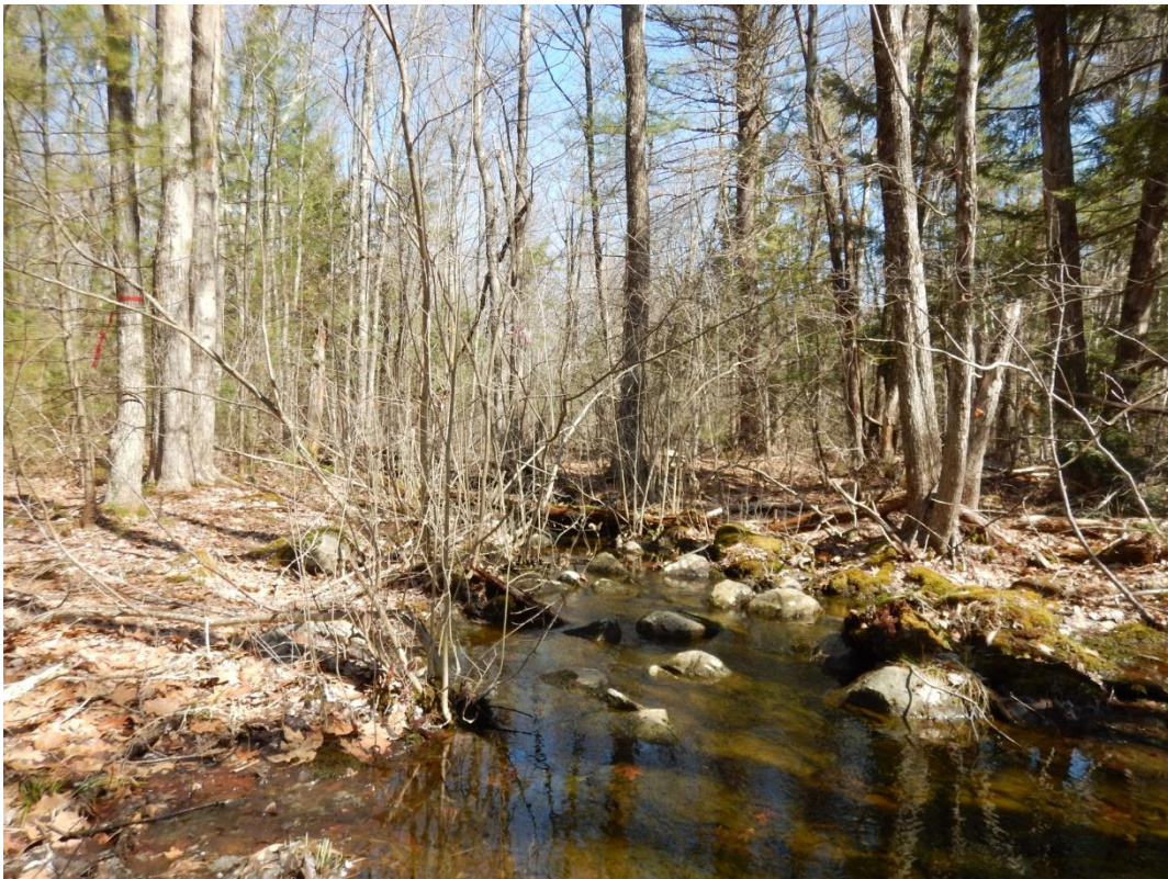
B. The location of the stream crossing.