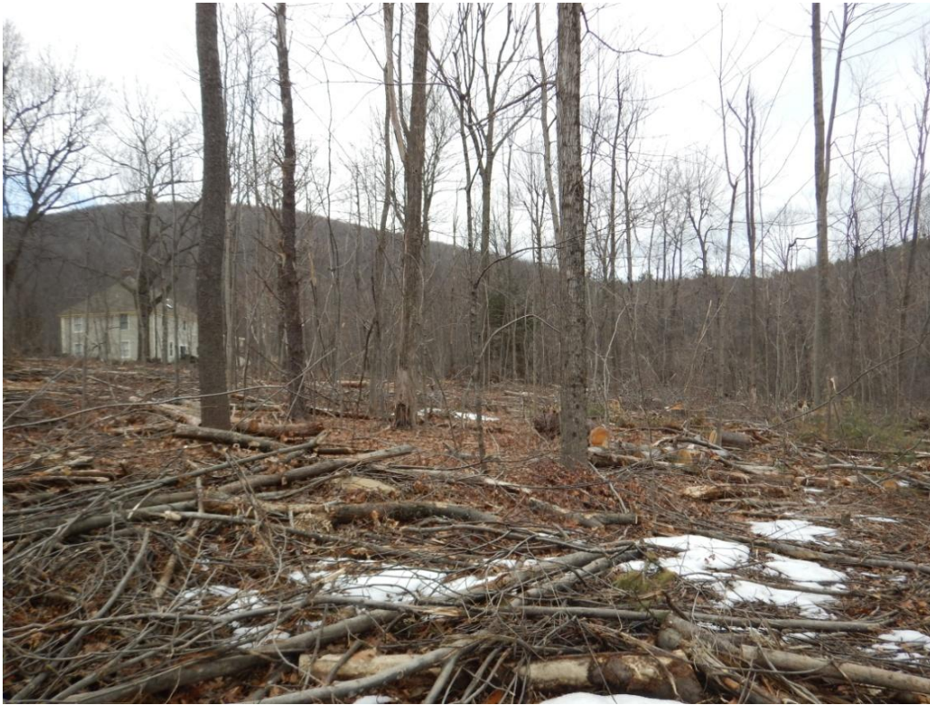
B. In this area of overstory removal, the black cherry and sugar maple trees were retained in order to improve the structural diversity in this area.