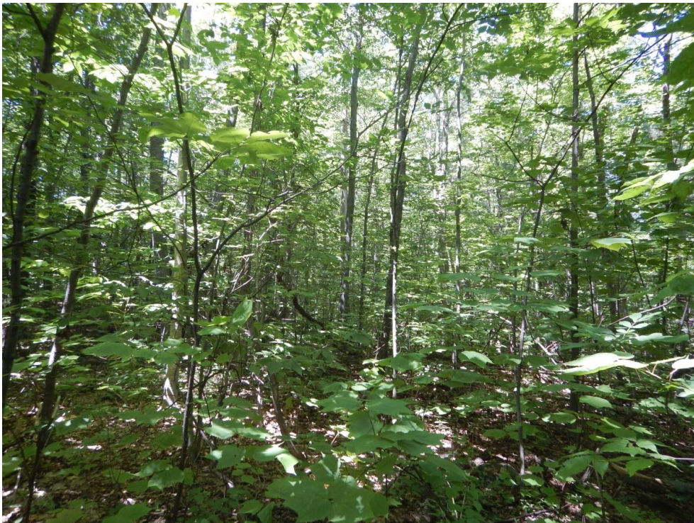
B. The excellent understory of diverse hardwoods including hickory, red oak, sugar maple and white ash will be released in this area by the removal of the overstory trees.