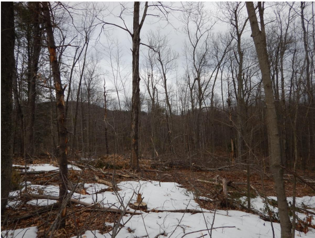
C. The poorer quality red maples and white ash trees were thinned from this area leaving the better quality trees such as the sugar maple near the center of this photo.