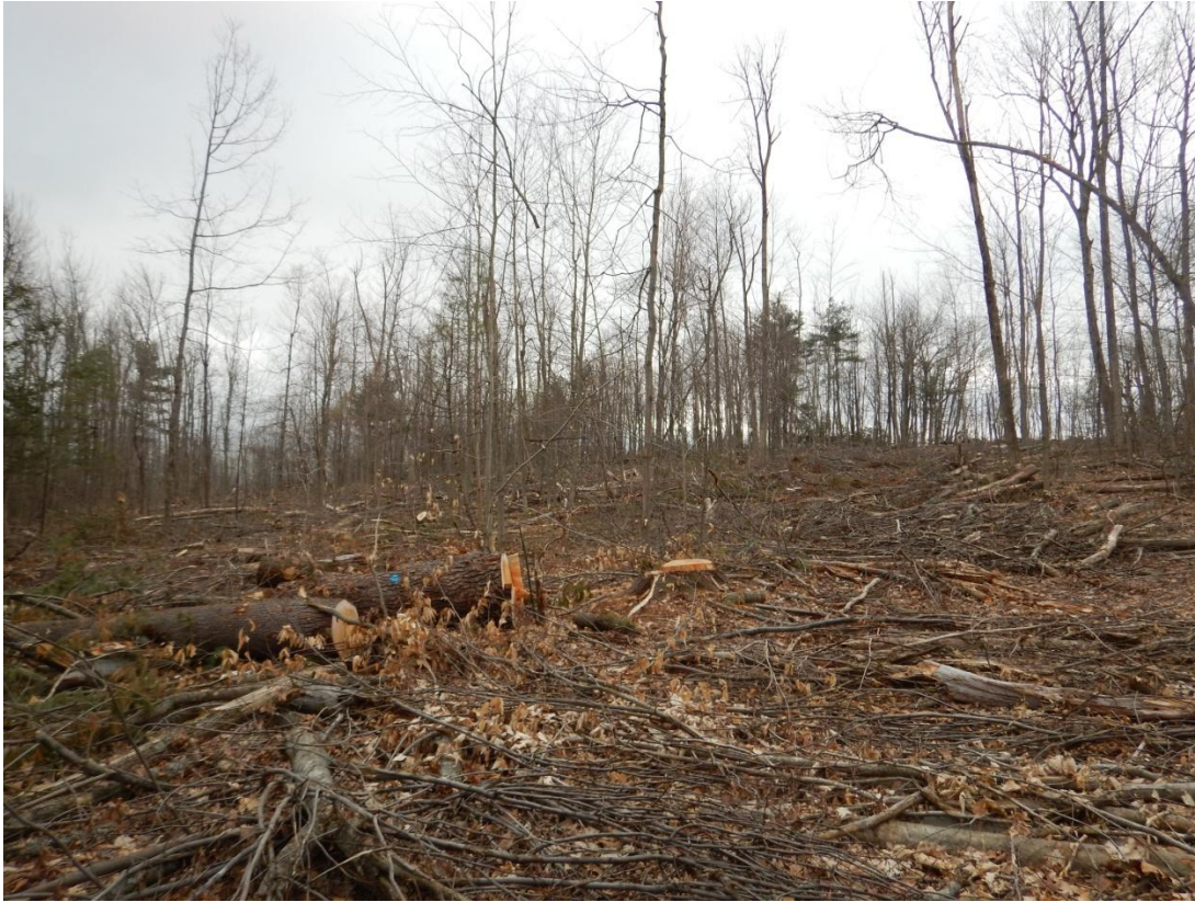
Figure 5. Post-Harvest Photographs, A-C

A. The overstory of primarily ice storm-damaged ash trees was removed to release this understory of young hardwoods. While many of the hardwood saplings are still standing, those that were cut will sprout vigorously this spring and quickly fill what now appear to be vacant spaces. The large chunks of the white pine stem that were left will provide long-term coarse woody debris that's valuable for a wide range of habitat functions.