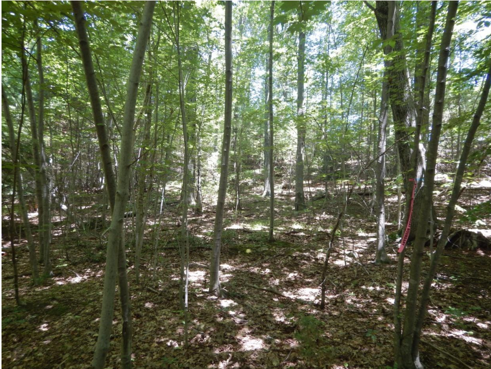
A. The poorer quality red maples and white ash will be removed from this area benefitting the excellent quality hickory.