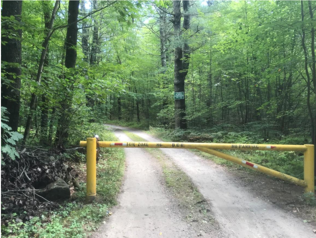
A. The landing is located just inside Gate H6 on the left side of Paul Street.