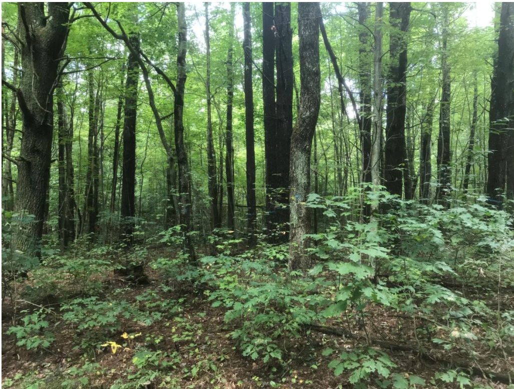
B. One of the areas where the overstory is being removed to give this excellent understory of young hardwood trees the space and light it needs to continue to grow.