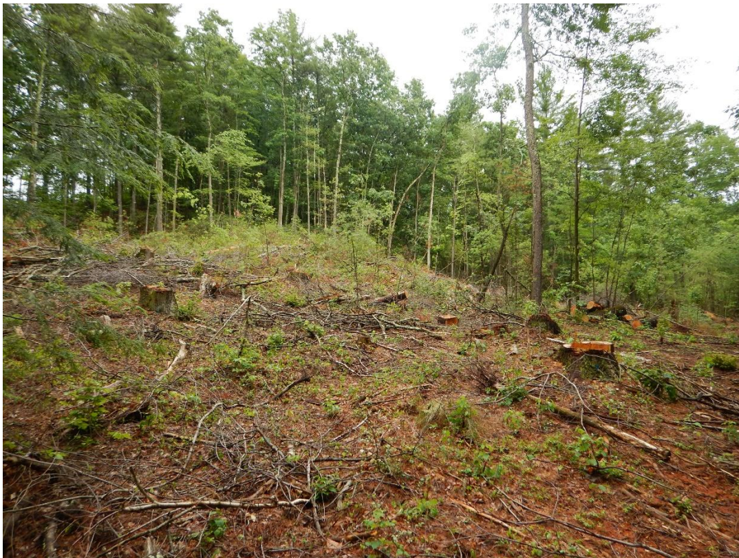
B. The black cherry tree to the right was retained to provide structural diversity as well as a continuing source of black cherry seeds into the future.