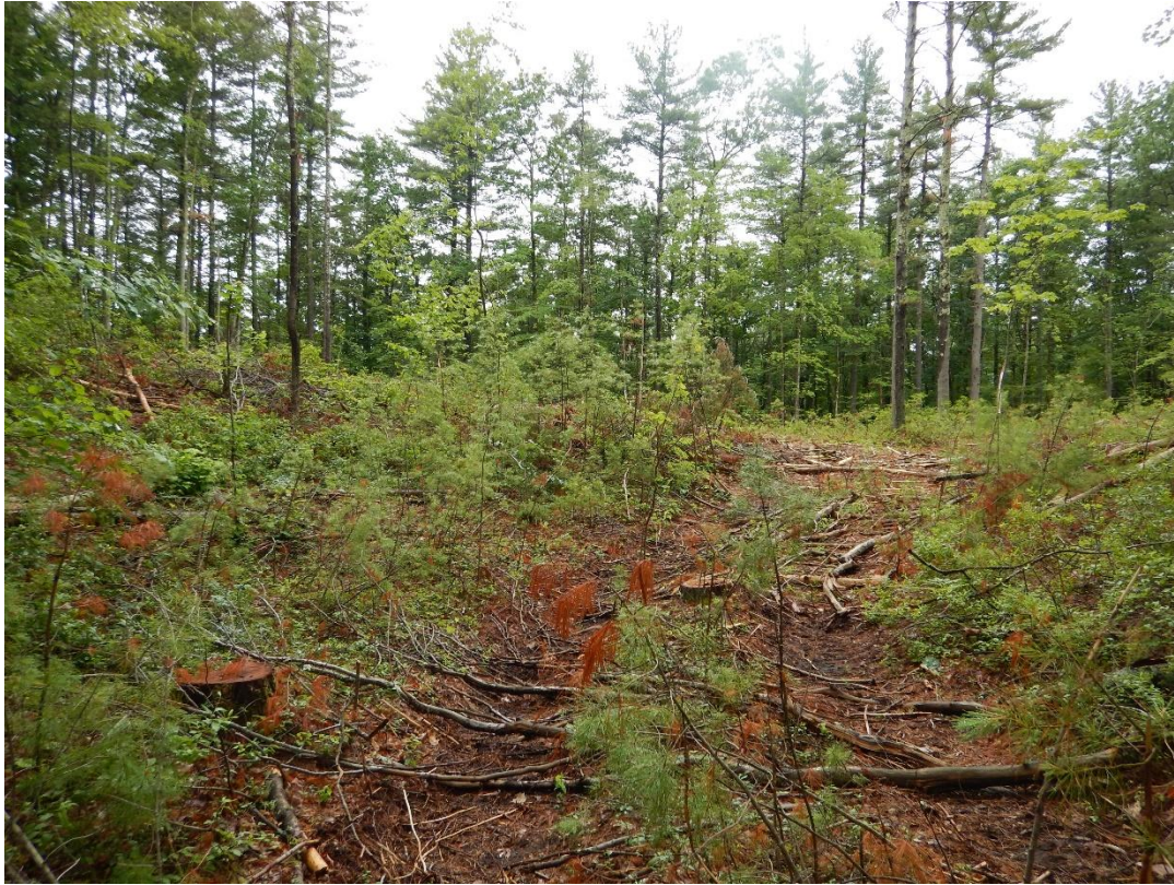
A. An overstory removal area where there is an excellent mixed hardwood and white pine understory which is now free to grow.