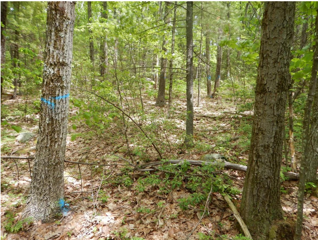
D. Another area of overstory removal. The chestnut oak in the right foreground is being retained and is a good example of the excellent chestnut oak which is not common on DWSP in the Wachusett watershed.