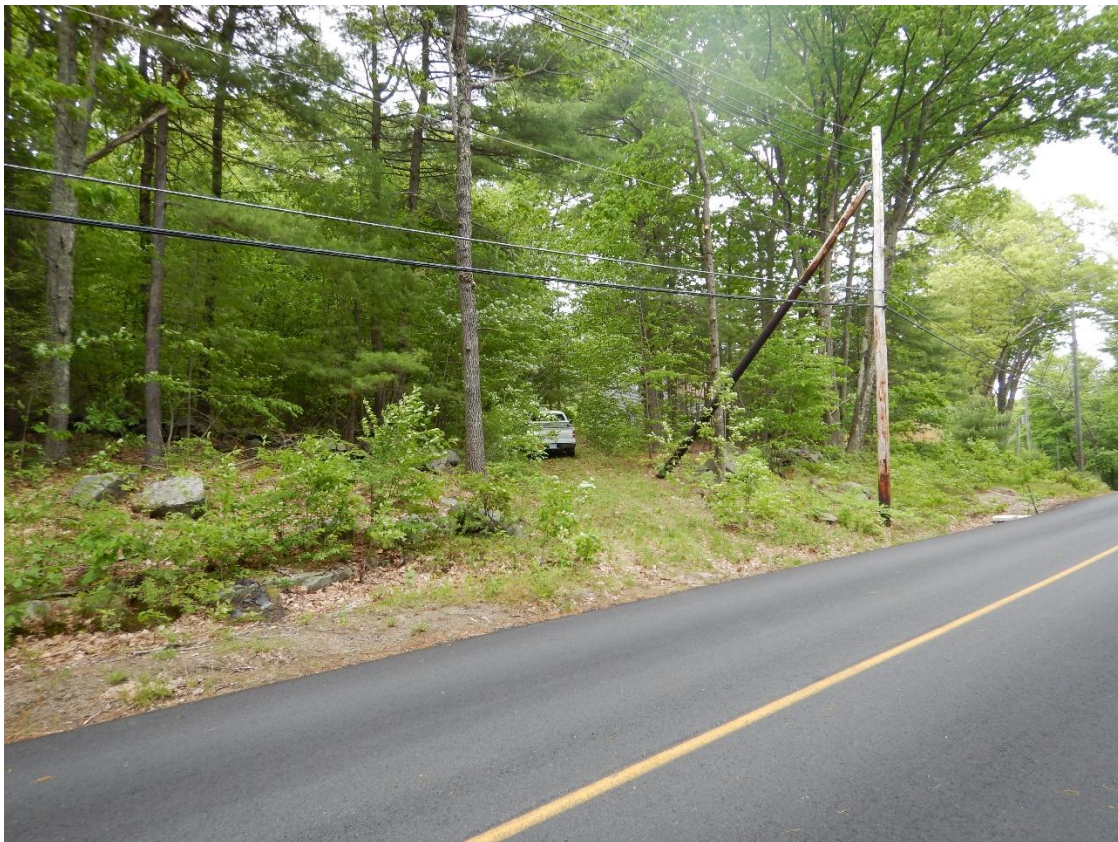
B. The southern landing on Justice Hill Road.