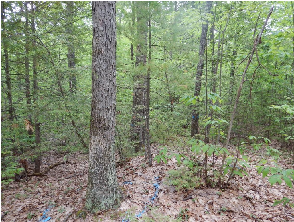
C. The overstory is being removed to release the excellent understory. The white oak in the foreground is being retained to provide important structural diversity within what will be a patch of young forest.