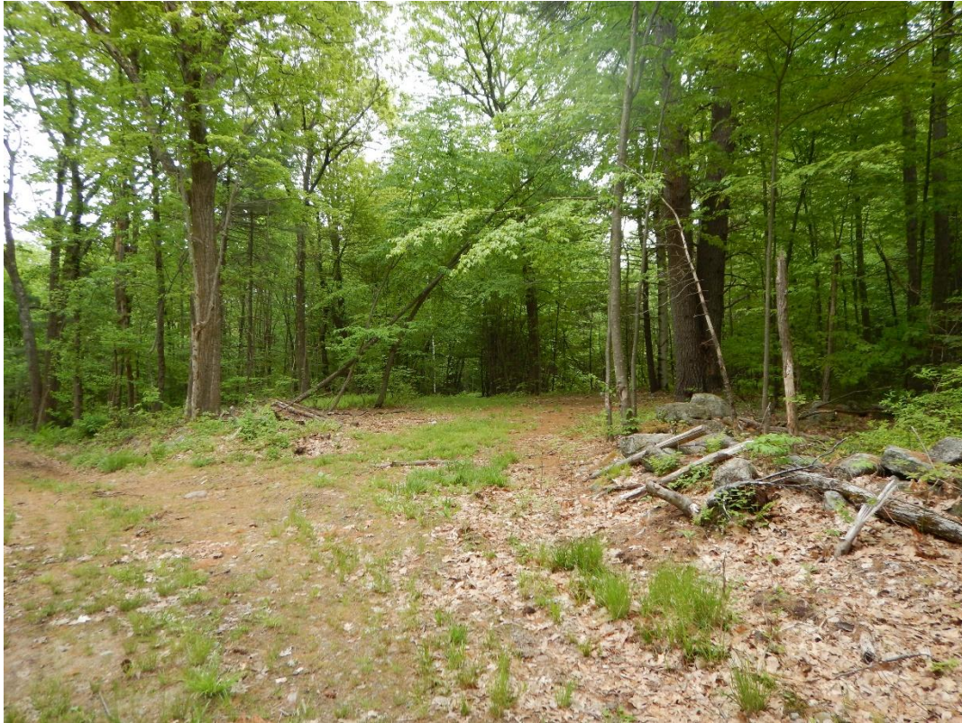
A. The northern landing off Hardscrabble Road.