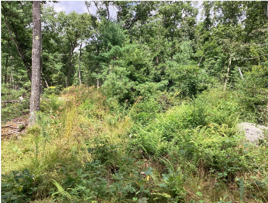
B. An area of overstory removal. The chestnut oak in the left-foreground was retained.