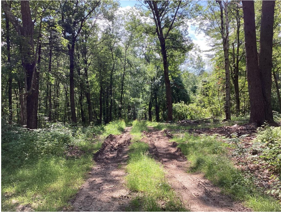
A. The northern landing off of Hardscrabble Road.