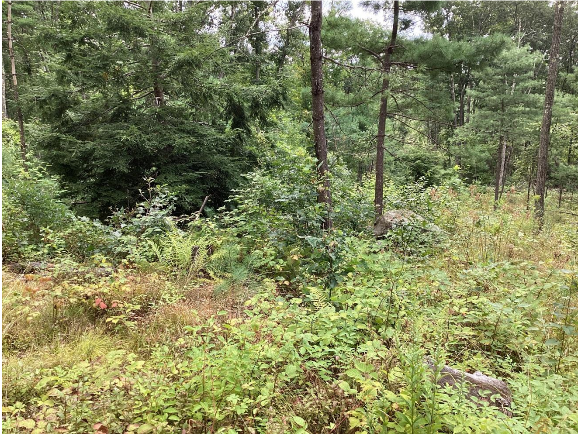
C. Another area of overstory removal. The smaller white pines and hemlock were retained to provide structural diversity.