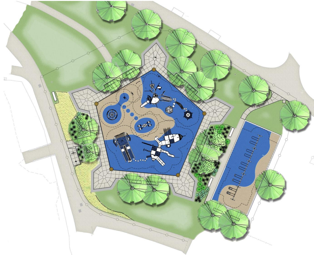
Poured-in-place rubber layout