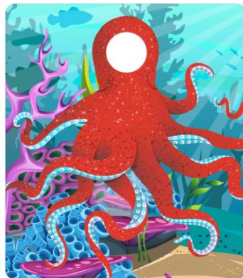
HEAD HOLE PANEL BACK