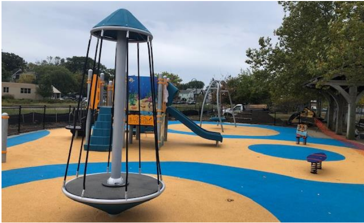
Poured-in-place rubber example