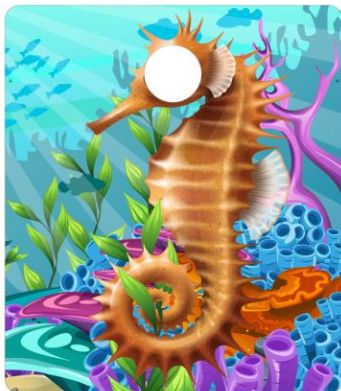
HEAD HOLE PANEL FRONT