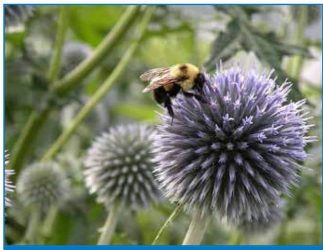
Bumble Bees, like this one feeding on the nectar of a Globe Thistle, provides the vital ecological role of a pollinator.

The Massachusetts Department of Agriculture (MDAR) is currently working on a pollinator protection plan for the Commonwealth. The MDAR apiary program supports beekeepers,