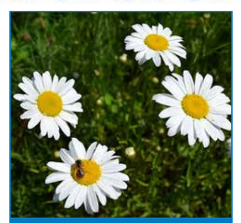
The European Honey Bee, like the one shown above, is just one species responsible for the pollination and propagation of 75% of commercially grown crops.

It is so easy to take our food for granted. Try to remind yourself the next time you take a bite out of that freshly grown New England apple that without the bees those apples would be hard to come by.