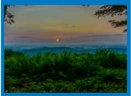
Quabbin Sunrise