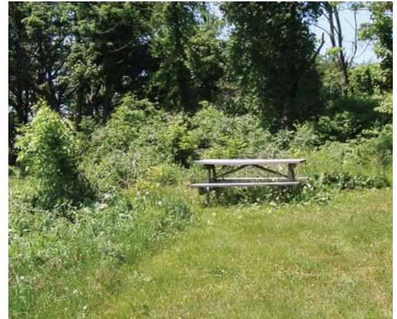
CPA funding has helped preserve this quiet picnic spot in Hubbardston.

Since its inception, nearly $1.2 billion has been raised and distributed to participating towns to use as each town sees fit (subject to threshold expenditures) on historic preservation, open space protection, and accessible housing. The power of partnership has rarely been more evident, as more than 6,600 projects have been approved statewide, assisting 3,300 historic preservation projects, creating 7,300 affordable housing units, and preserving 20,000 acres of open space.