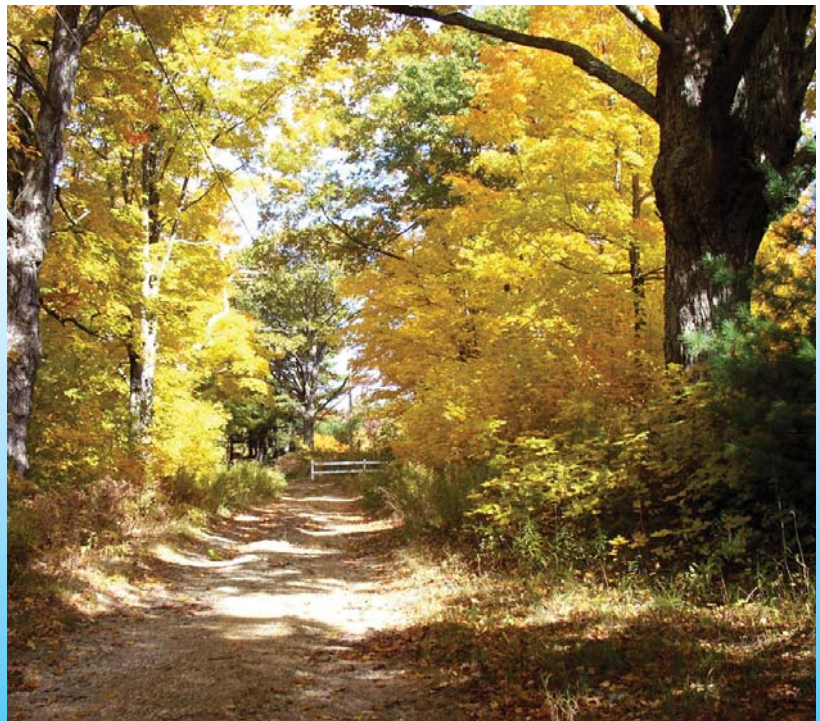
A scenic trail within the Malone Road Conservation Area.