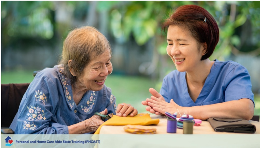
Image 1. Alternative Text: Two east Asian women are sitting at a table making crafts together. One woman is an older adult, and the other woman is her home care aide.