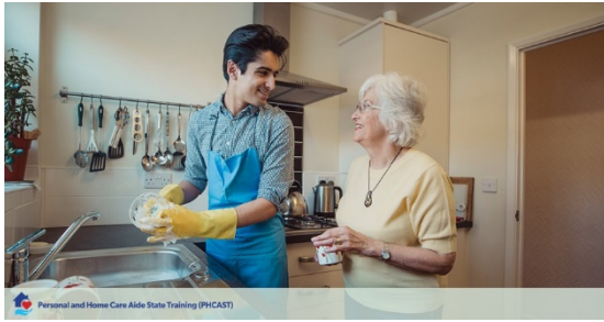
Facebook Image 5.

Image 5. Alternative Text: An older white woman is in her kitchen while her home care aide, a young west Asian man, helps wash the dishes.