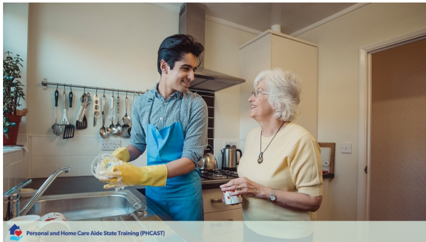
Image 5. Alternative Text: An older white woman is in her kitchen while her home care aide, a young west Asian man, helps wash the dishes.