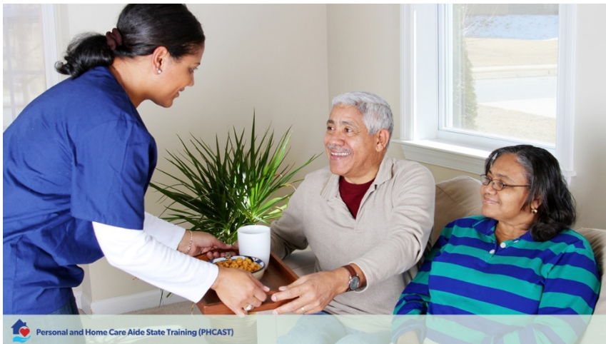
Image 2. Alternative Text: An older Latinx man and woman are sitting on the couch at home while their home care aide, a younger Latinx woman, brings them a meal.