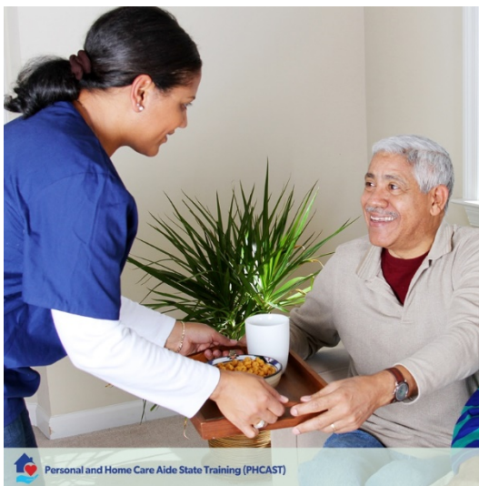
Image 2. Alternative Text: An older Latinx man is sitting on the couch at home while his home care aide, a younger Latinx woman, brings him a meal.