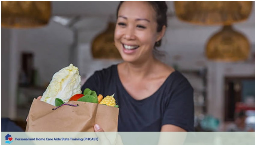
Twitter Image 3.

Image 3. Alternative Text: A home care aide, a younger Asian woman, helps with groceries.