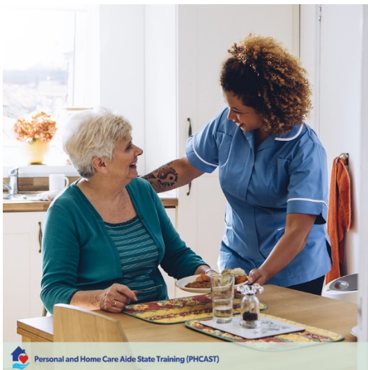
Instagram Image 4.

Image 4. Alternative Text: An older white woman sits at the kitchen table and her home care aide, a younger Black woman with a tattoo, brings her a meal.