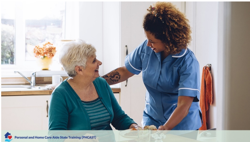
Twitter Image 4.

Image 4. Alternative Text: An older white woman sits at the kitchen table and her home care aide, a younger Black woman with a tattoo, brings her a meal.