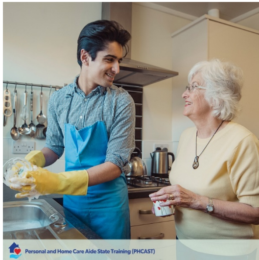
Image 5. Alternative Text: An older white woman is in her kitchen while her home care aide, a young west Asian man, helps wash the dishes.