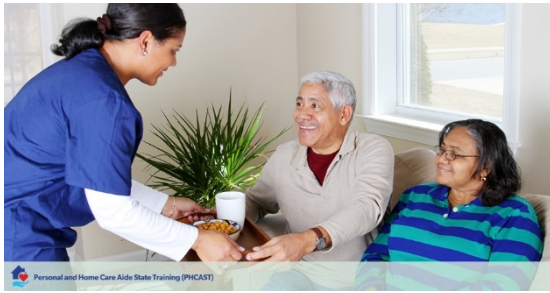
Facebook Image 2.

Image 2. Alternative Text: An older Latinx man and woman are sitting on the couch at home while their home care aide, a younger Latinx woman, brings them a meal.