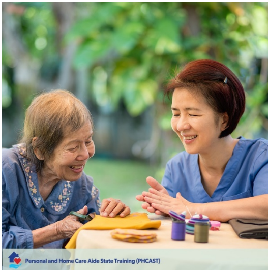
Image 1. Alternative Text: Two east Asian women are sitting at a table making crafts together. One woman is an older adult, and the other woman is her home care aide.