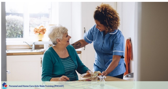
Facebook Image 4.

Image 4. Alternative Text: An older white woman sits at the kitchen table and her home care aide, a younger Black woman with a tattoo, brings her a meal.