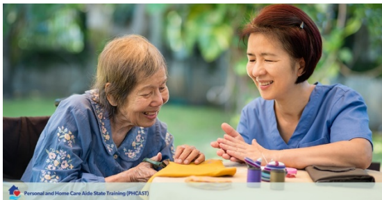
Image 1. Alternative Text: Two east Asian women are sitting at a table making crafts together. One woman is an older adult, and the other woman is her home care aide.