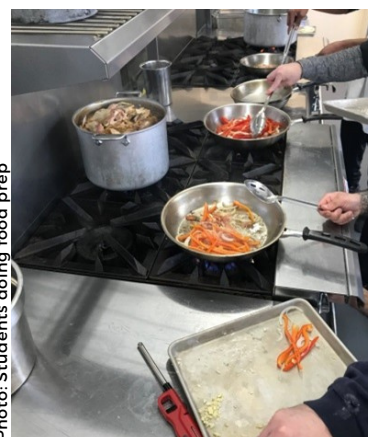
Photo: Students doing food prep

HCSD provides contextualized HiSET instruction that includes but is not limited to Math for Chefs, English Language Arts, digital literacy, and career counseling. Students create and present a Food Truck project that includes a business plan, truck design, menu with costing sheets for some items and a "signature dish". The chef instructor and other teachers from HCC deliver culinary arts instruction, including kitchen etiquette, food terminology, cooking basics, food preparation, knife skills, and dining service skills at its state-of-the-art Culinary Arts Institute. The academic curriculum includes using the ServSafe for Managers text to teach reading and vocabulary skills that focus on the safe handling of food, cleanliness and sanitation, hygiene and health, and nutrition. In the math class, students work with fractions and decimals to learn portion costs, yield percentages, functions of ingredients, measurement, recipe costing, mark up percentages, and inventory control. The ELA curriculum includes reading the book Cooked by Jeff Henderson and practicing essay writing skills based on some of the "situations" that are discussed in the text.