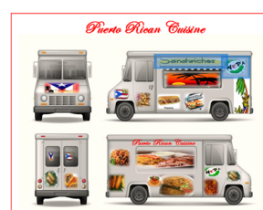
Photo (L to R): Student foodservice manuals, & student food truck concept