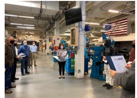
Photo: Webster Public Schools at the Launch