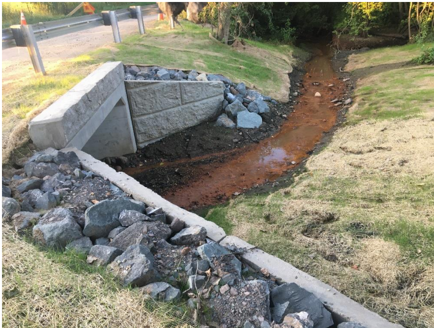
Mill Village Road culvert after replacement