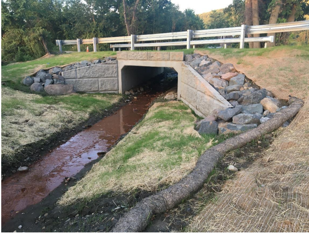
Mill Village Road culvert after replacement