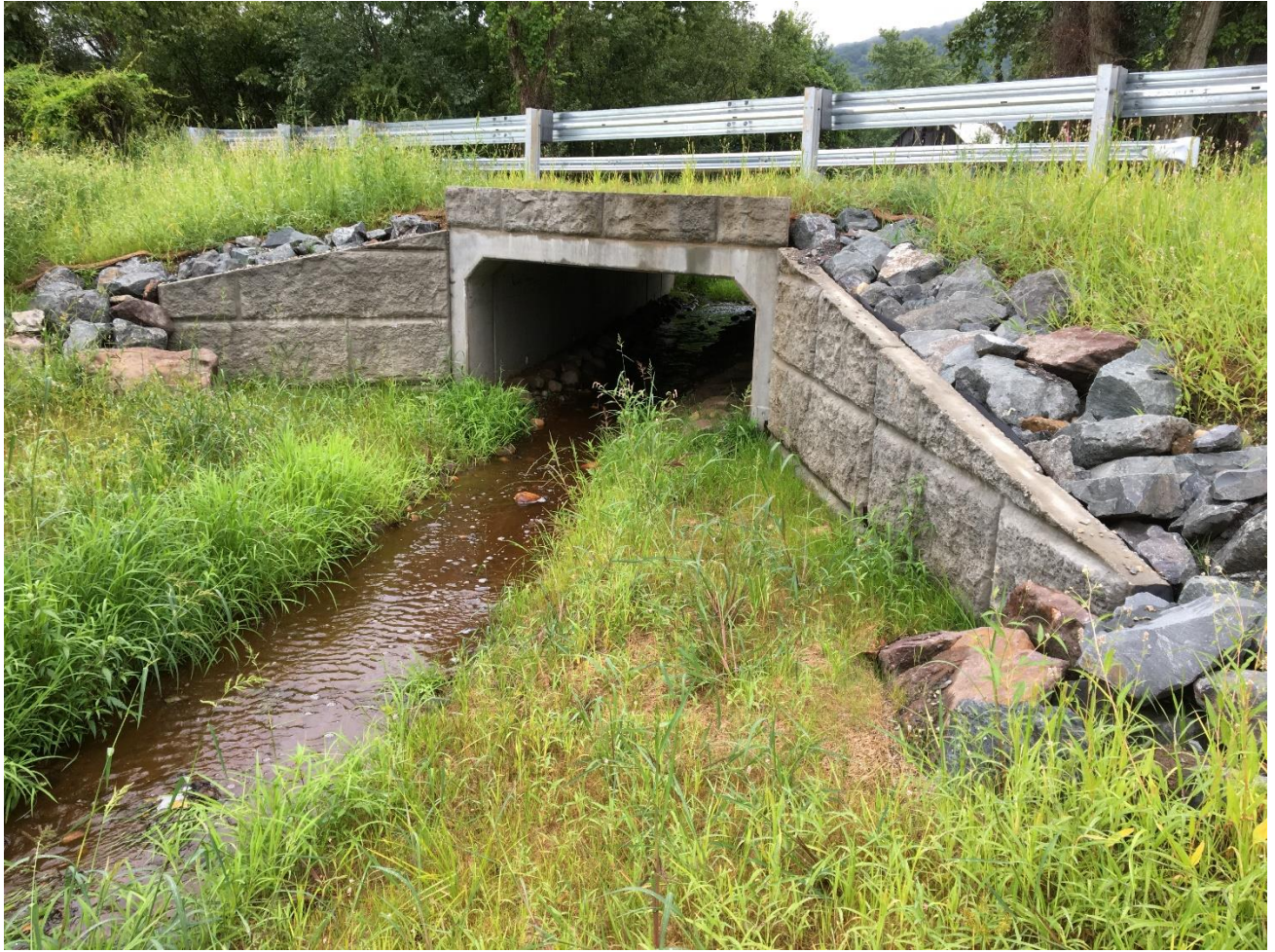
Mill Village Road culvert after replacement