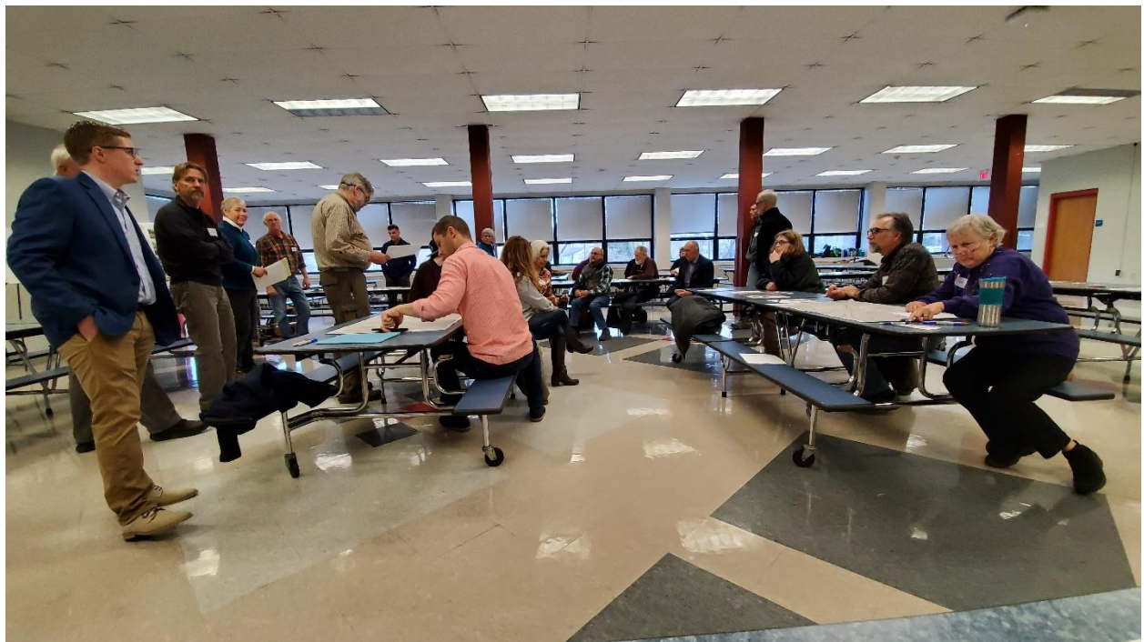
Design charrette at Deerfield's Climate Resiliency Forum