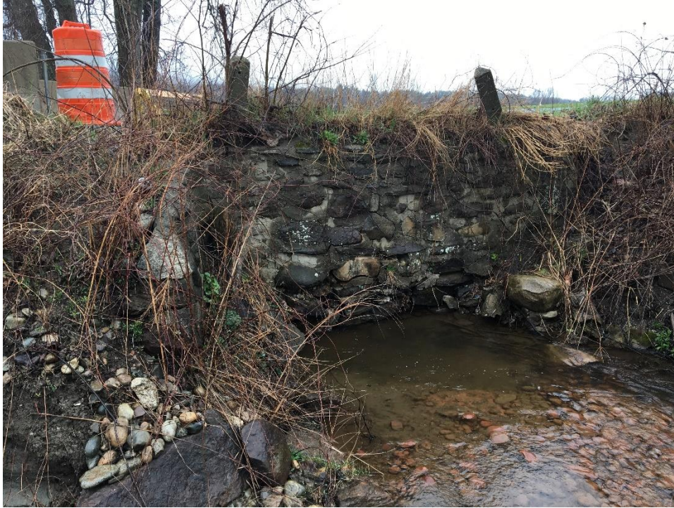
Flooding at Mill Village Road culvert before replacement