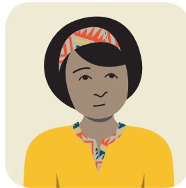
Ten infeson di tuberkulozi Has TB infection

It is important to take medicine for TB infection now.