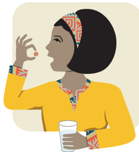
Ta toma ramedi pa tuberkulozi Takes TB medicine