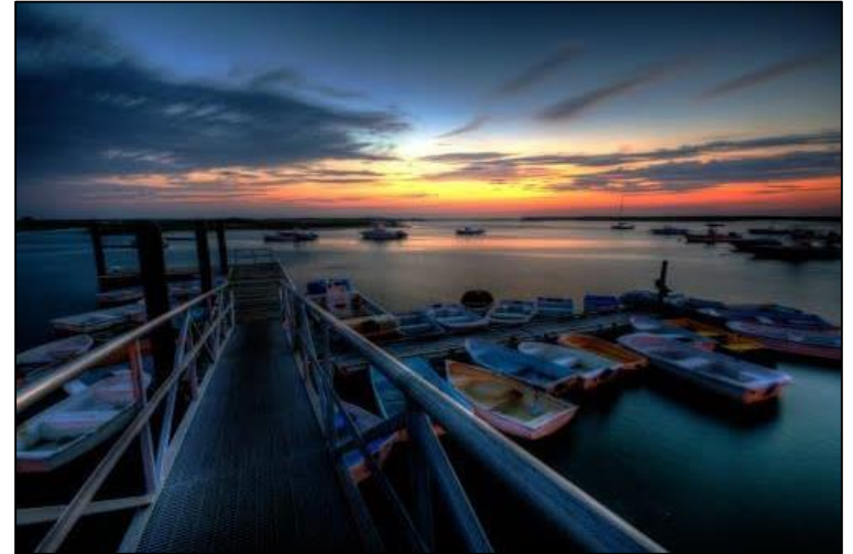
Pamet Harbor in Truro – 2018 Navigational Dredging Pilot Program Project.

Source: State of Our Harbors Report 2015, prepared by UMass Boston Urban Harbors Institute and Apex Companies for MA Division of Waterways.