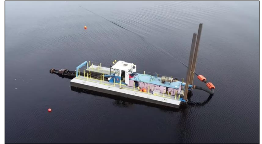
Dredging of Cole River in Swansea – 2018 Navigational Dredging Pilot Program Project.