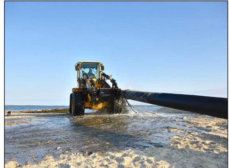
Dredging of Lake Tashmoo Channel in Tisbury – 2018 Navigational Dredging Pilot Program Project.

Source: "Art of Dredging: Edgartown Crew Tackles the Job at Tashmoo," Vineyard Gazette , article dated Oct-9-2018. Accessed 2019-02-19 at vineyardgazette.com .