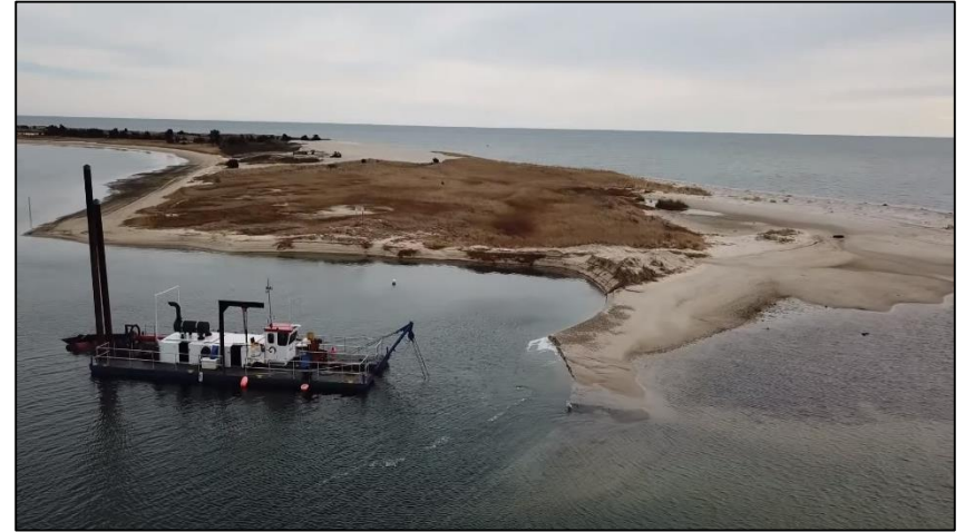
Dredging of Cotuit Bay and Sampson's Island in Barnstable – 2018 Navigational Dredging Pilot Program Project.

Source: YouTube, "Dredging of Cotuit Bay and Sampson's Island Part Three," Drone guy, published Jan-1-2019. Accessed Feb-15-2019 at youtu.be/QHxjHM47phY .