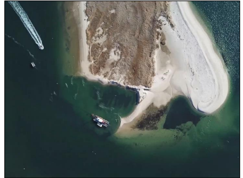
Dredging of Cotuit Bay and Sampson's Island in Barnstable – 2018 Navigational Dredging Pilot Program Project.