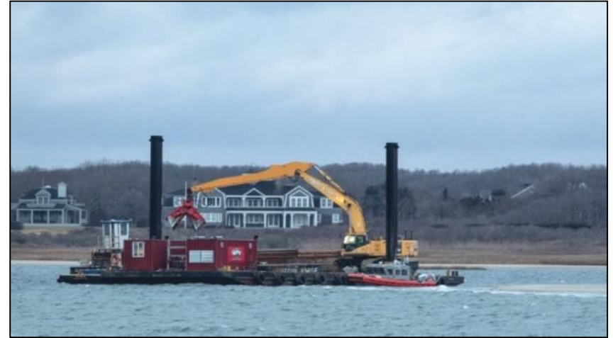
Dredging of Polpis Harbor in Nantucket – 2018 Navigational Dredging Pilot Program Project.

Source: "Dredging underway in Polpis Harbor," The Inquirer and Mirror , article dated Feb-15-2019. Accessed Feb-19-2019 at www.ack.net .