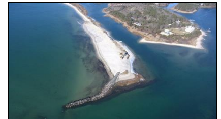
Dead Neck Island in Barnstable after beach nourishment (2019).