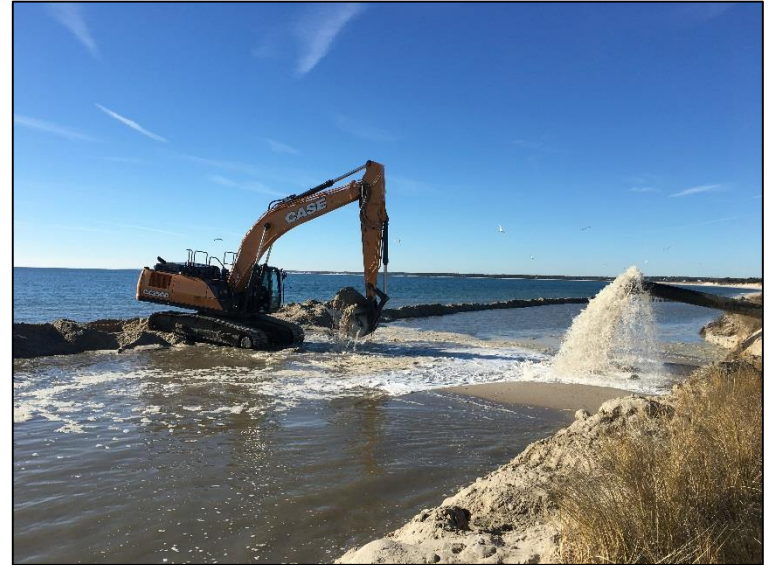
Beach nourishment at Deck Neck Island in Barnstable – 2018 Navigational Dredging Pilot Program Project.