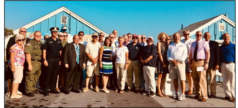
Lt. Governor Karyn Polito announces 2018 Navigational Dredging Pilot Program awards in Barnstable.