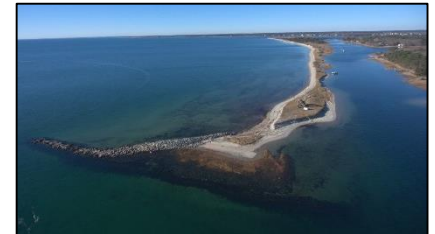
Dead Neck Island in Barnstable before beach nourishment (2018).