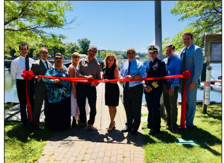
Lt. Governor Karyn Polito cuts ribbon to celebrate completion of Manchester Harbor Dredging Project – first dredging project to receive funding through an EOHED program (MassWorks).