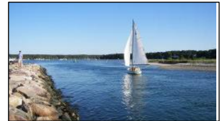
Lake Tashmoo Channel, Tisbury.