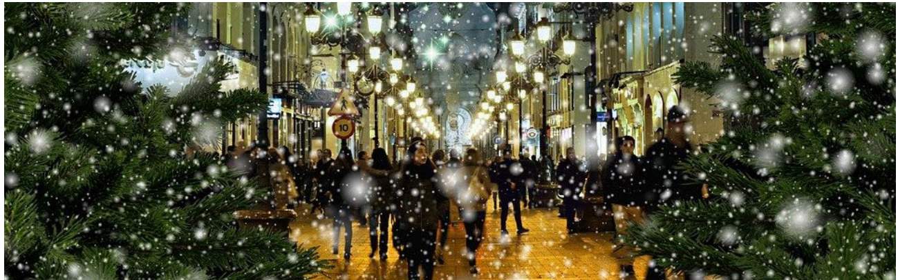
Downtown Crossing Holiday Shoppers

or at the Statehouse Archives at: https://archives.lib.state.ma.us/handle/2452/826119