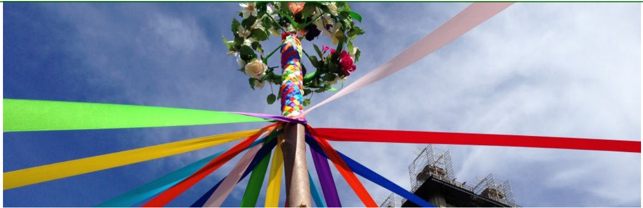
The May Pole

https://www.mass.gov/lists/communication-to-public-water-suppliers