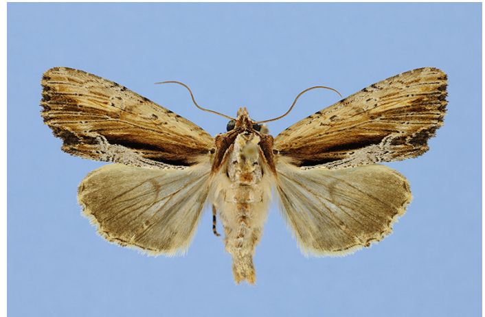
Apamea inebriata • Specimen from MA: Plymouth Co., Plymouth, collected 27 Jul 2002 by M.W. Nelson

DESCRIPTION: The Drunk Apamea Moth ( Apamea inebriata ) is a noctuid moth with a forewing length of 15-19 mm (Ferguson 1977). The forewing is longitudinally streaked with straw-yellow along the costal margin, reddish-brown through the median area, black between the median area and the inner margin, and whitish-gray along the inner margin, giving an overall appearance that is cryptic on dead wood (Mikkola et al. 2009). The reniform spot is faintly outlined with black and white dots. The hind wings are tan to brown, darker toward the wing margin, with a faint, elongate discal spot. Elongate scales on the head and thorax are a mixture of straw-yellow, reddish-brown, black, and whitish-gray, matching the overall coloration of the forewing. The abdomen is tan with elongate, reddish-brown and white scales dorsally. Apamea inebriata was described and separated from the similar and more common and widespread Apamea verbascoides by Ferguson (1977). As compared to A. verbascoides , A. inebriata is slightly smaller (forewing length ~1 mm shorter on average) and has a brighter appearance overall, with brown streaks that are more reddish, and the gray area along the inner margin more whitish and contrasting. A. inebriata has a black basal dash that is shorter and thinner (sometimes almost completely absent) as compared to A. verbascoides .