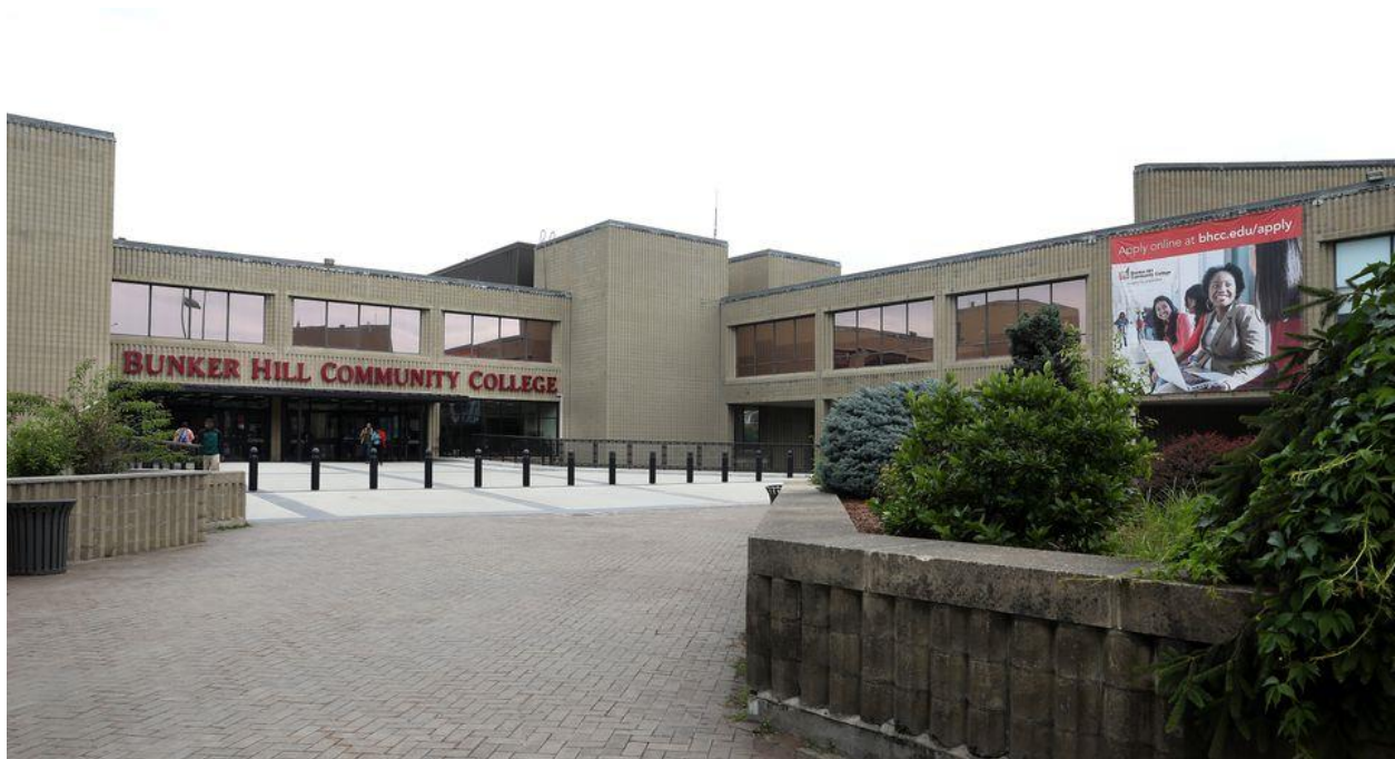
Bunker Hill Community College – Charlestown Campus

Built in 1973, the main campus is situated on approximately 32 acres in the historic Charlestown neighborhood of Boston, Massachusetts. As BHCC's primary location, the Charlestown campus features state-of-the-art classrooms, labs, and other facilities for the college's programs including nursing and allied health, domestic and international business, hospitality and culinary arts, early childhood development, electronics, computer applications, and an art gallery.