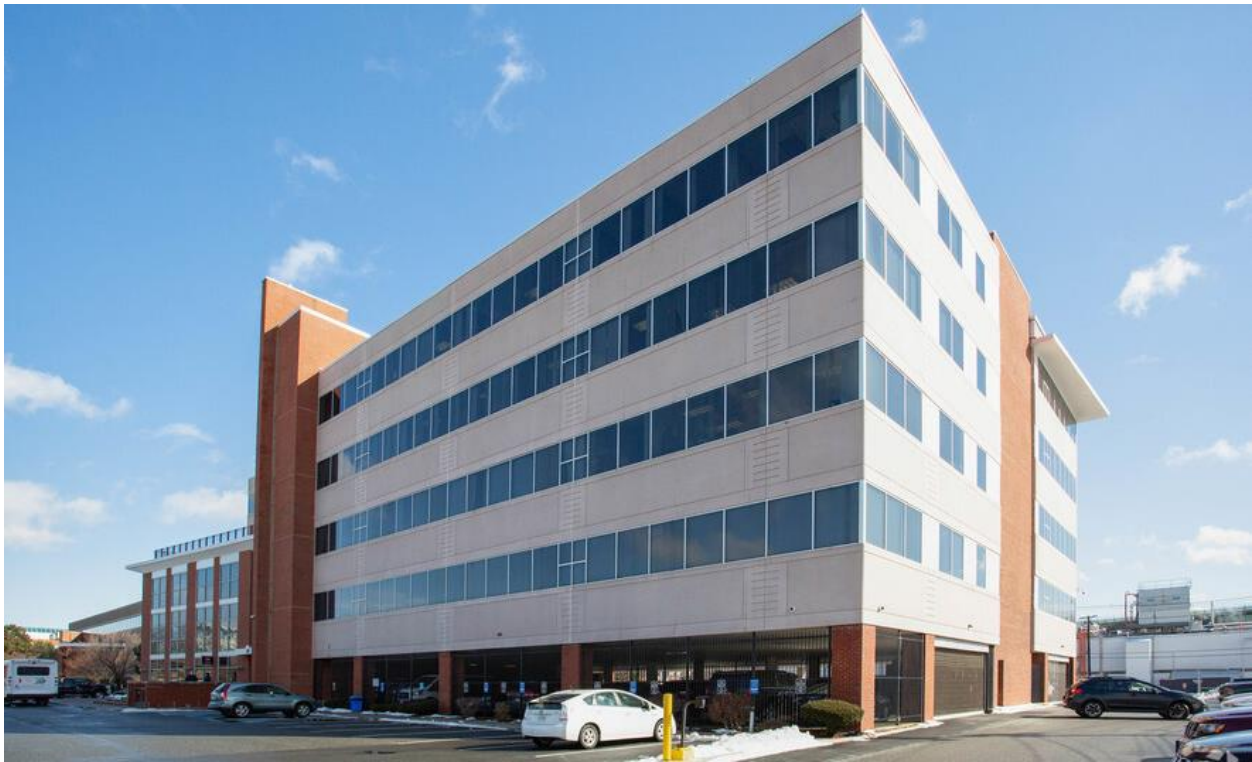
Bunker Hill Community College – Chelsea Campus

In addition to its two main campuses in Charlestown and Chelsea, Bunker Hill Community College has satellite locations in Malden and the South End, along with several instructional locations spread across many Greater Boston communities. The curricula available at these locations includes foundation courses that fulfill general education requirements for degrees and certificates, as well as courses in response to community interest, such as offerings in business, allied health and computer technology.