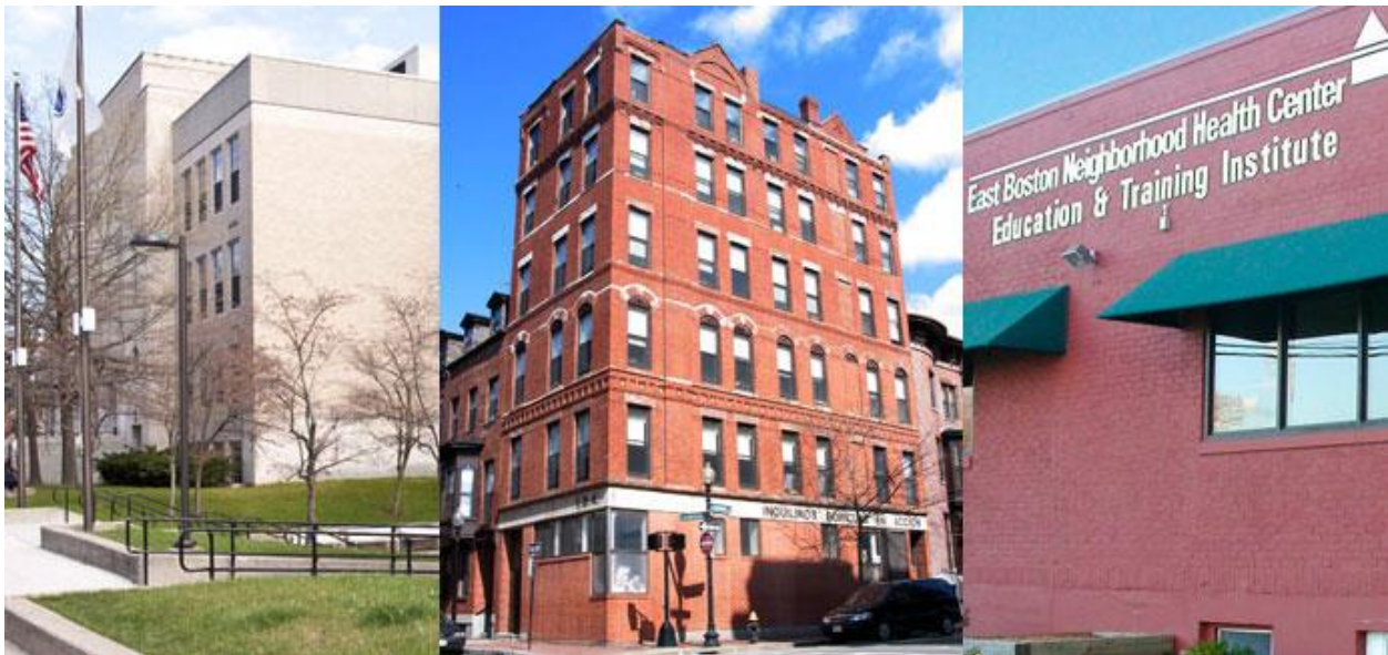
Bunker Hill Community College - Satellite Locations

In addition to its two main campuses in Charlestown and Chelsea, Bunker Hill Community College has satellite locations in Malden and the South End, along with several instructional locations spread across many Greater Boston communities. The curricula available at these locations includes foundation courses that fulfill general education requirements for degrees and certificates, as well as courses in response to community interest, such as offerings in business, allied health and computer technology.