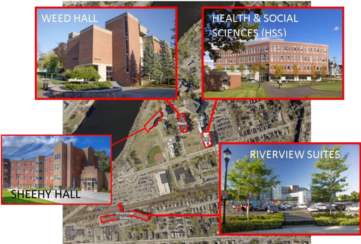
UMass Lowell South Campus