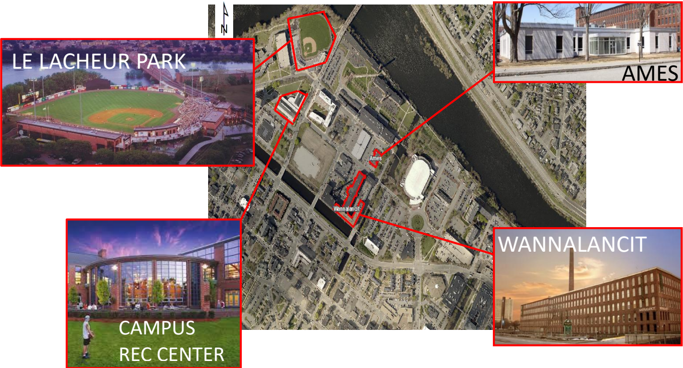
UMass Lowell East Campus