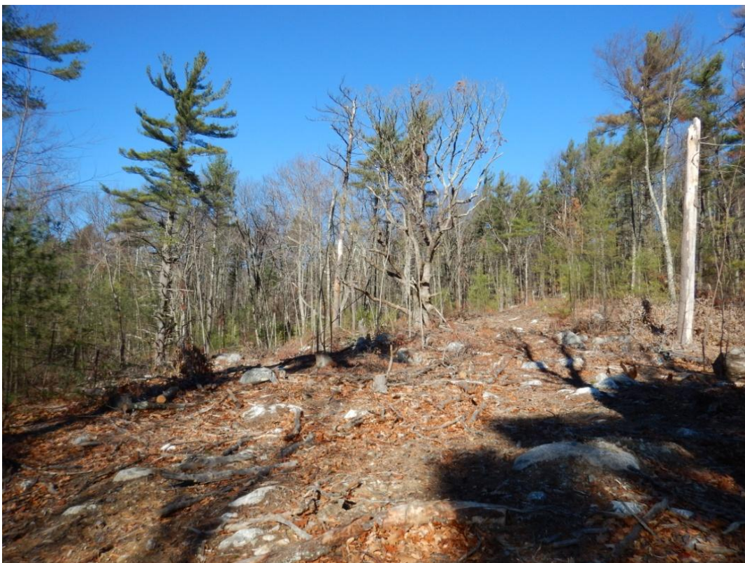
B. Another opening made on this extremely rocky hillside.