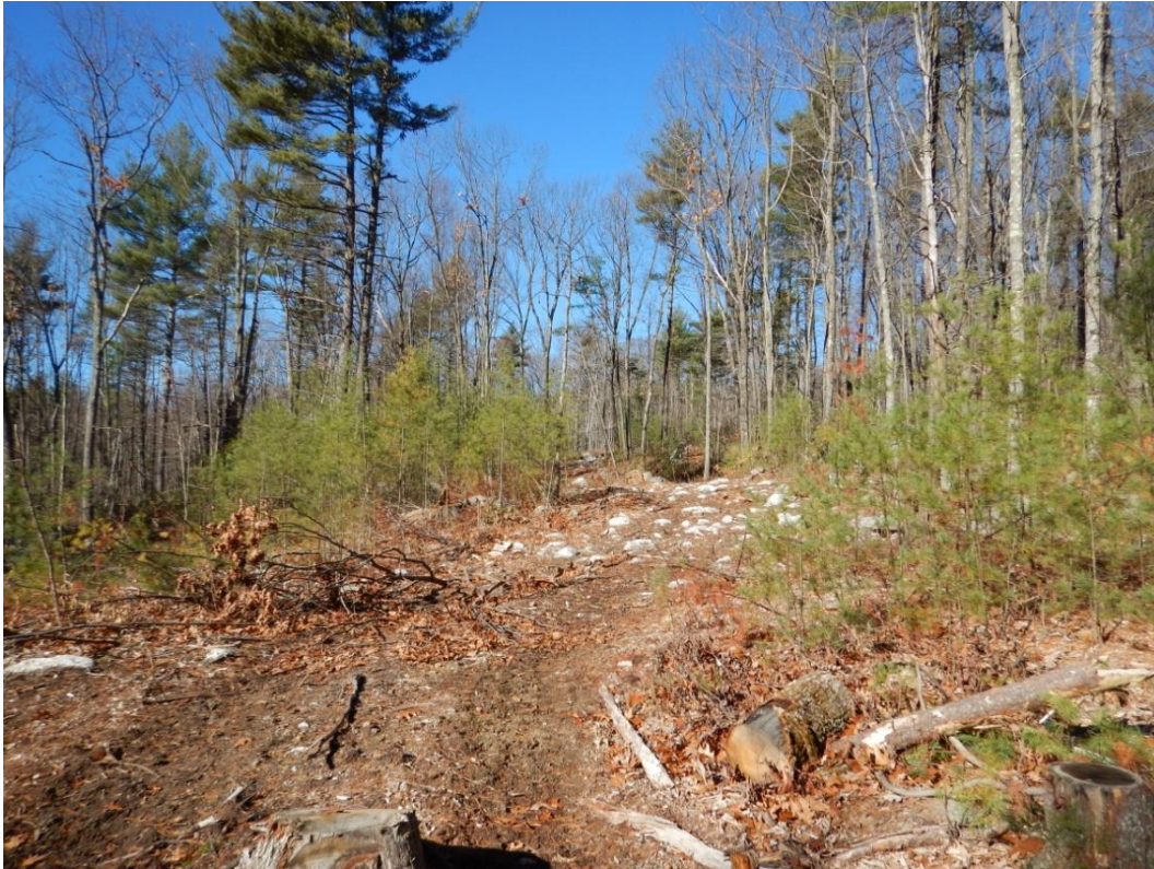
A. Most of the overstory has been removed to release this understory of white pines and hardwoods. Two consecutive excellent acorn crops have resulted in many oak seedlings becoming established.