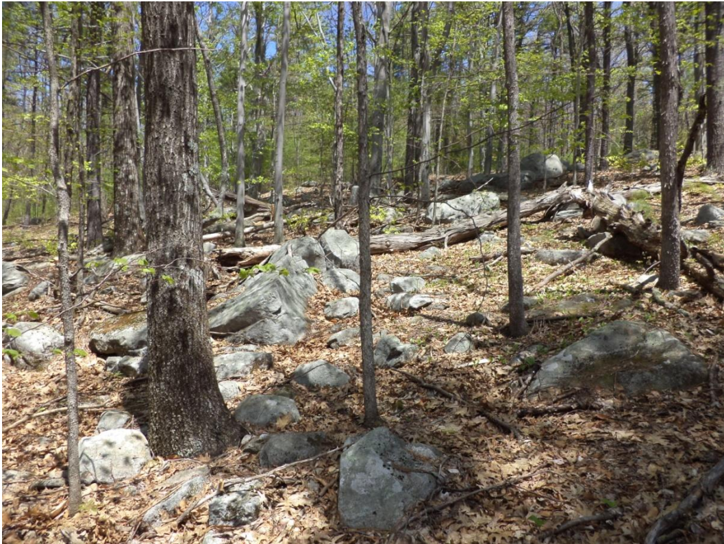
C. A typically rocky scene on this hillside.