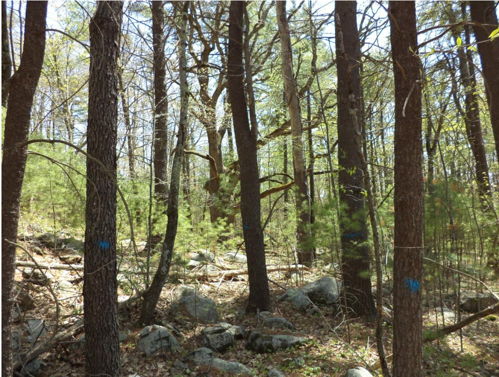
A. One of the large-crowned trees that pre-dates the abandonment of the pasture. This white oak is being retained in this opening where otherwise the overstory is being removed to release the understory of white pine and hardwood saplings.