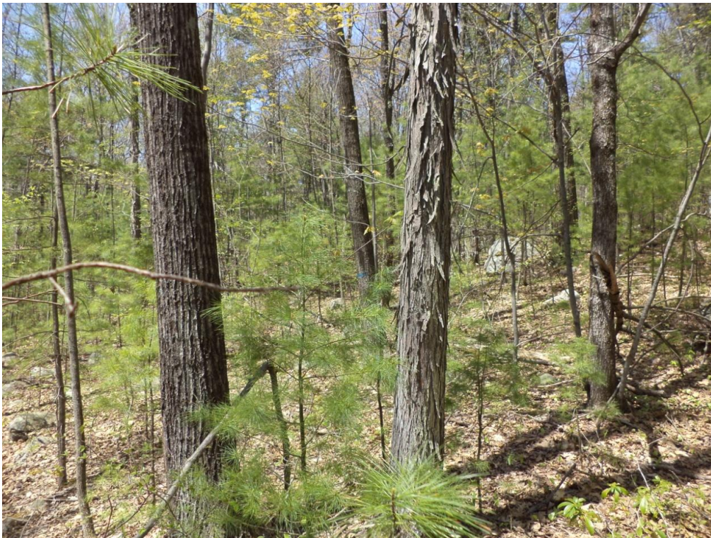
B. An area being thinned; the excellent quality red oak and shagbark hickory are being kept while the red oak in the background is marked for removal.