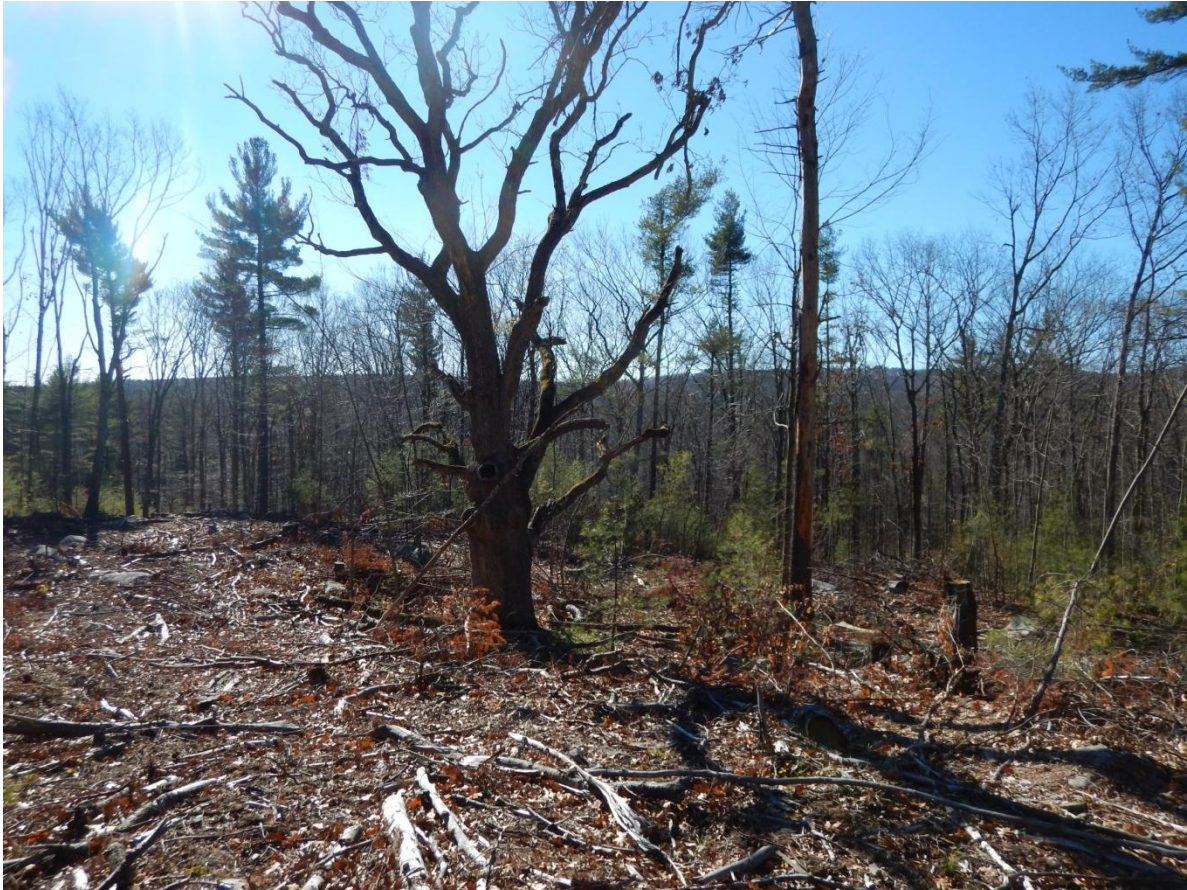
C. This open-grown white oak was growing on this hillside when it was still a pasture in the early 20th century. Trees such as this are routinely retained as biological legacies and are allowed to grow to the maximum potential life-span for the species.