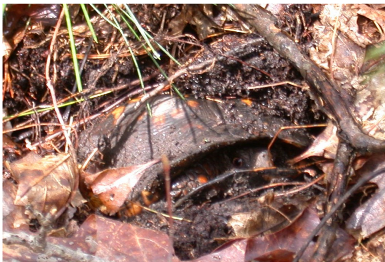
Figure 2. Eastern Box Turtle emerging from overwintering site.

Eastern Box Turtles may cease their activity as early as the 2 nd or 3 rd week in November but they have been known to be active until the third week of December in Barnstable County, Massachusetts (Ciaranca, 2005, pers. comm.). Eastern Box Turtles do not retreat to wetlands or rivers for overwintering, as do the Wood Turtle or Spotted Turtle. They remain in terrestrial habitat and bury down into the soil beneath leaf litter. They also use stump holes, pits, depressions and mammal burrows for overwintering. Most turtles overwinter with their carapaces just a few inches below the soil surface. Eastern Box Turtles are known to