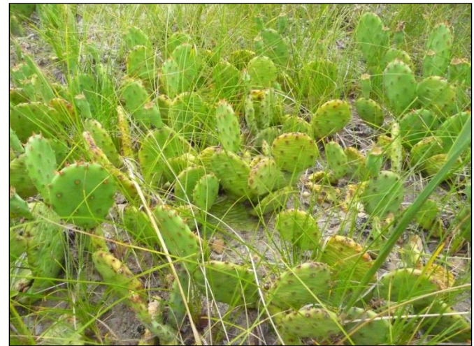
Eastern Prickly Pear flowers (top left), fruit (top right), and characteristic spreading growth form (bottom).