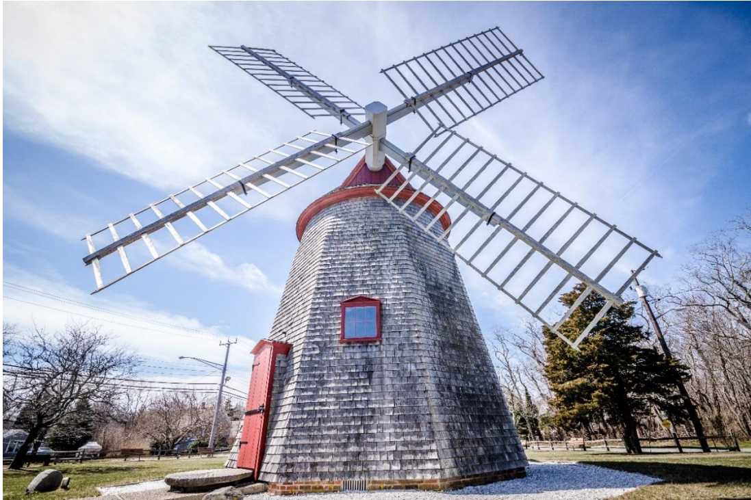
Image: Eastham Windmill 1