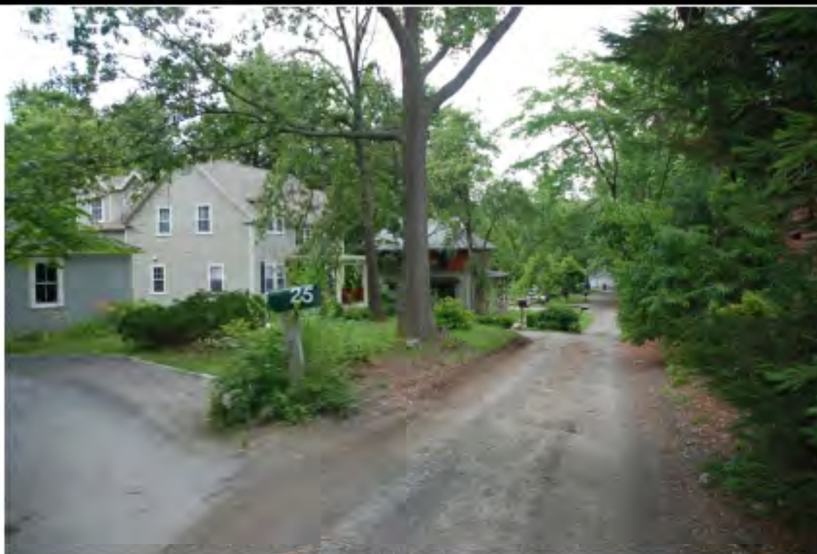
View along Gowell Lane, southwest end, facing NE