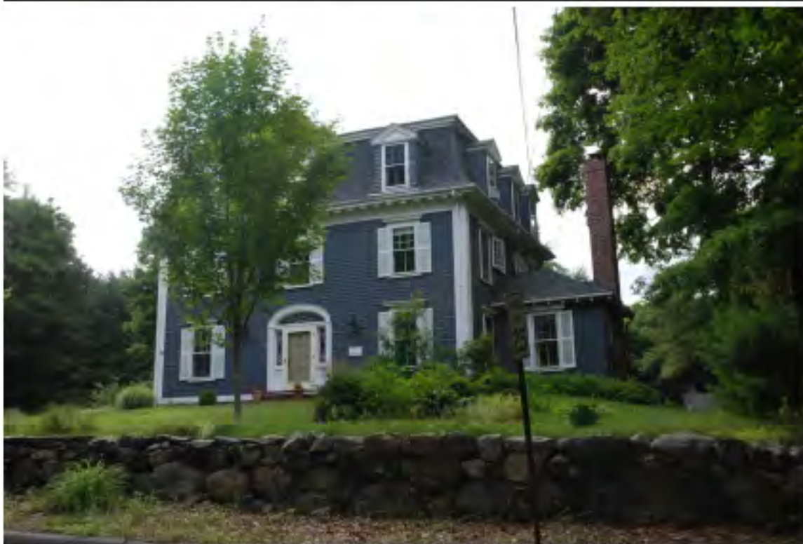
View of 72 Church Street, southeast façade and northeast elevation, facing W