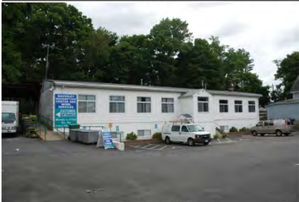
View of WLT.417, 23 Summer Avenue, facing SE.