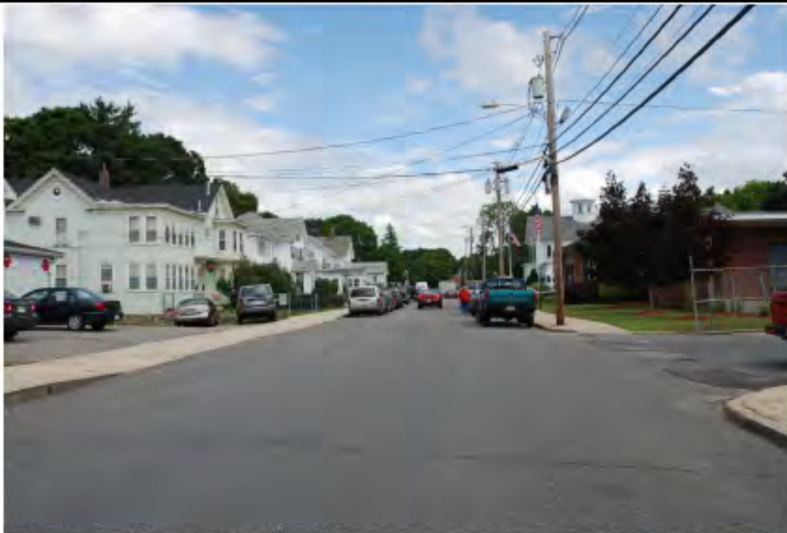
View of Church Street from location of 18 Church Street, facing S