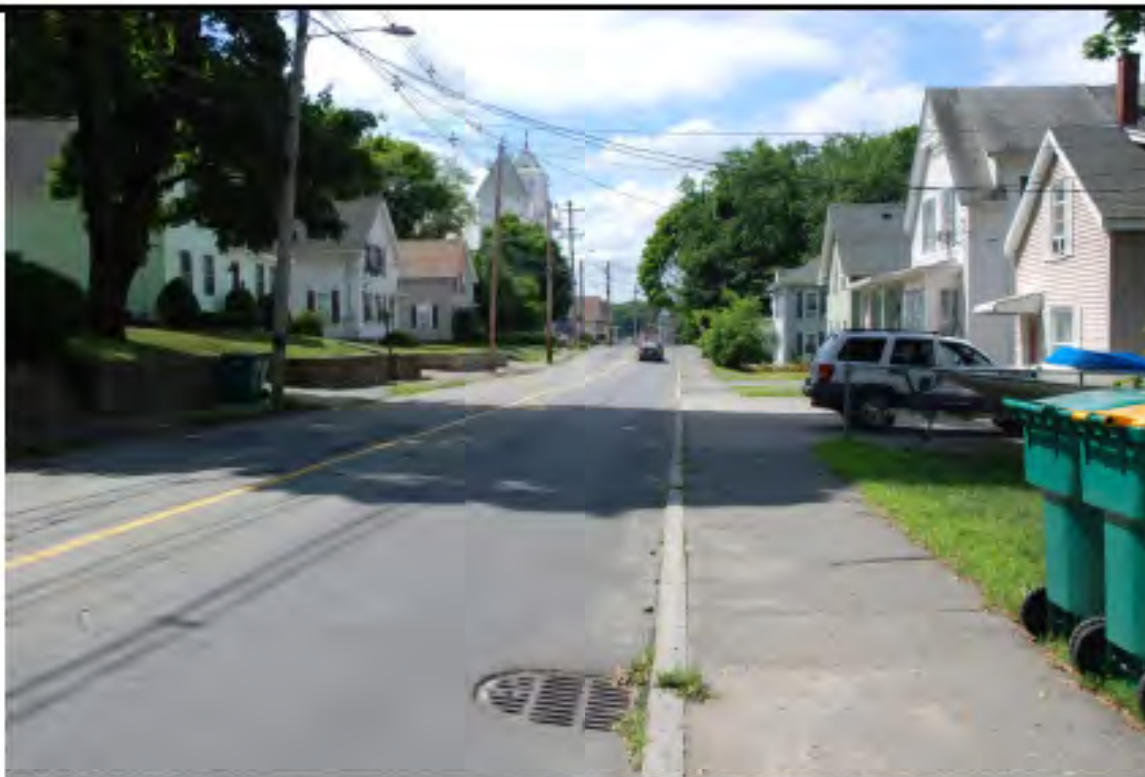
View along Manning Street from location of 58 Manning Street, facing S