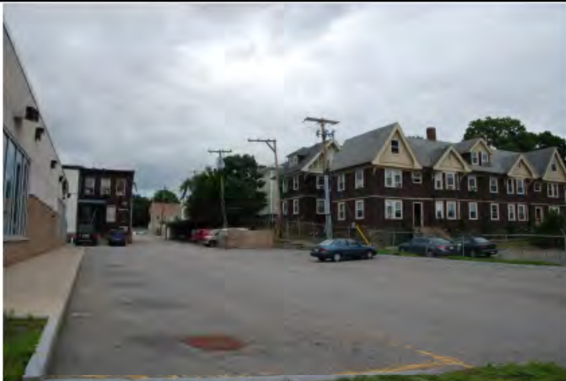
Lexington Avenue at former intersection of Ames Street, former site of American Knitting Company building on left, facing E