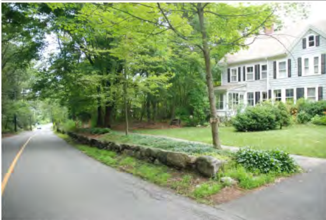
View along Conant Road from intersection with Gowell Lane, 25 Conant Road (WSN.436) visible on right, facing N