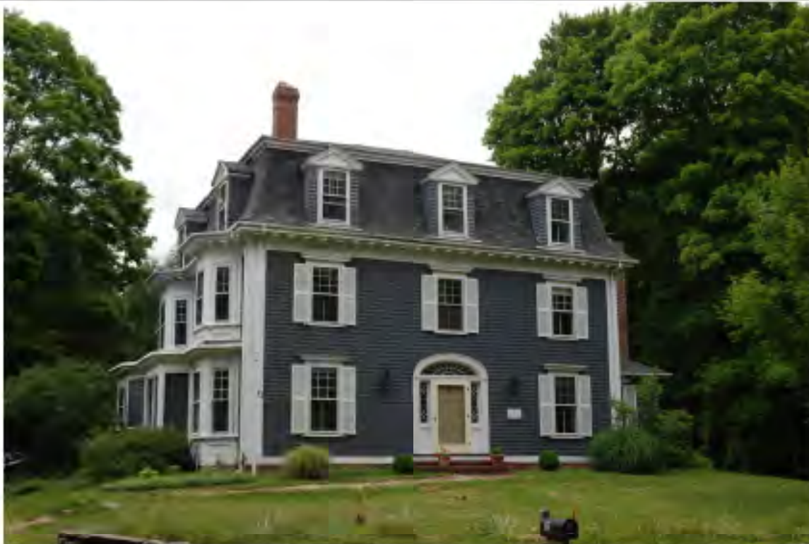
View of 72 Church Street, southeast façade and southwest elevation, facing north