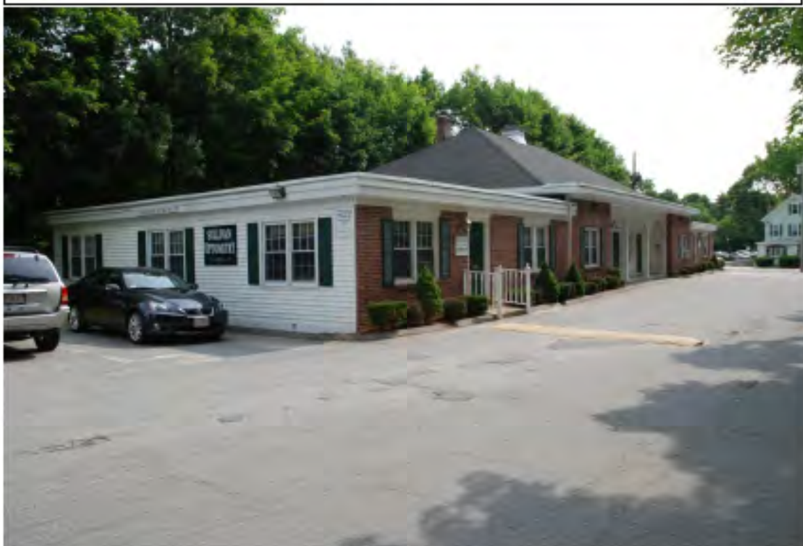
View facing NE