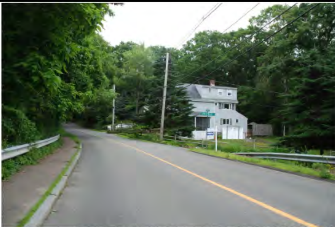
View along Conant Road from north boundary of area, 42 Conant Road (WSN.442) visible in background, facing S