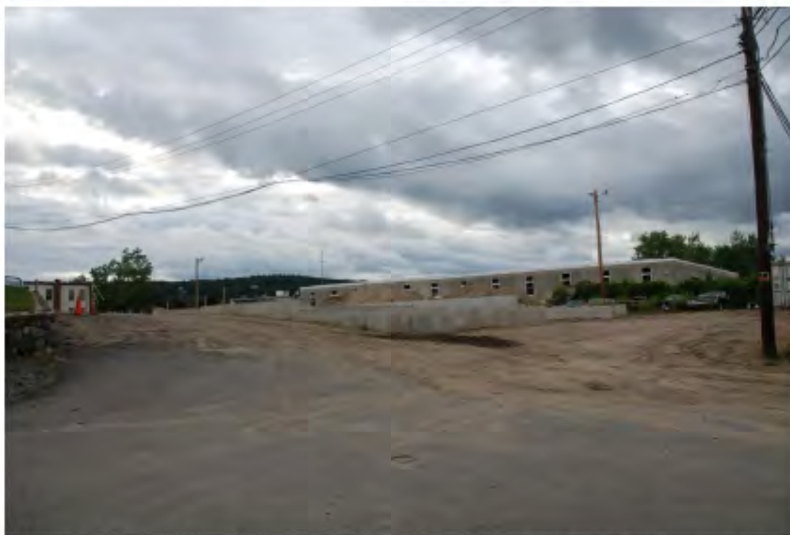
North end of Summer Avenue, showing former site of B.C. Ames Building and beginning construction of new building, facing NW