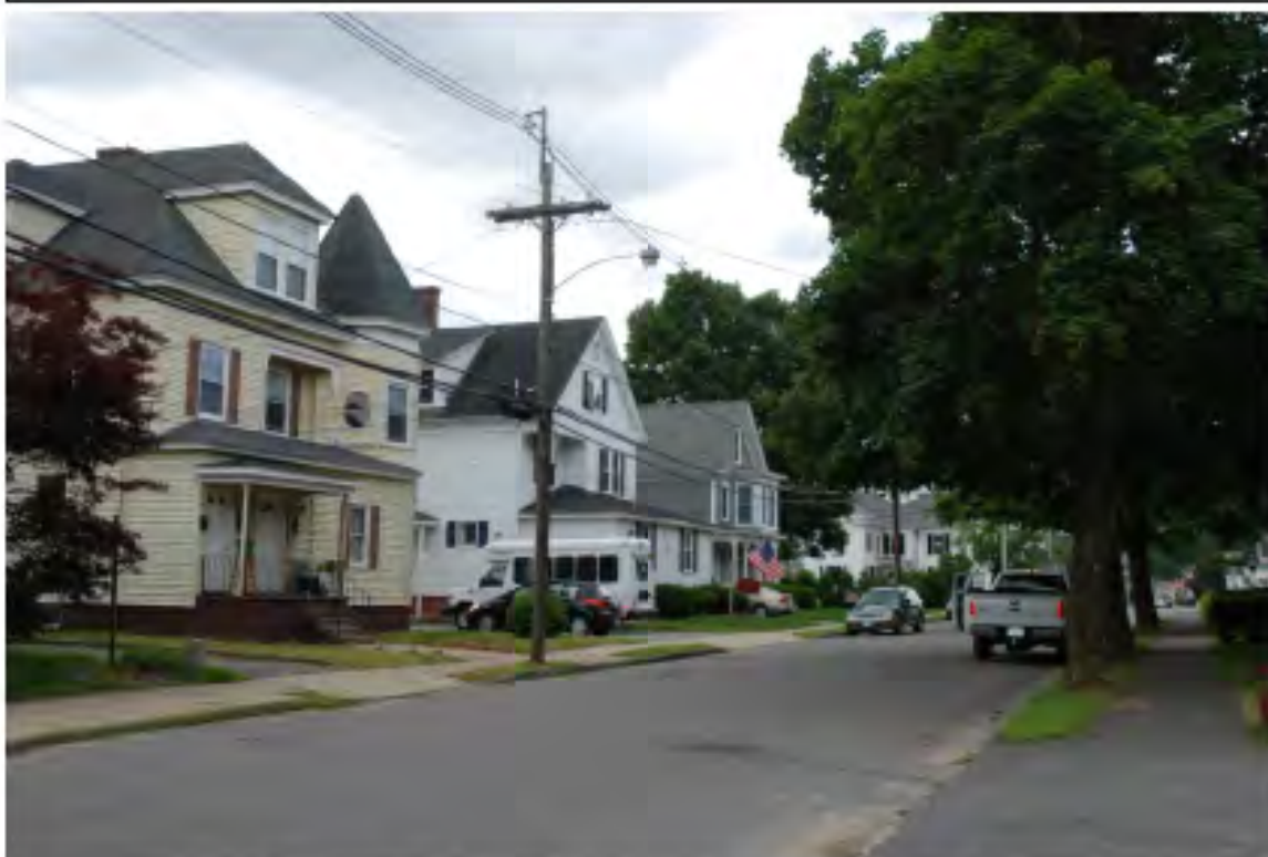
View along Church Street, from location of 45 Church Street, facing SE