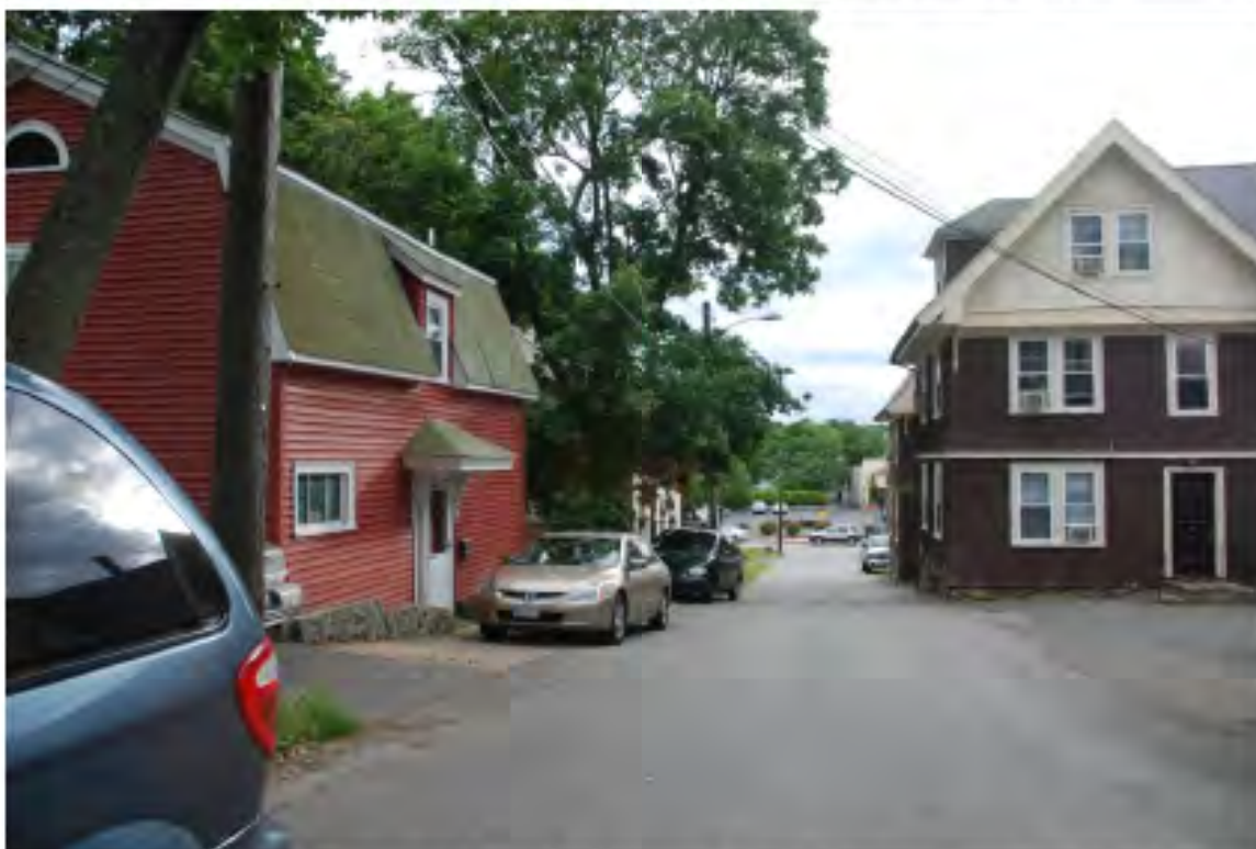
View of east end of Lexington Terrace toward Lexington Avenue, facing W