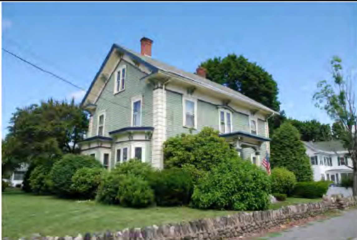
View of 14 Lincoln Street, east façade and south elevation, facing NW