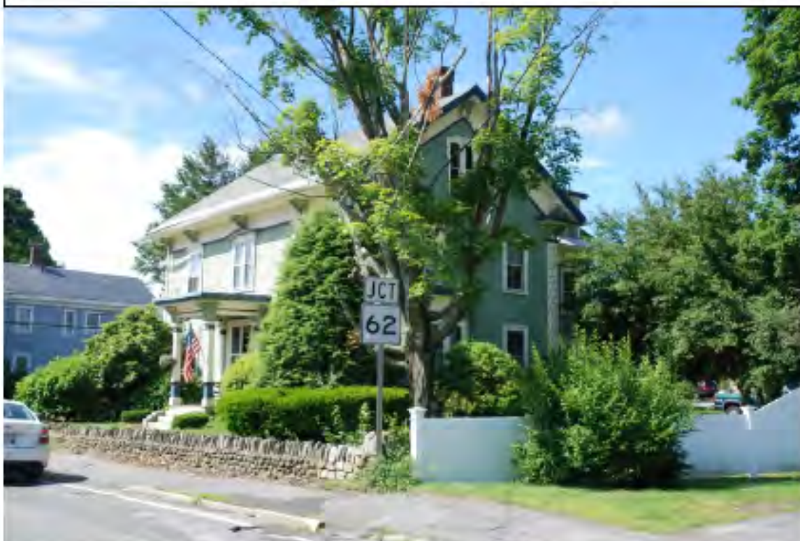
View of 14 Lincoln Street, east façade and north elevation, facing SW