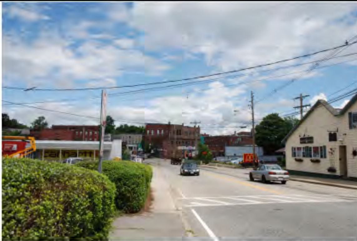
View along Washington Street from intersection of Park Street, facing NE