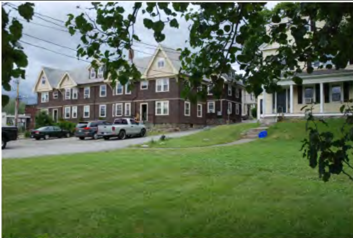
Lexington Avenue at Lexington Terrace, WLT.422 and portion of WLT.418, facing NE