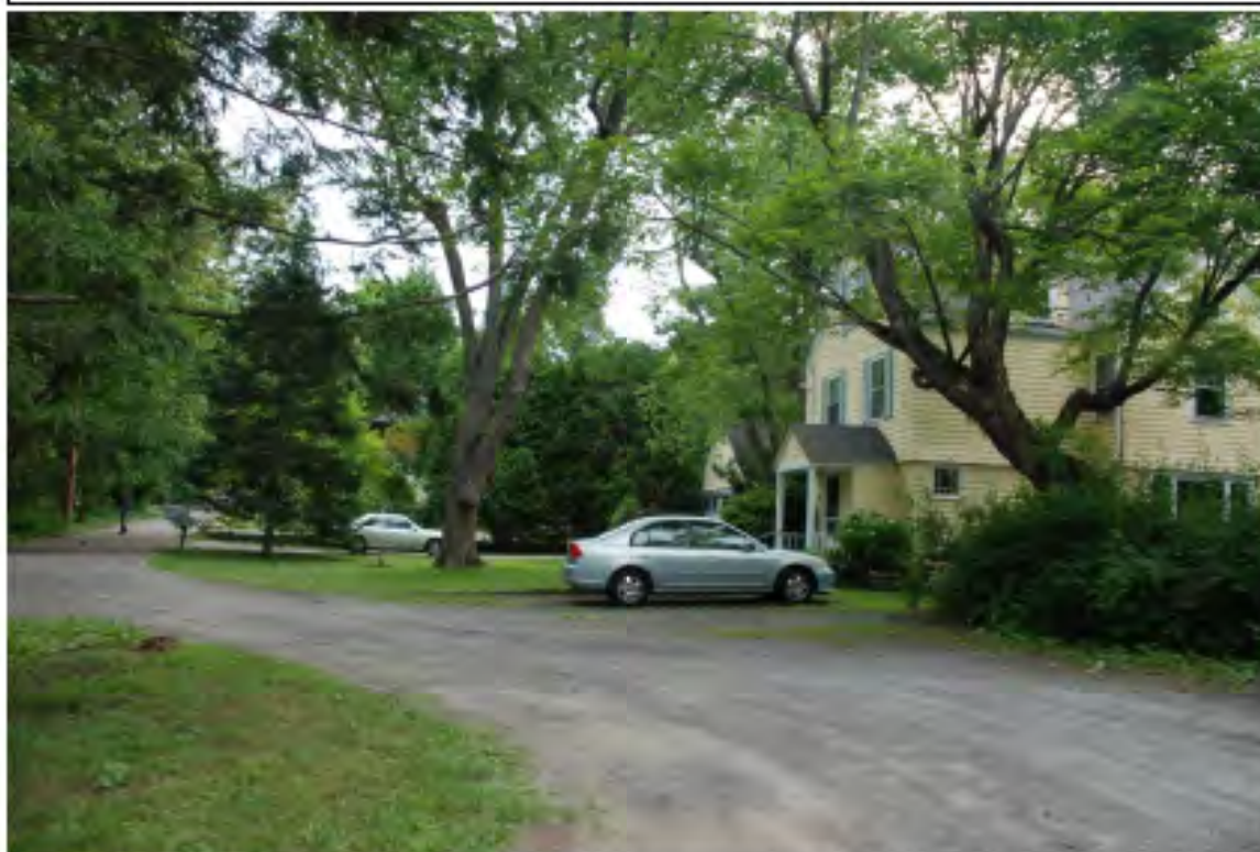
View along Gowell Lane, northeast end, facing SW