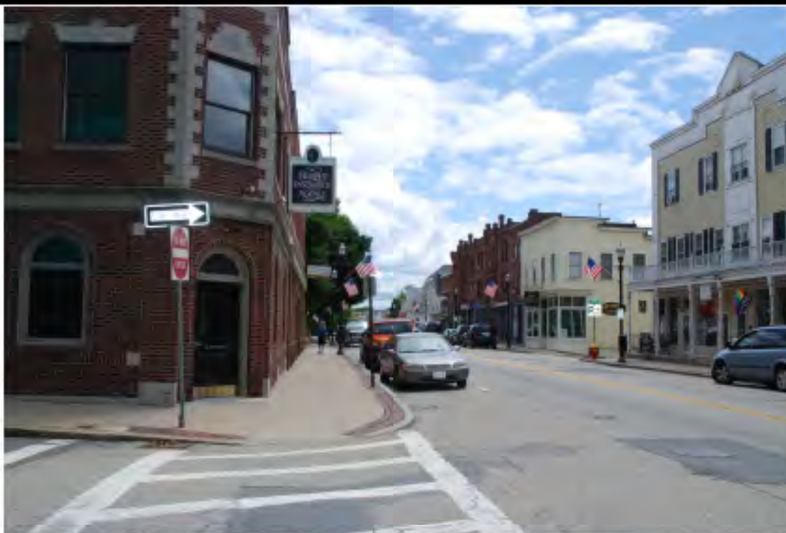
View along Main Street from intersection of Pope Street, facing E