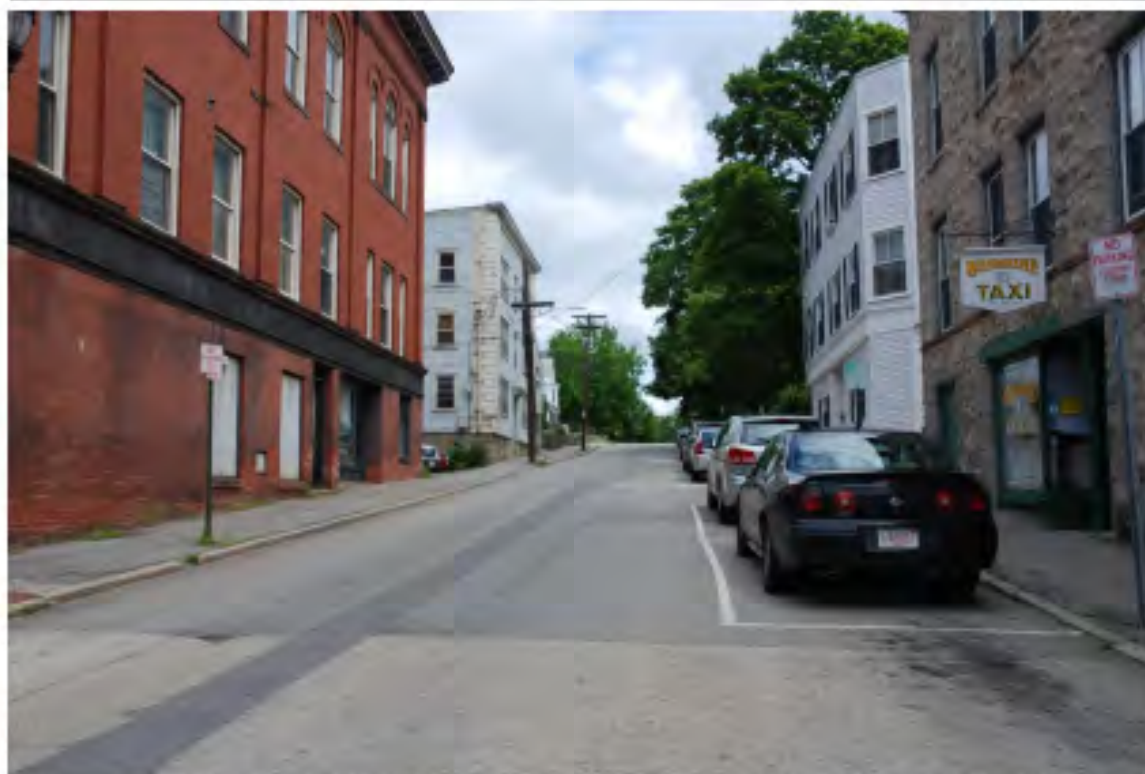
View along Felton Street from intersection of Main Street, facing N