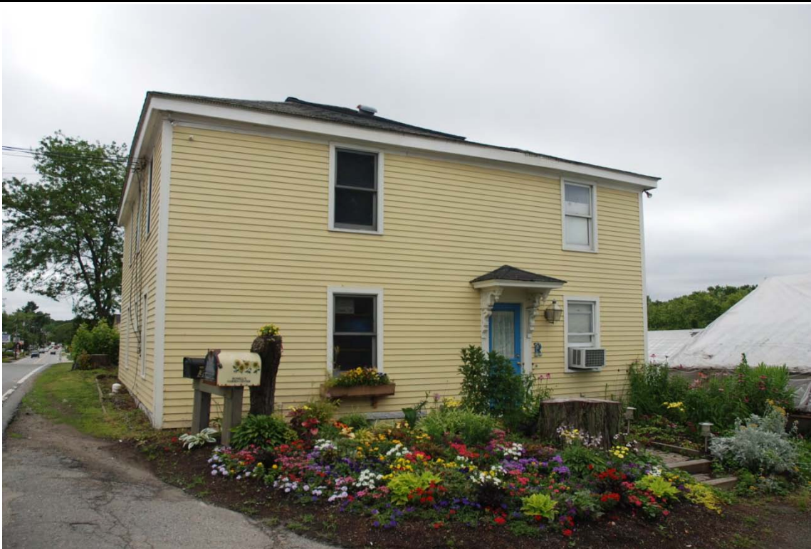
397 Boston Post Road (WAY.77), west facade, facing SE