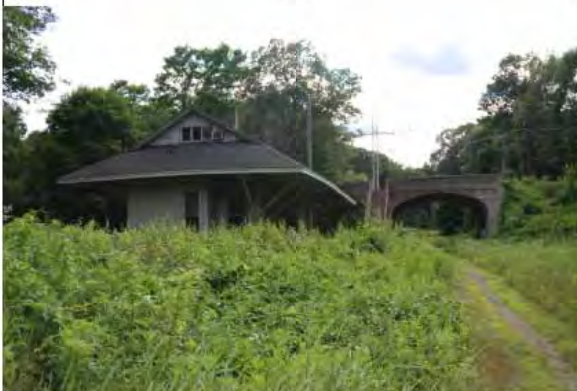
WNS.945 (Church St. Bridge with former railroad station (WSN.249) in front, facing W