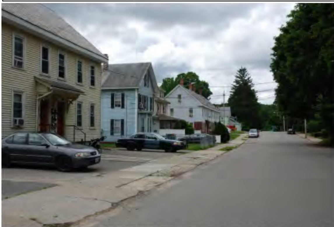
View along Pope Street from intersection of Pleasant Street, facing S