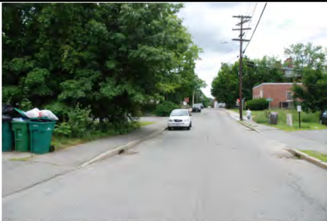
View along Felton Street from location of 28 Felton Street, facing S