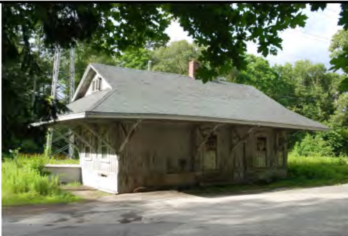
View of railroad station, south façade and west elevation, facing northeast