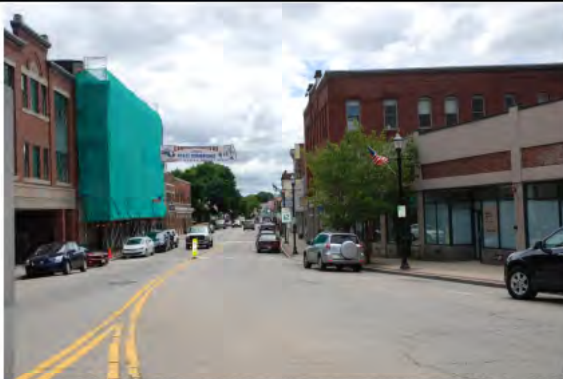
View along Main Street from intersection of Felton Street, facing E