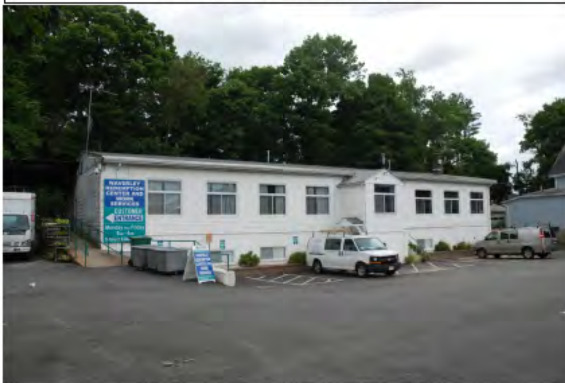
View of 23 Summer Avenue, west façade and north elevation, facing SE