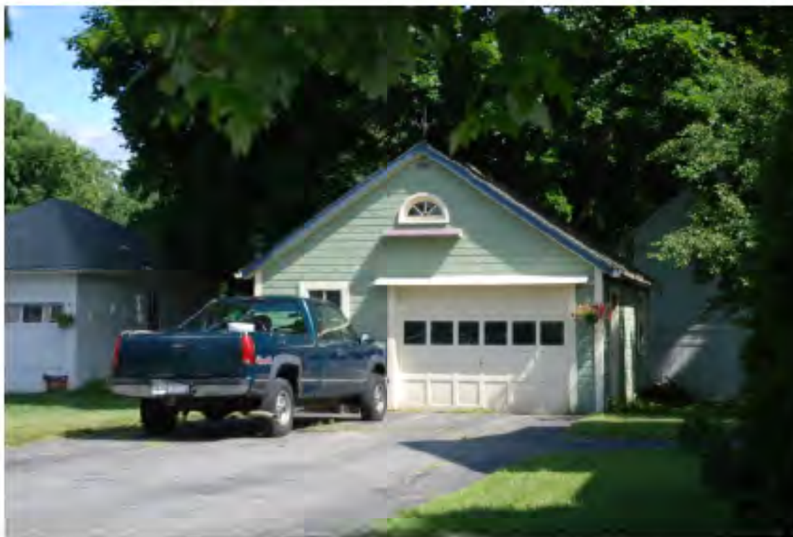
View of 14 Lincoln Street garage, facing NW