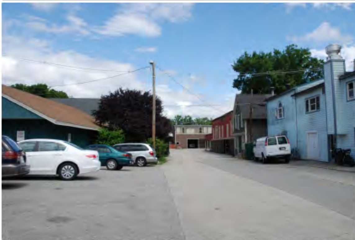
View of secondary industrial area south of Bruce Pond, from Main Street, facing N