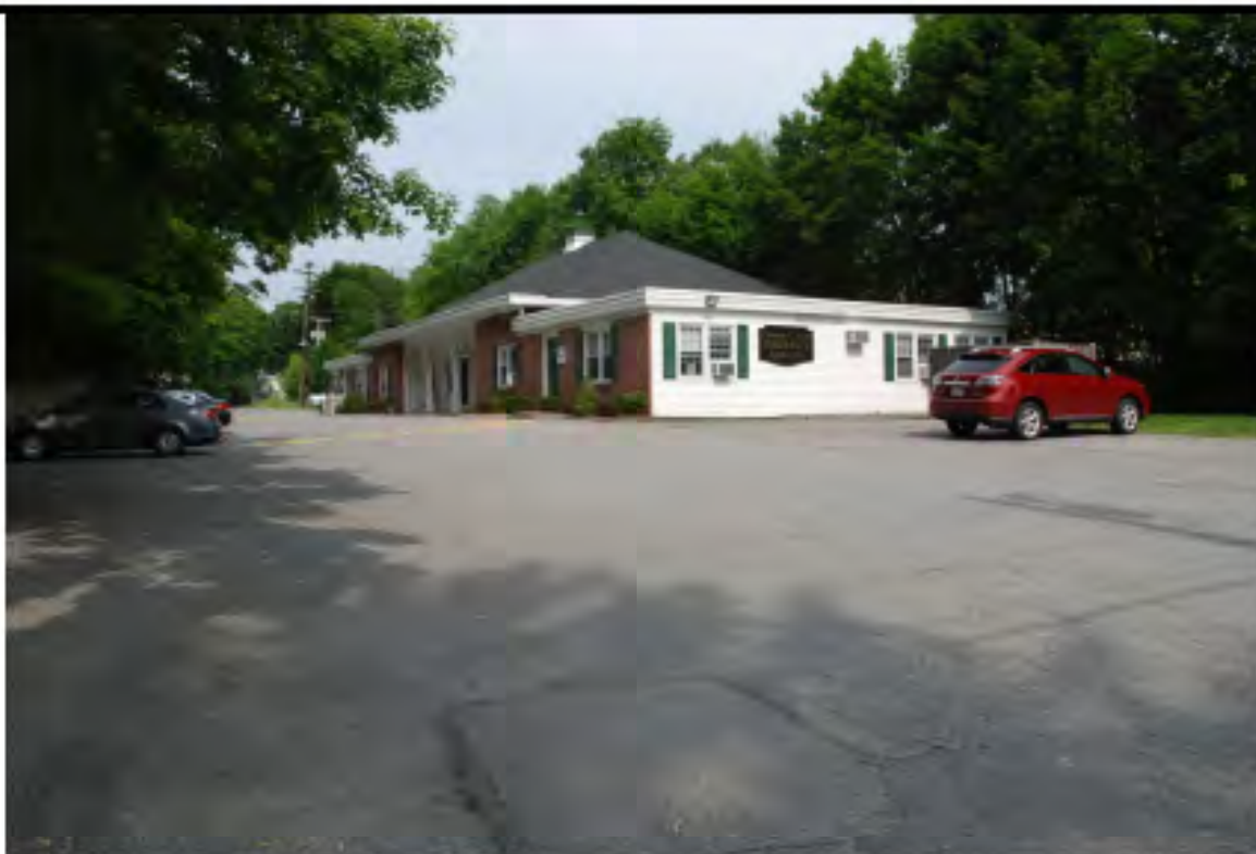
View facing NW