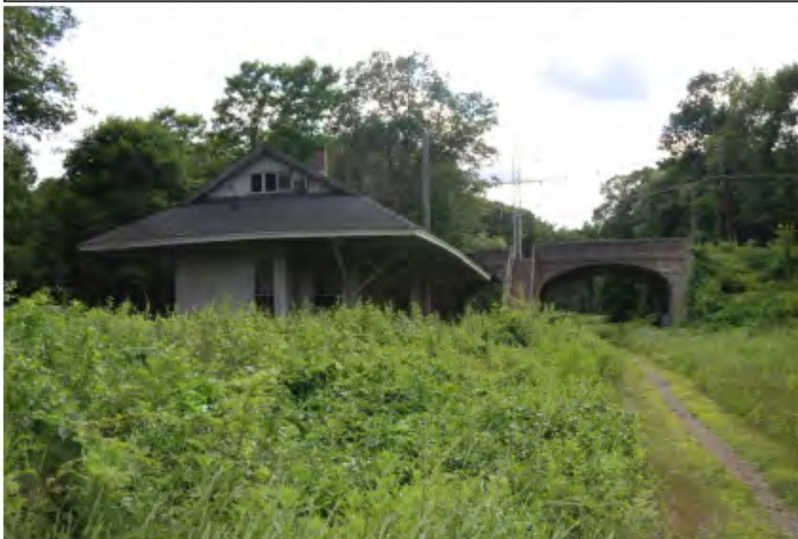
View of railroad station, north platform and east elevation, Church Street overpass (WSN.945) in background, facing W