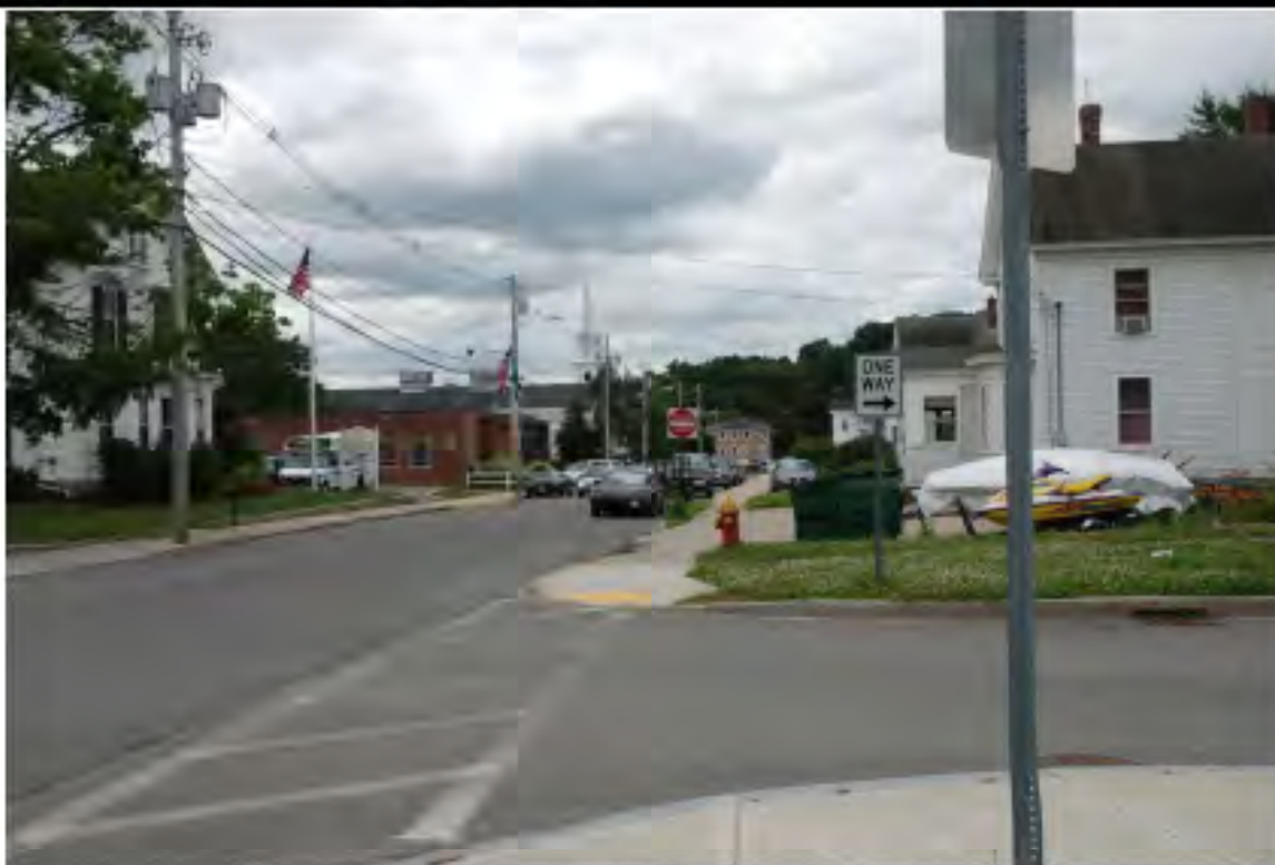
View along Church Street from intersection of Cross Street, facing S