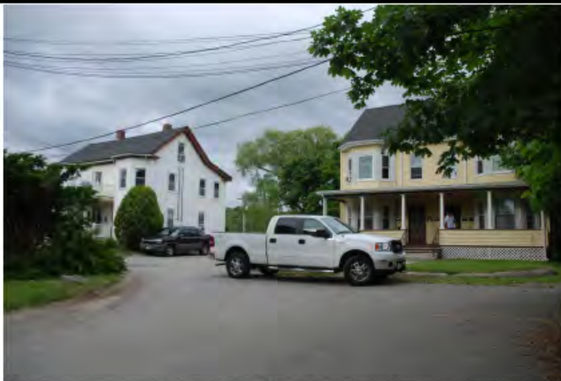
Houses at east end of Lexington Terrace, facing NE