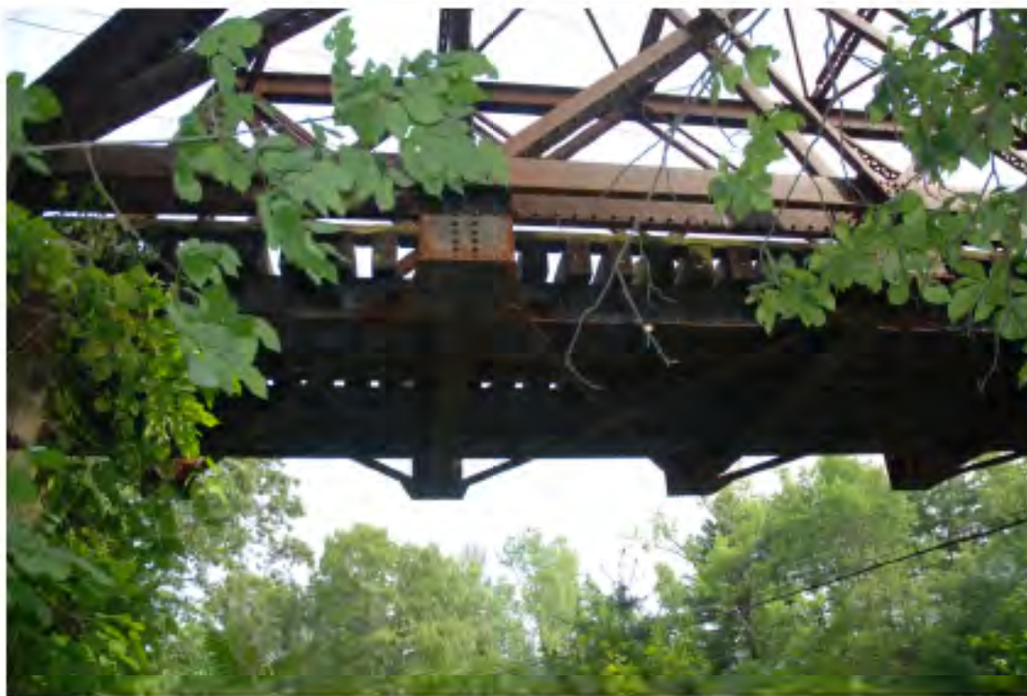
Underside of bridge, facing SW