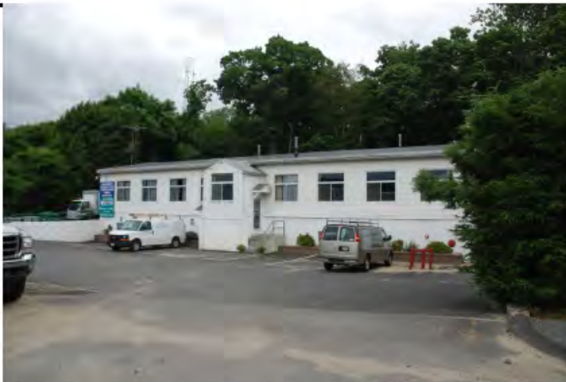
View of 23 Summer Avenue, west façade, facing NE