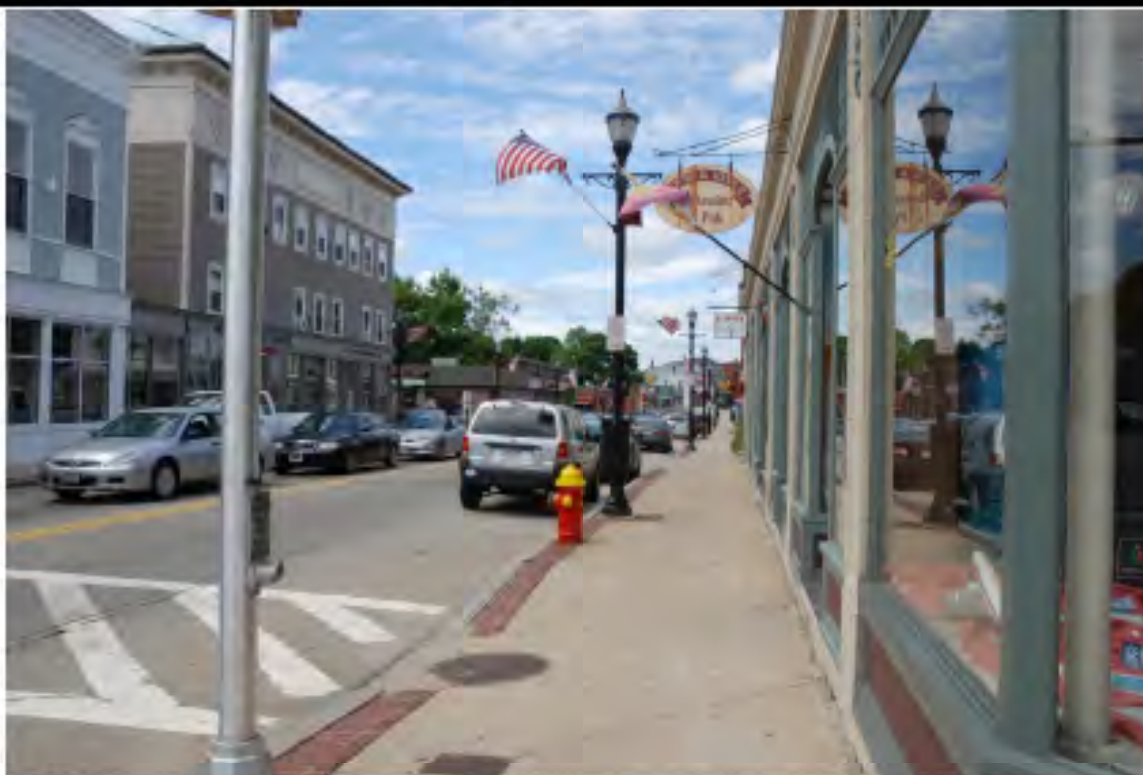
View along Main Street from intersection of Manning Street, facing W