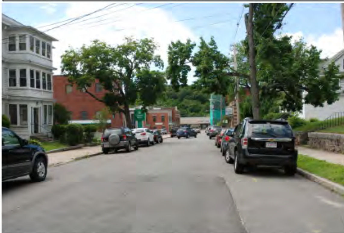
View along Pope Street from location of 31 Pope Street, facing S