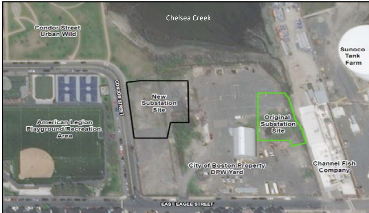
Figure 1: Location of East Eagle Substation