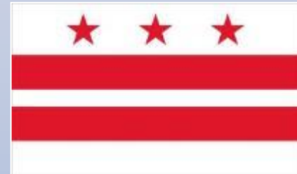
District of Columbia