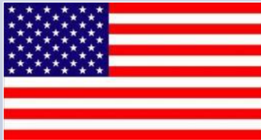
All 50 United States