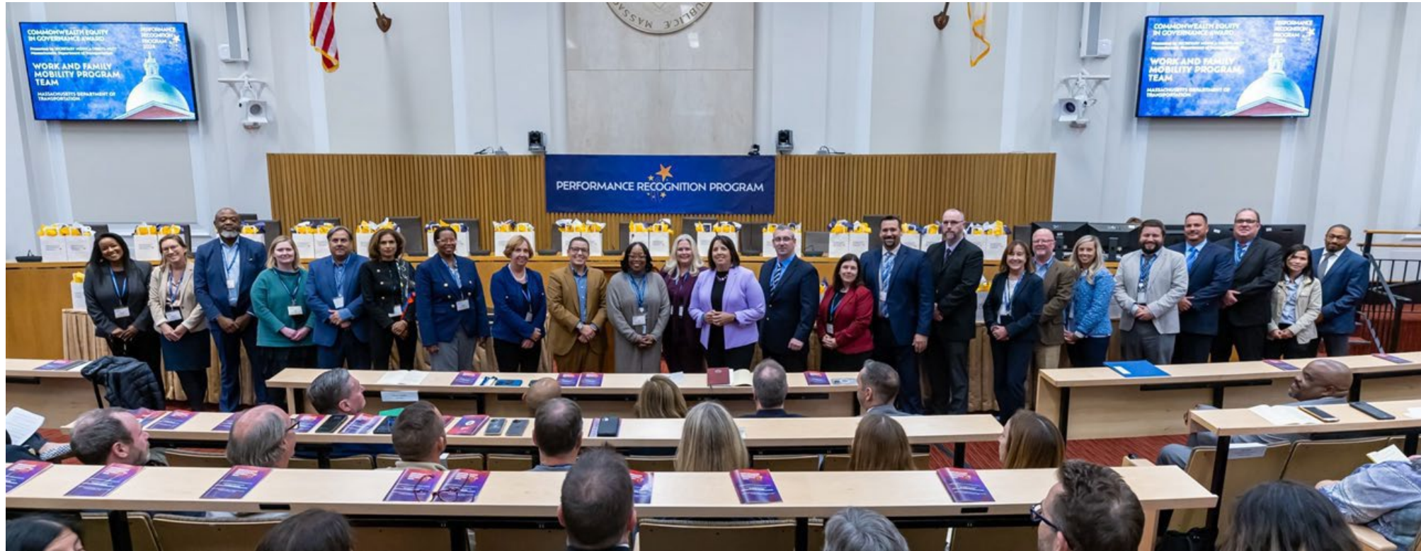
RMV Work and Family Mobility Team