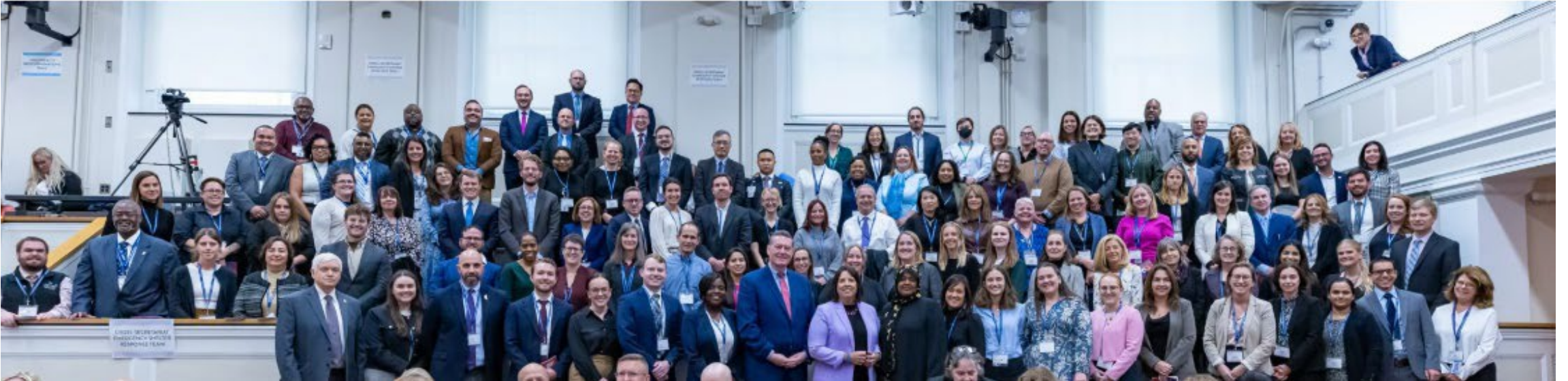
Emergency Shelter Incident Command Team