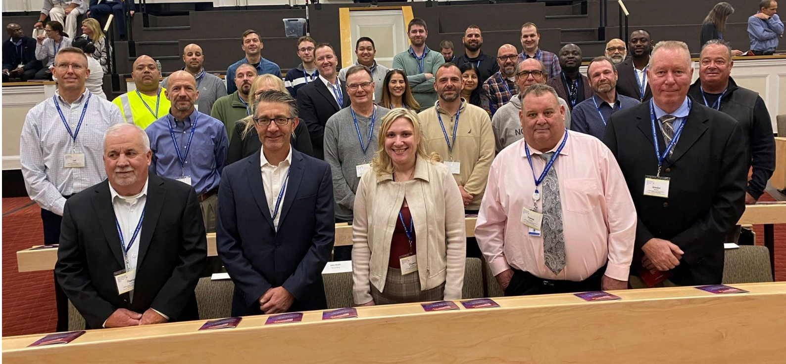
Leominster and Princeton Flooding Emergency Response Team