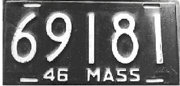
Year of Manufacture