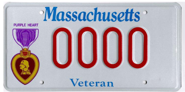
Older Version - Issued before Dec. 15, 2021