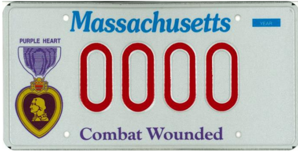
New design - Issued after Dec. 15, 2021