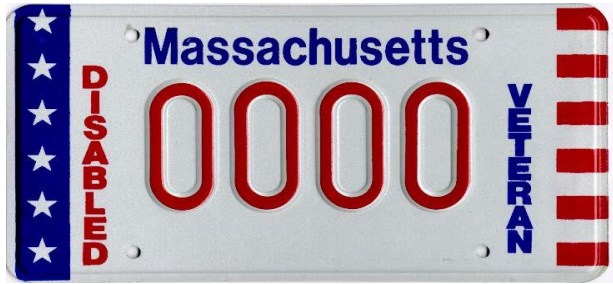
Older Design issued prior to 2005