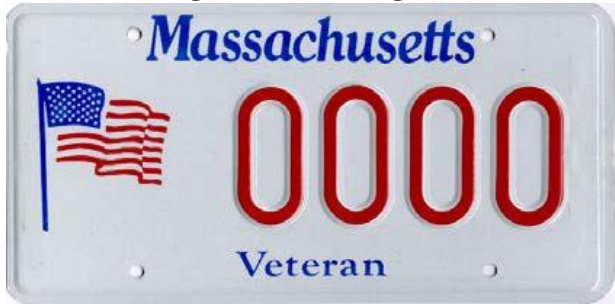
Figure 1 Veteran Flag Plate