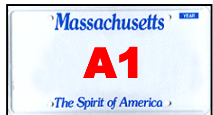
One Number, One Letter