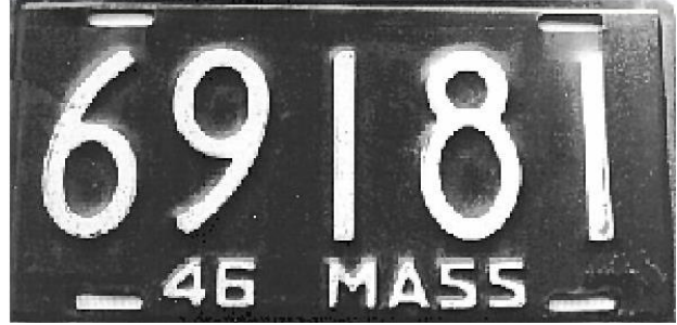
Year of Manufacture