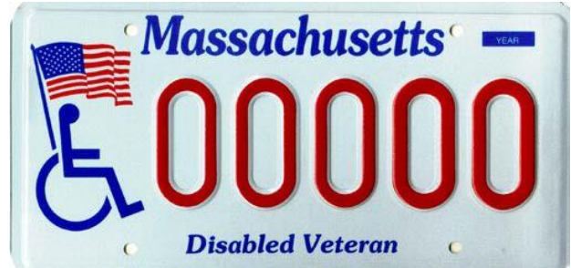
Newer Design issue after 2005