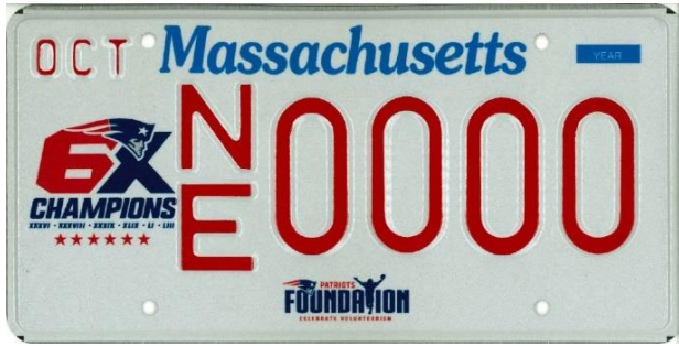
After October 22,2021