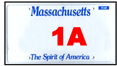
Two Numbers, One Letter