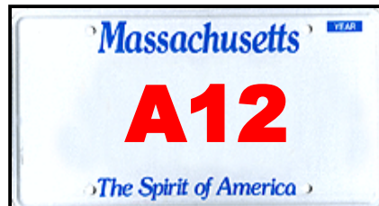
One Letter, Two Numbers