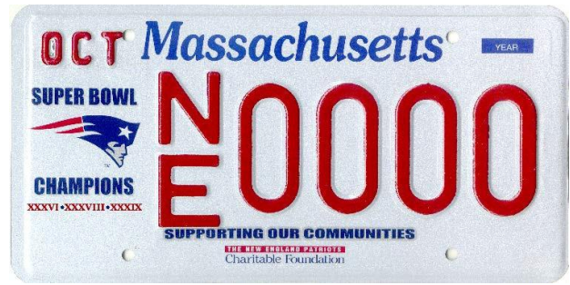
Before October 22,2021