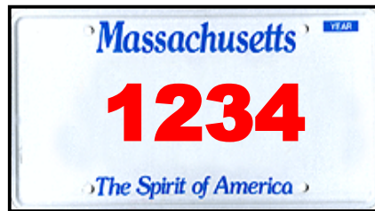
One Letter, One Number