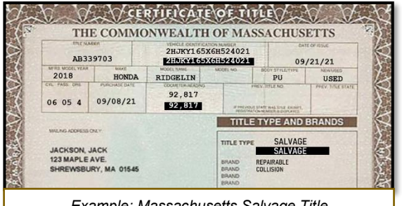
Example: Massachusetts Salvage Title