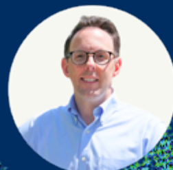
BRIAN ARRIGO, DCR