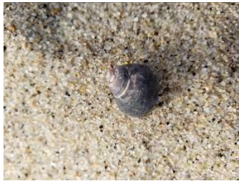
A periwinkle (snail) shell