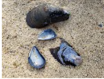
Blue mussel shells