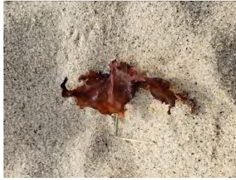
A cool piece of seaweed