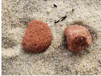
A red or orange rock