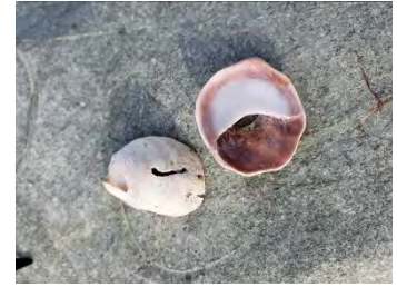
A slipper shell