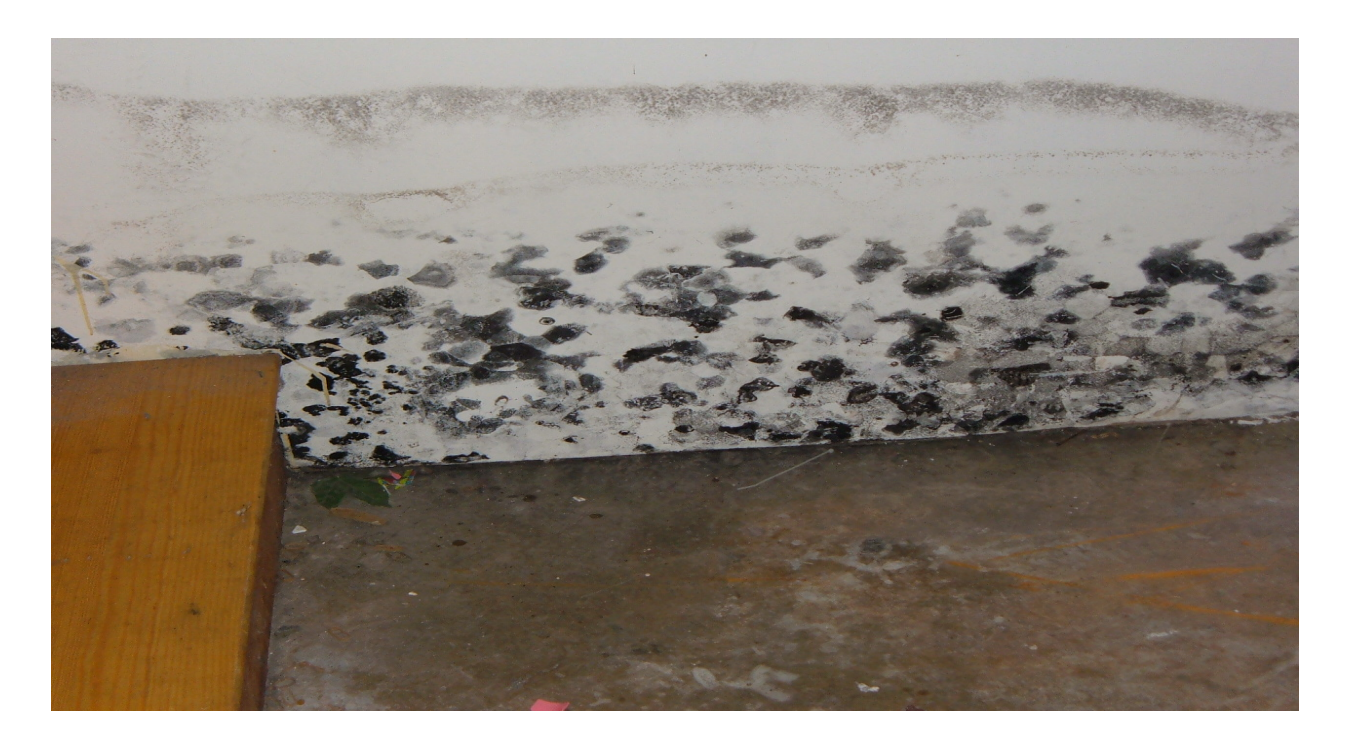
200-1 Development, Normandy Road – Basement – Mold on Wall

200-1 Development, Leyte Street and Normandy Road - Roof - Chimney in Disrepair