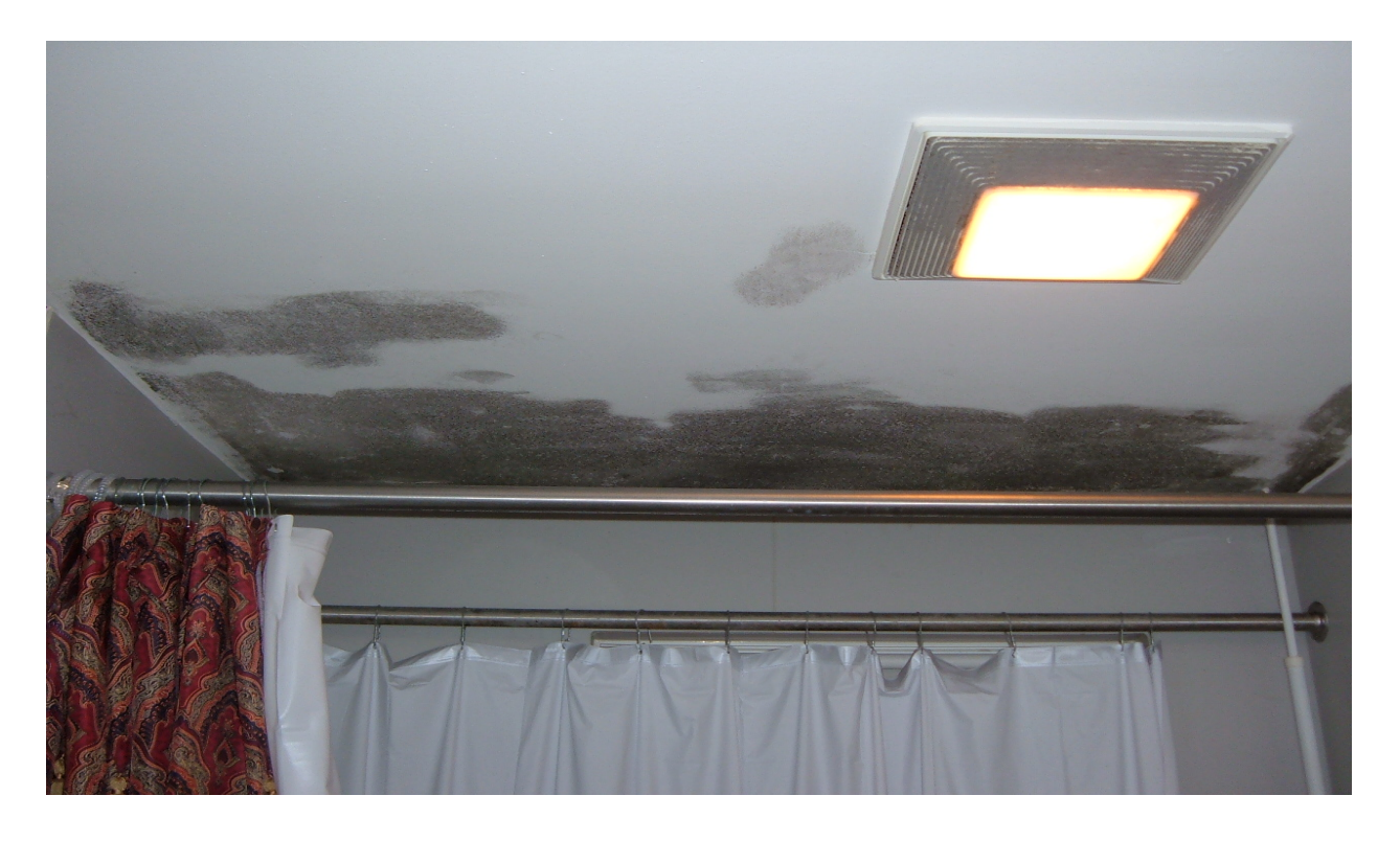
200-1 Development, Leyte Street – Mold on Bathroom Ceiling