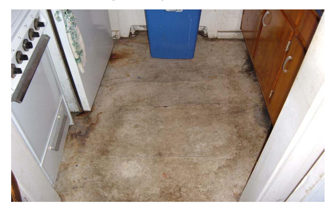
667-1 Development, Valley Street – Kitchen Floor in Disrepair