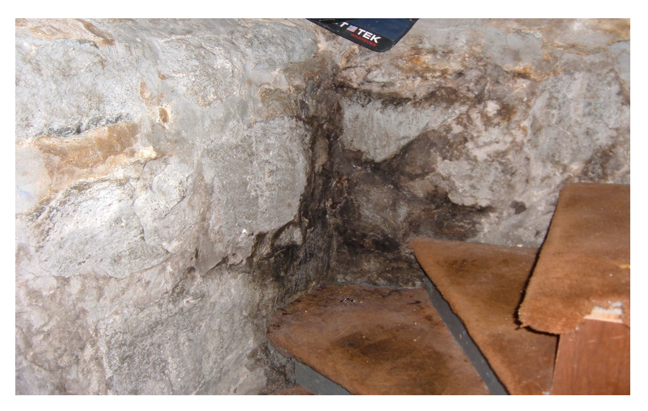
705-1 Development, Overland Street - Cellar Stairs in Disrepair