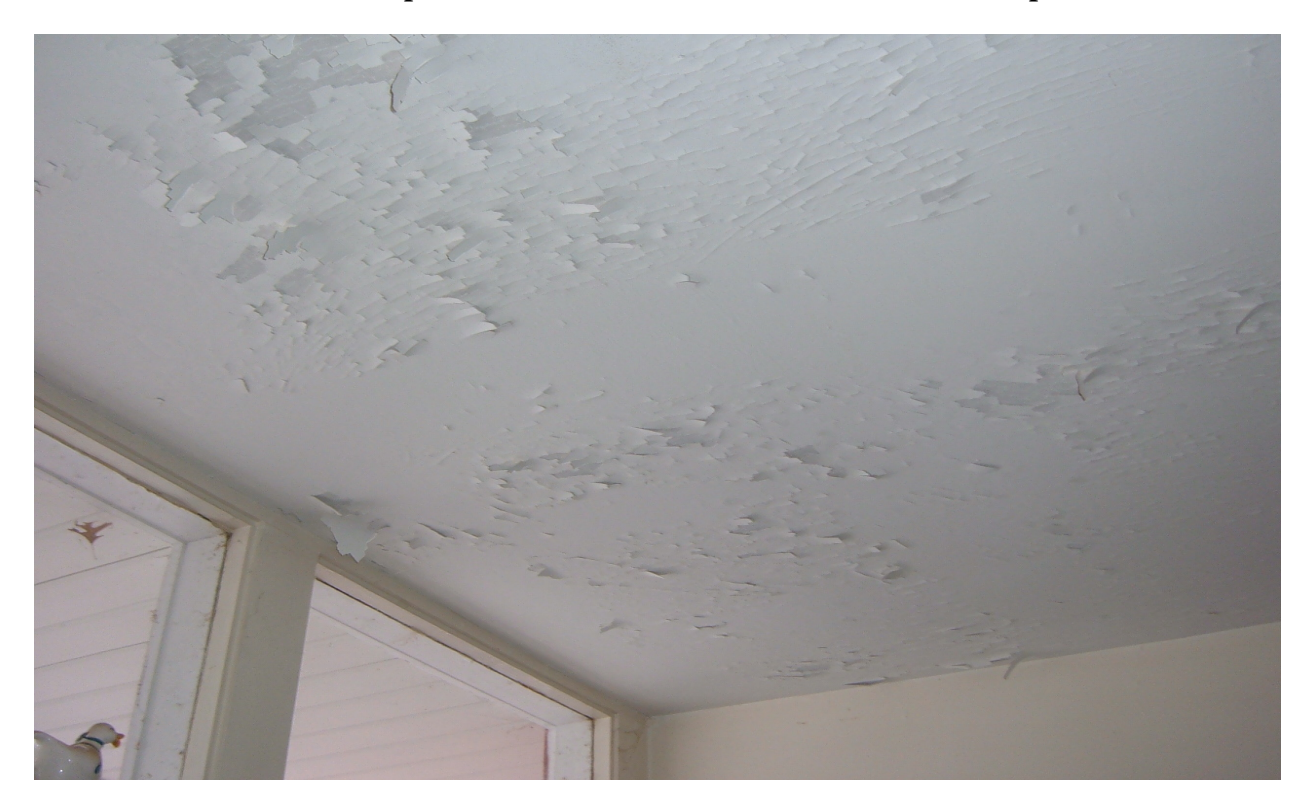
667-1 Development, Canton Street - Paint Peeling on Bedroom Ceiling