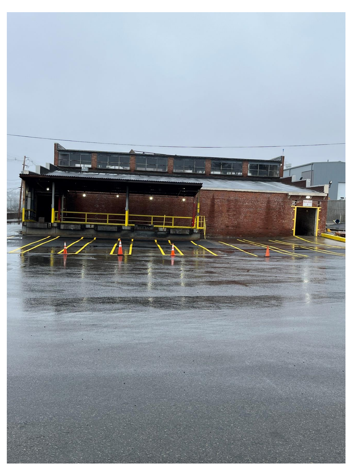
Repaired Truck Dock Area