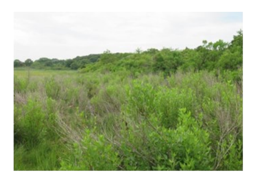
Tidal Shrubland at upland edge of salt marsh.

less than 25% tree canopy. The key difference from other types of Shrub Swamp is that Tidal Shrublands are restricted to the area of freshwater/brackish water tidal action on coastal rivers or where there is freshwater seepage along the edges of salt marshes just above the zone of regular salt water incursion. An additional difference is the presence of salt marsh plants mixed with the more usual freshwater species. Maritime Shrublands are upland communities. Shrubby areas within and at