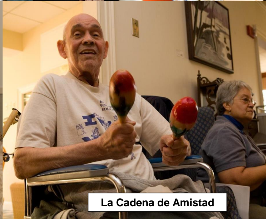
La Cadena de Amistad