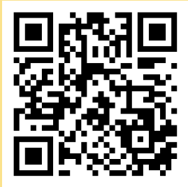
Massachusetts Resource Locator

If you need additional housing related support including housing vouchers, public housing, avoiding eviction, etc., please call 211 or use the EOHLC Resource Locator, a look-up tool to find housing assistance programs in your area.