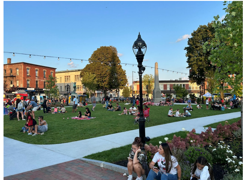
Downtown Common, Leominster