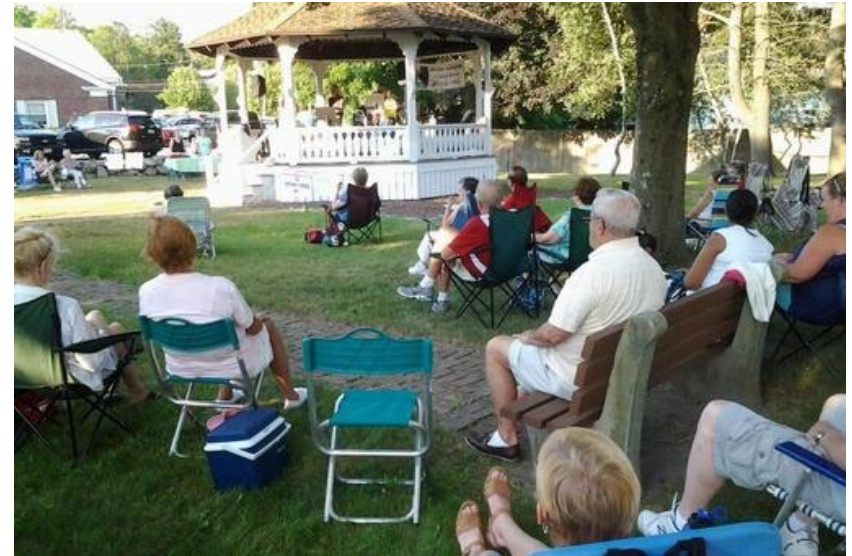
DeMarco Park, Avon