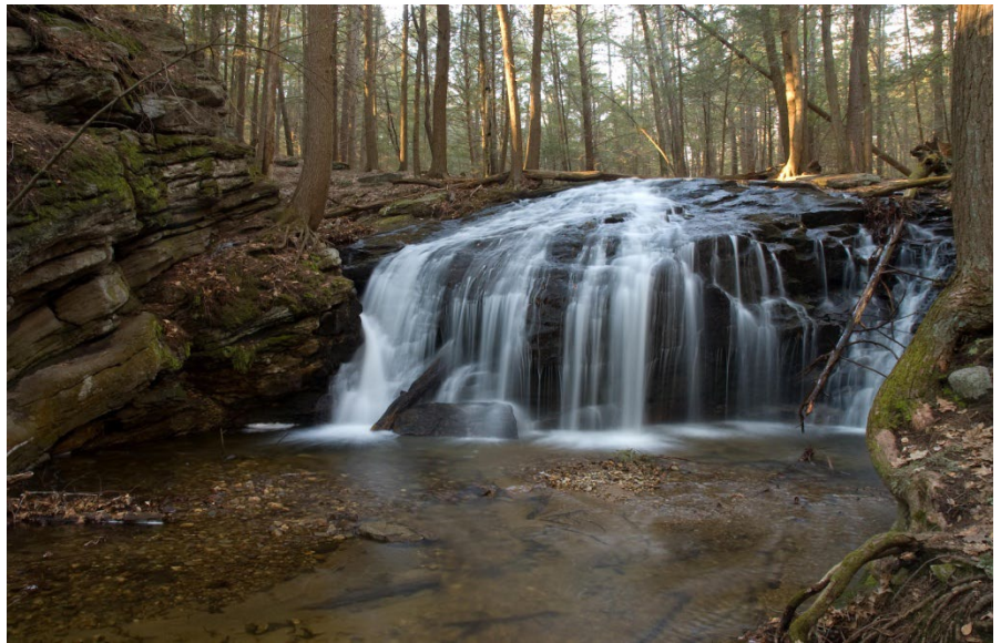
Holland Glen Forest, Belchertown