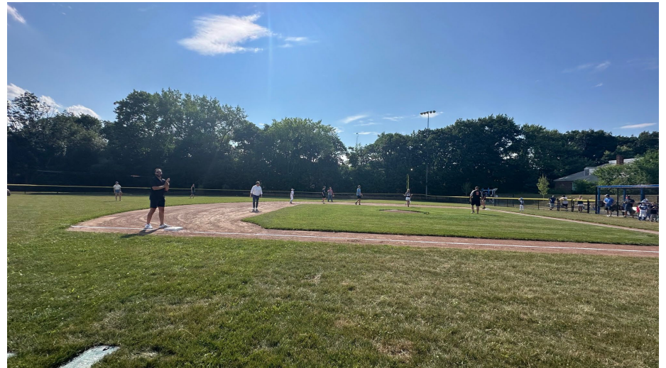
Medford, Gillis Field