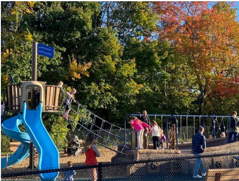
Gray's Beach, Kingston