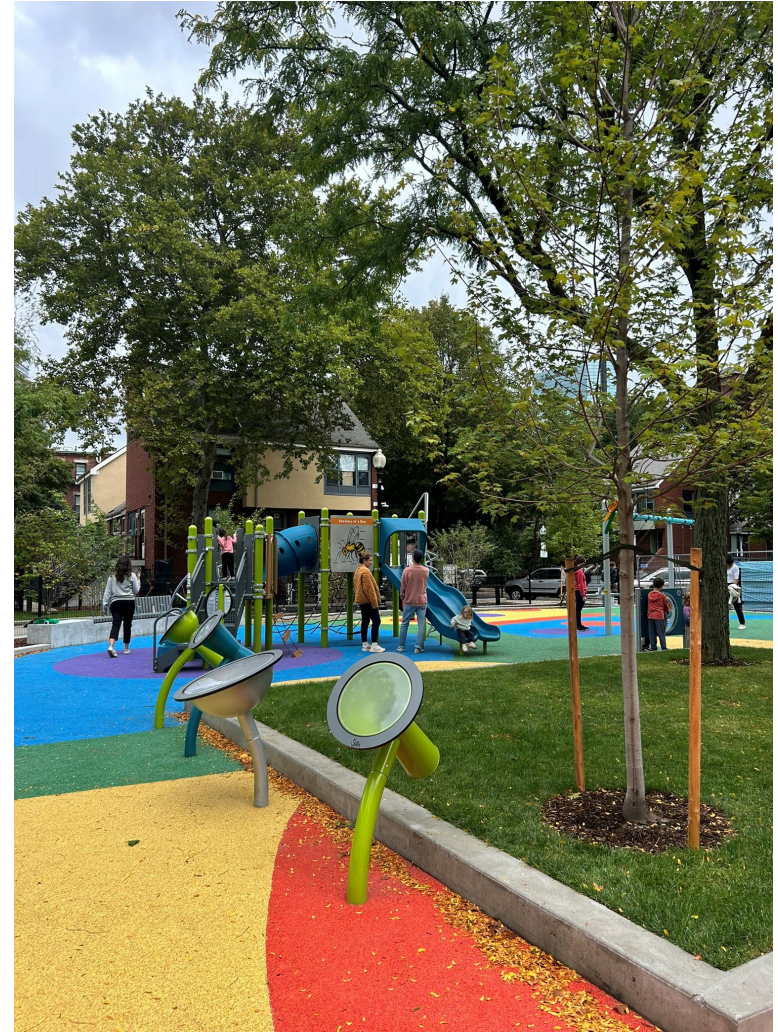
O'Day Playground, Boston