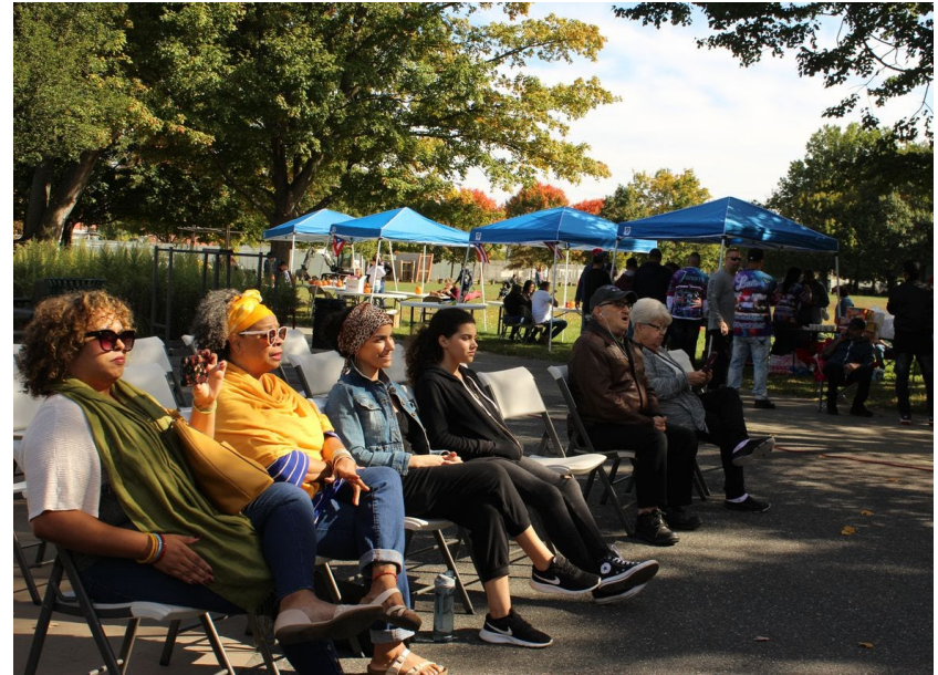
Kenefick Park, Springfield