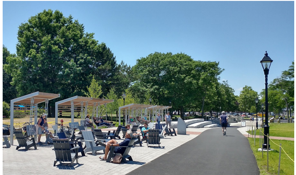
Market Landing Park, Newburyport