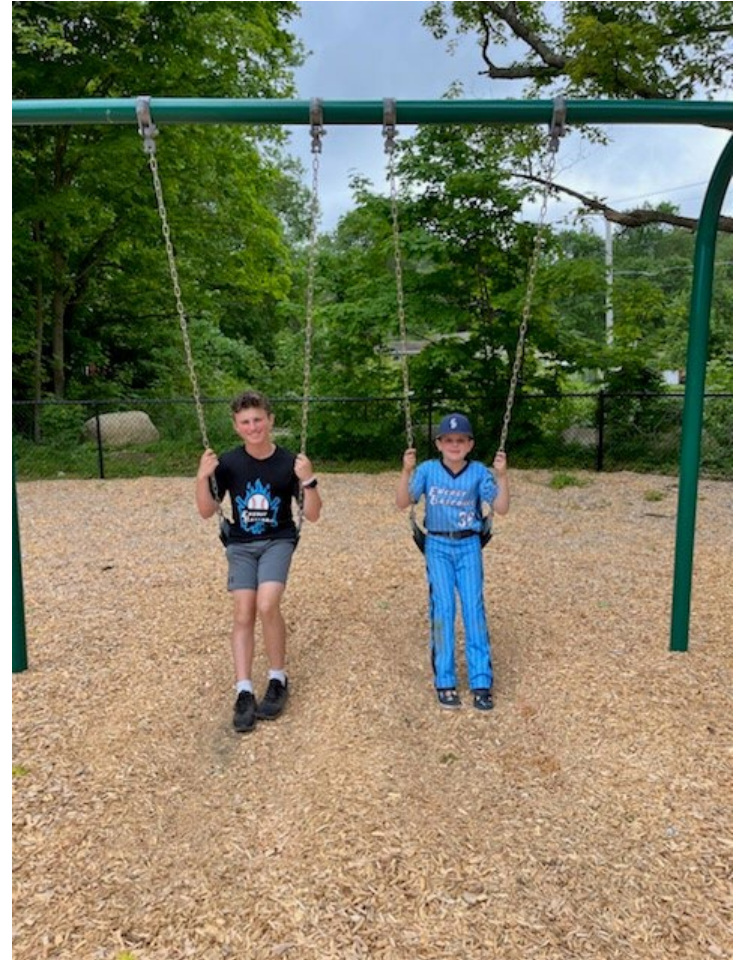
VanDyke Park, Sutton