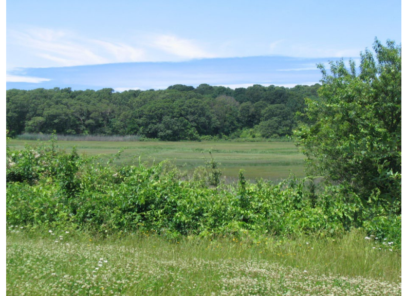
Punkhorn Parklands, Brewster