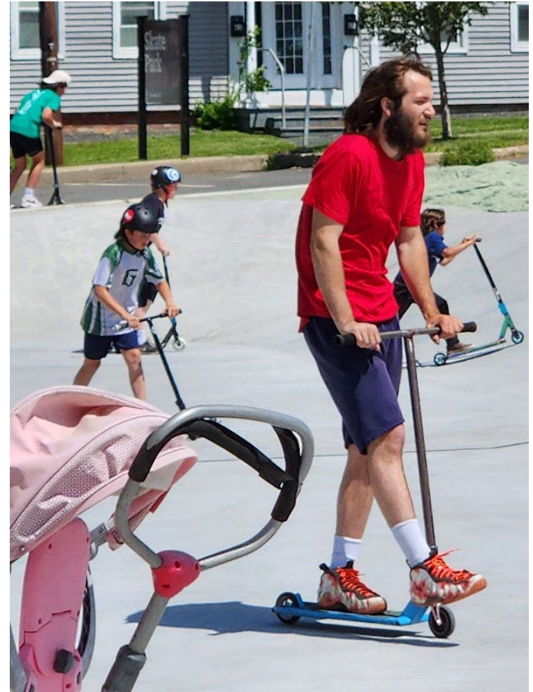
Skate Park, Greenfield