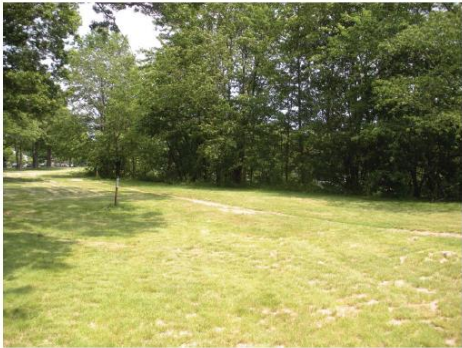
Existing condition along the River