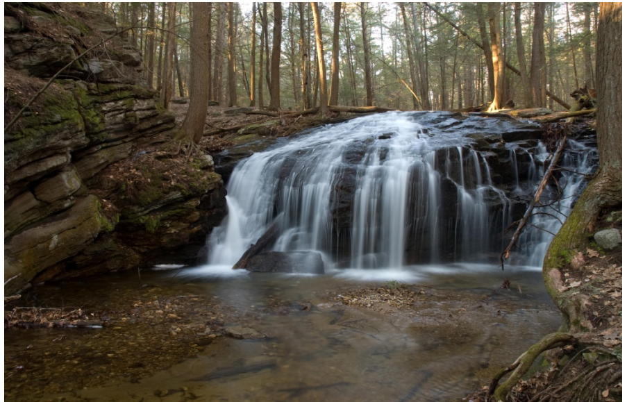
Holland Glen Forest, Belchertown