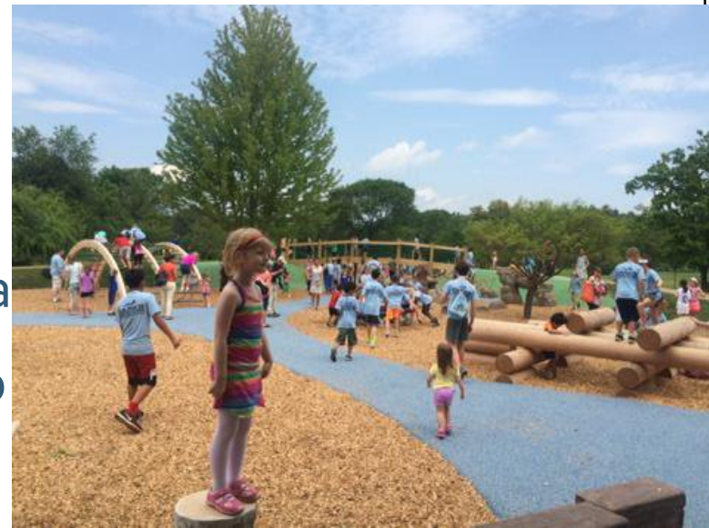
Cushing Memorial Park, Framingham