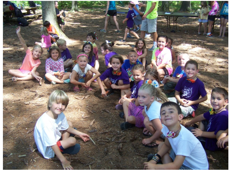
Camp Paradise, Beverly