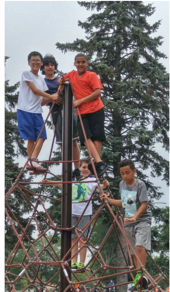
Hazelwood Park, New Bedford