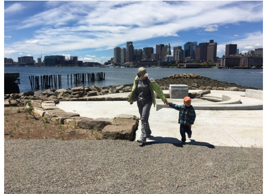
LoPresti Park, Boston