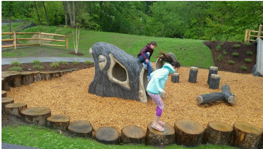
Erving Riverfront Park