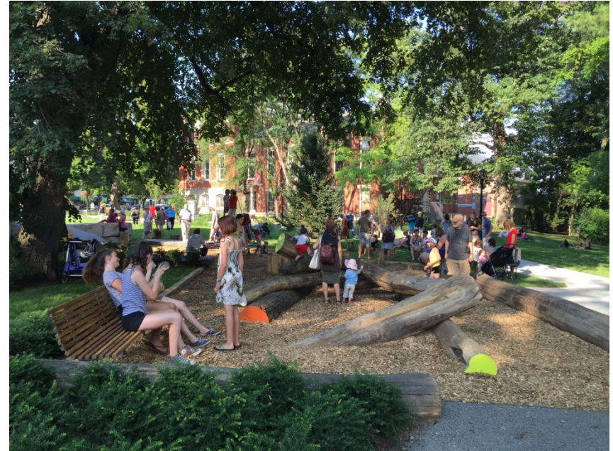
Pulaski Park, Northampton