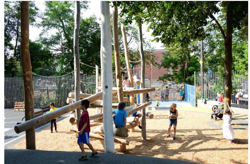
Hoyt-Sullivan Park, Somerville